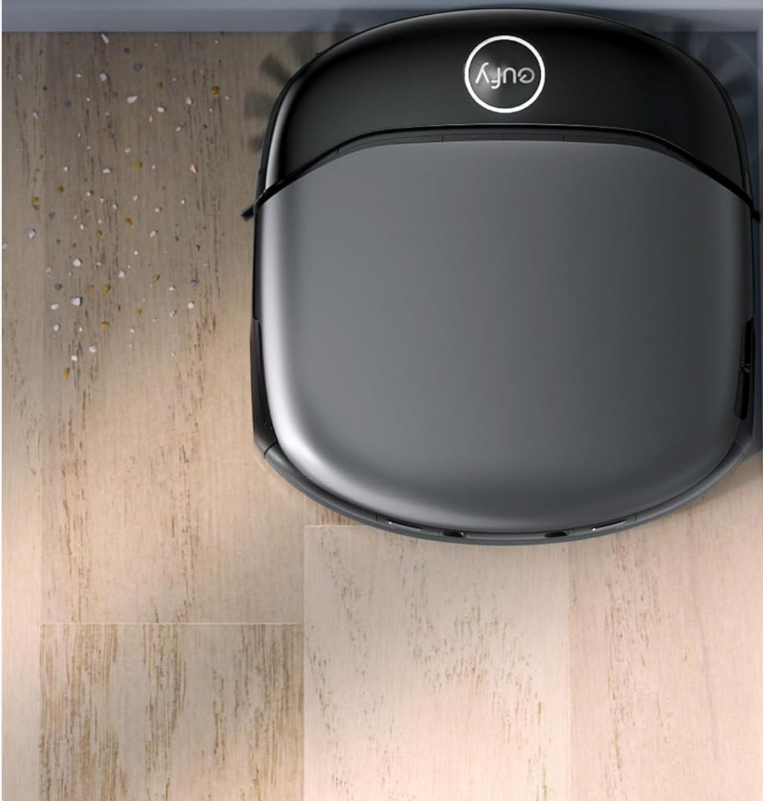
Illustration of the 3D MatrixEye Obstacle Avoidance system, demonstrating its ability to detect and navigate around objects with 300K voxels and 750x more precise navigation, even in low light conditions.

Equipped with 3D MatrixEye technology, the robot precisely maps your home and avoids obstacles, even in low-light conditions, ensuring a smooth and efficient cleaning path.