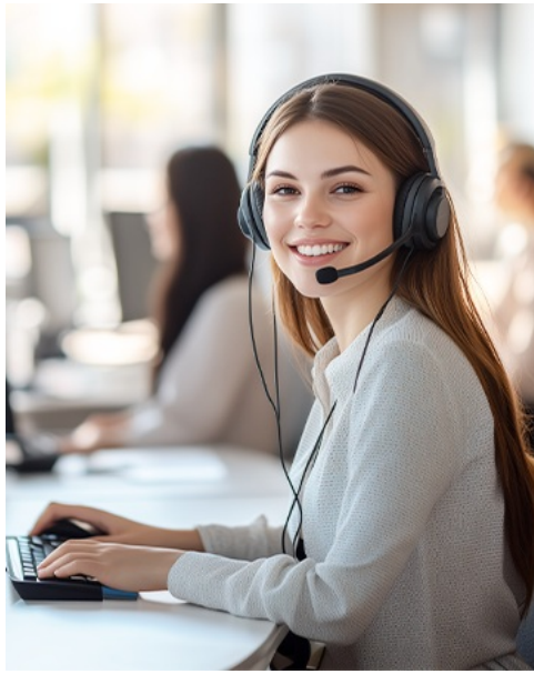
Image: ACEMAGIC offline maintenance service details.