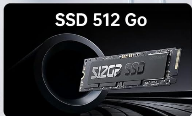
Image: Overview of ACEMAGIC AX18 laptop features including Intel Twin Lake-N150 processor, 18.5-inch screen, Bluetooth 5.0, 8000mAh battery, Wi-Fi 5, efficient fan cooling, 16GB DDR4 RAM, and 512GB SSD.