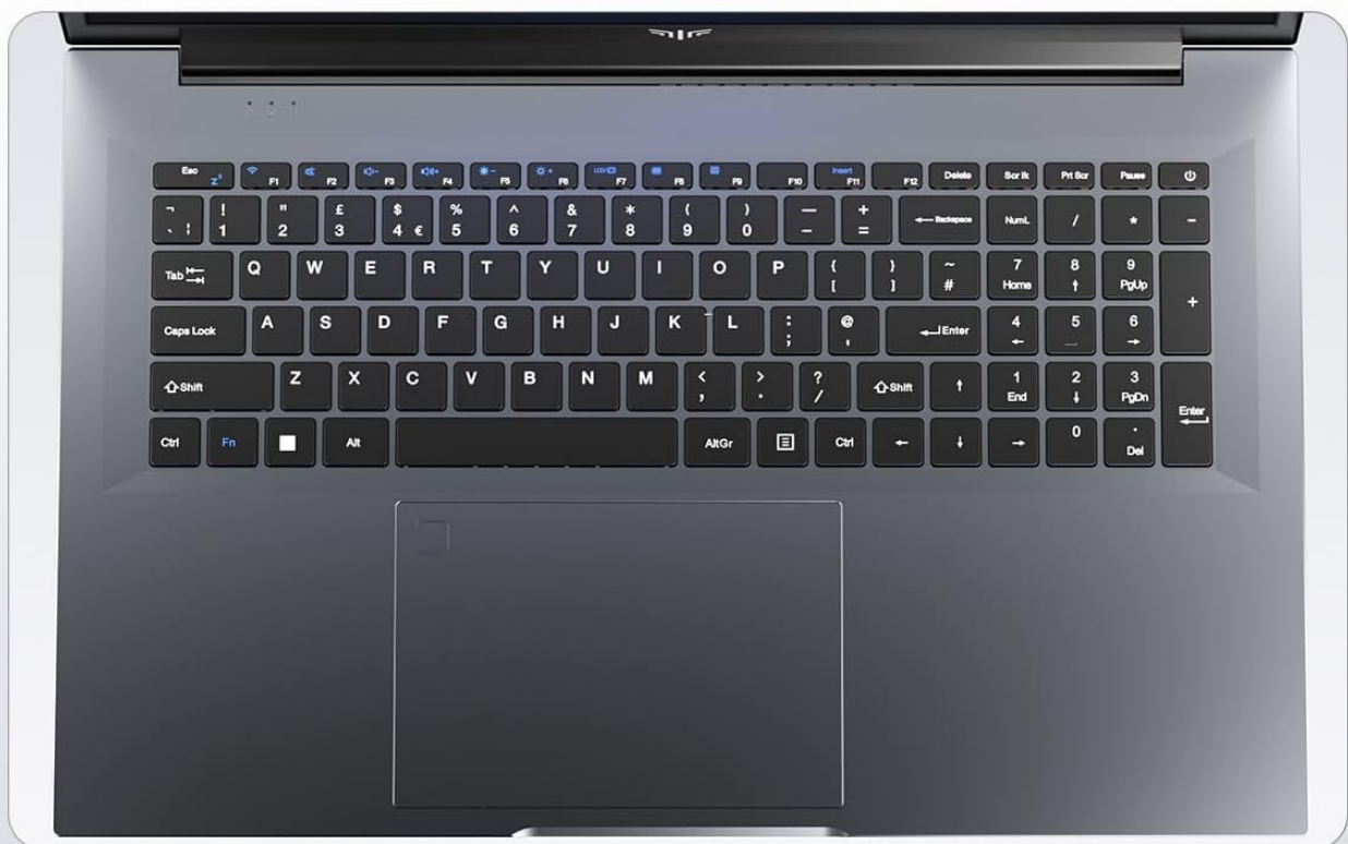
Image: Top-down view of the ACEMAGIC AX18 laptop's full QWERTY keyboard with numeric keypad and large tactile touchpad.