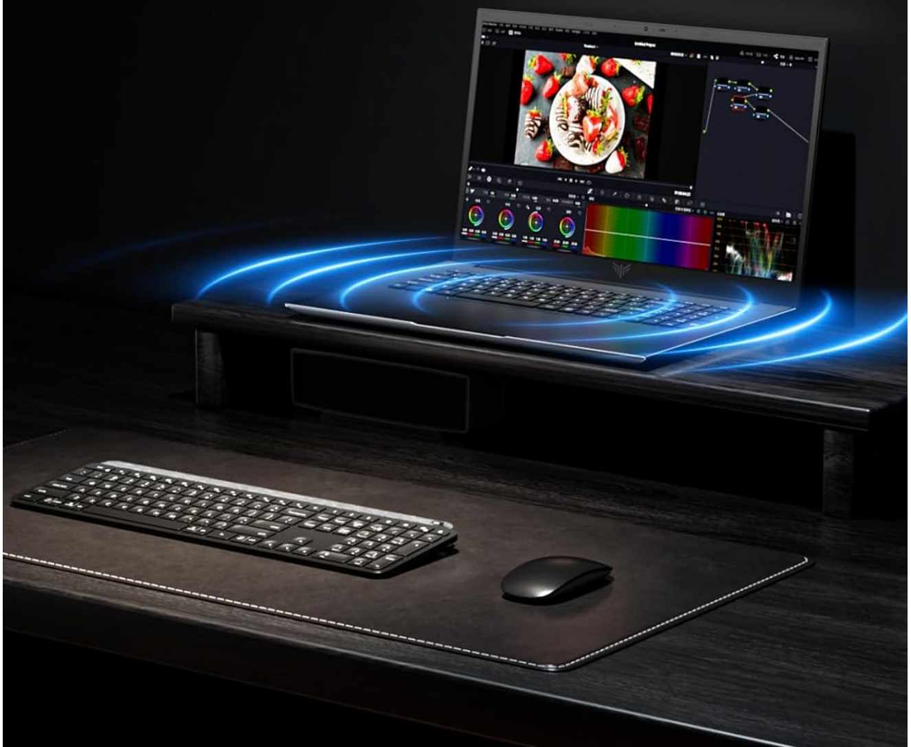
Image: ACEMAGIC AX18 laptop connected wirelessly to a keyboard and mouse, illustrating stable Wi-Fi 5 and Bluetooth 5.0 data connection capabilities.