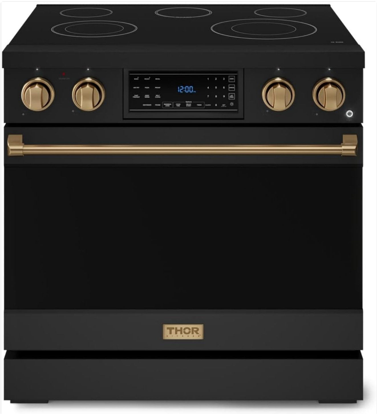
Figure 1: Front view of the 36-inch Professional Electric Range.