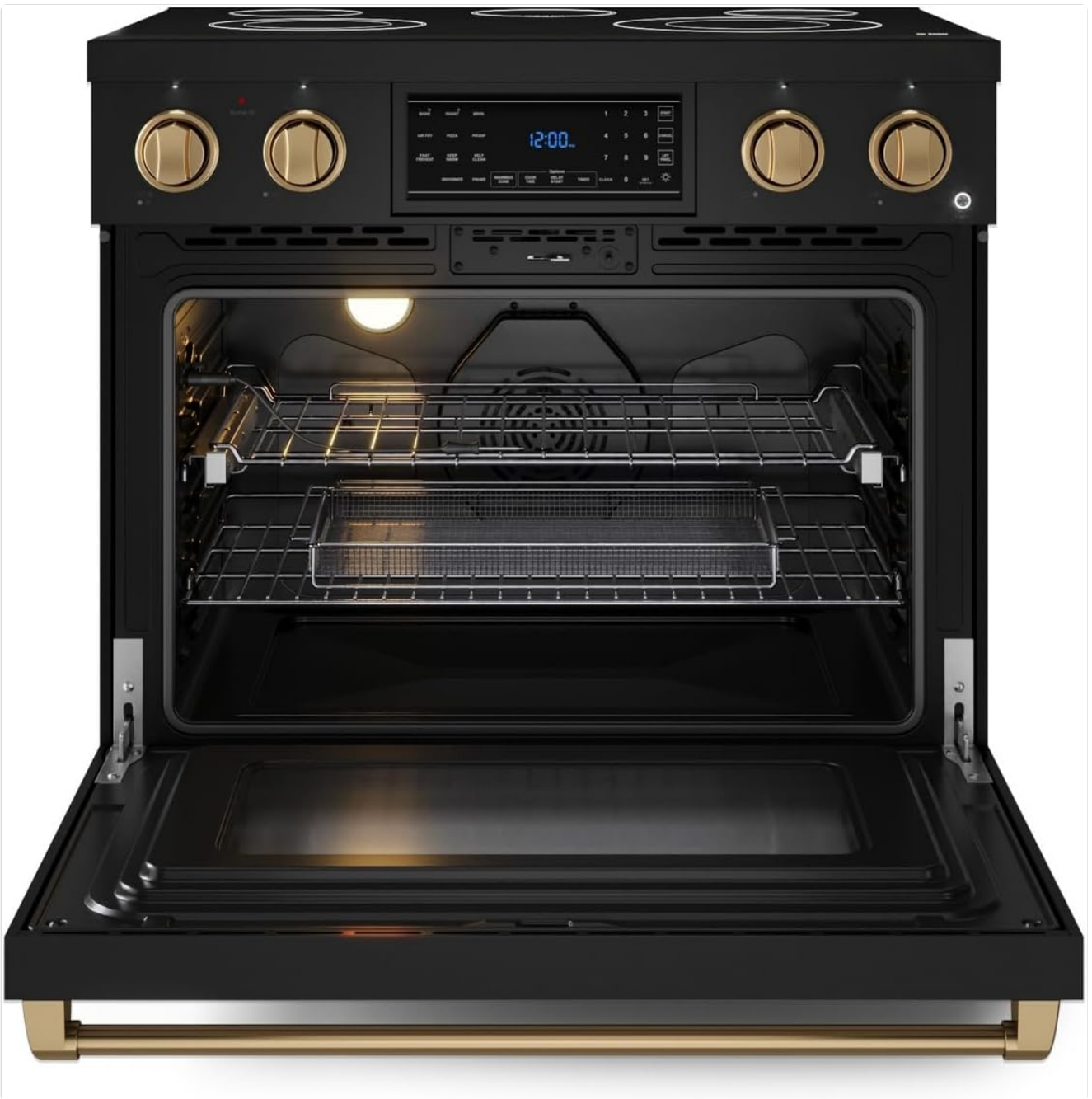
Figure 5: Oven interior with racks and air fry basket.