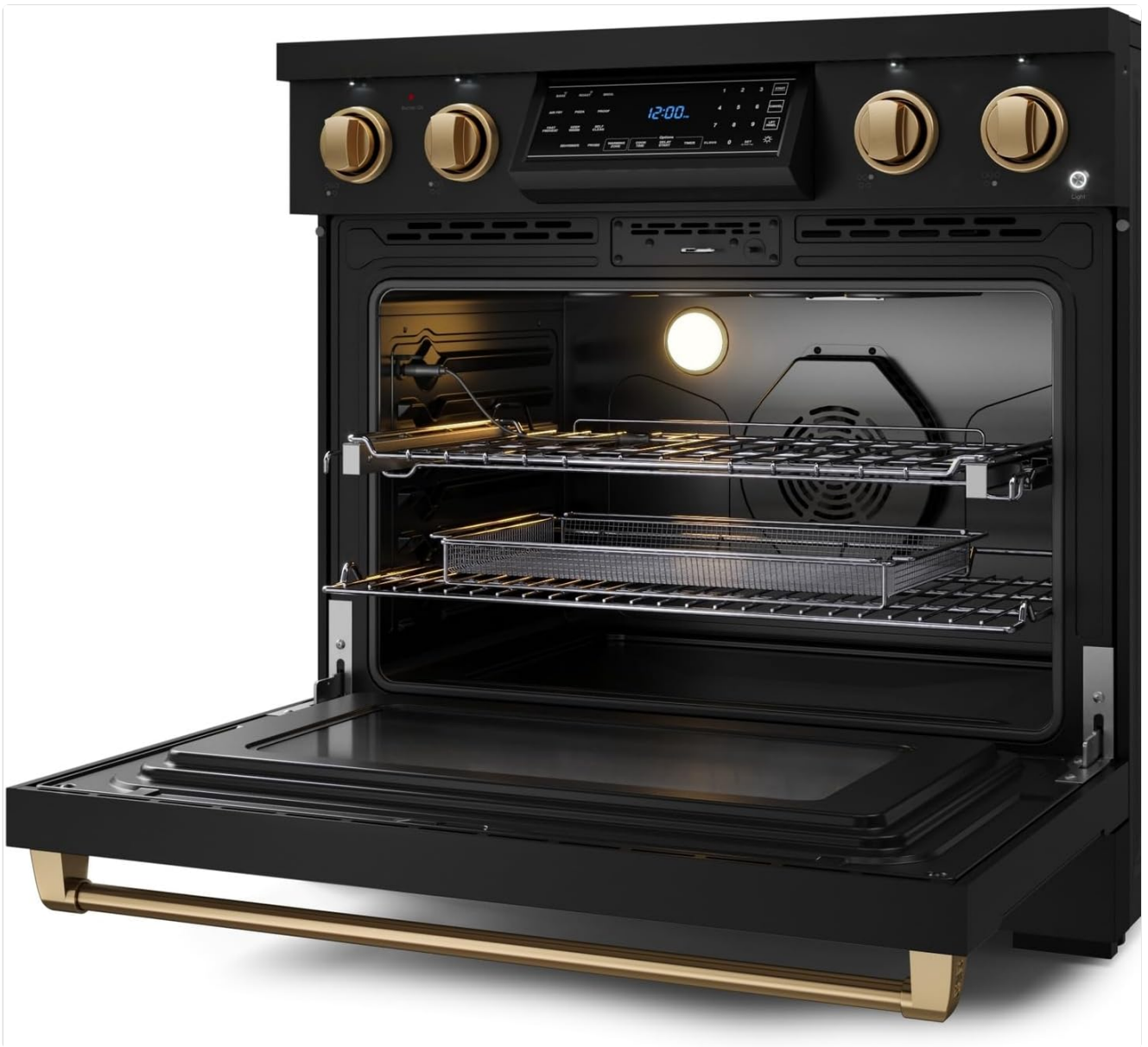
Figure 6: Angled view of the oven interior, showing the convection fan.