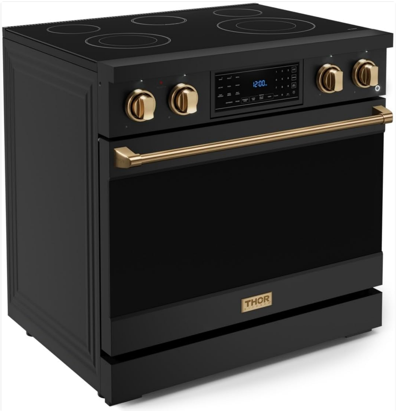
Figure 2: Angled view of the range, highlighting its freestanding design.