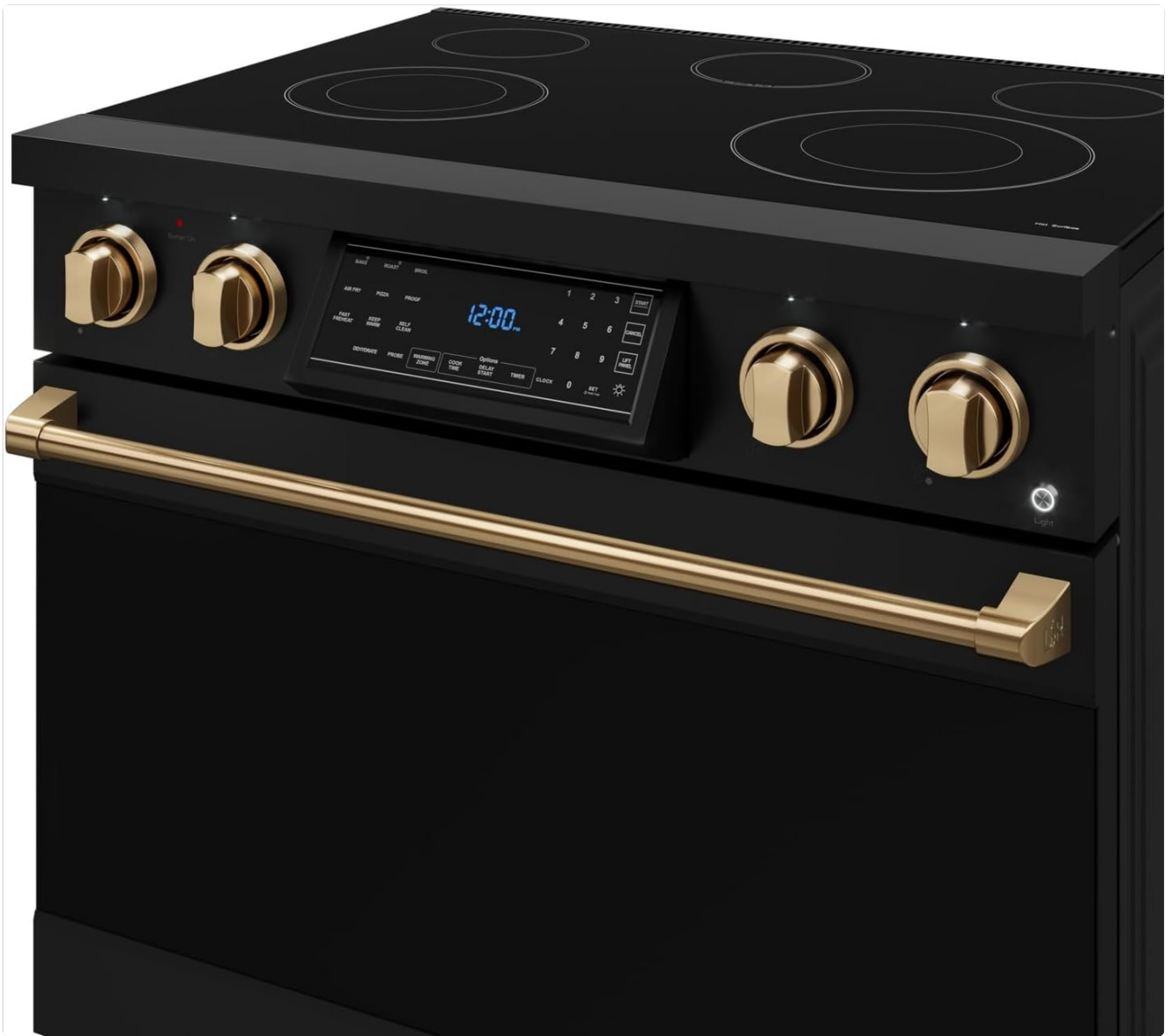
Figure 4: Top view of the radiant electric cooktop.