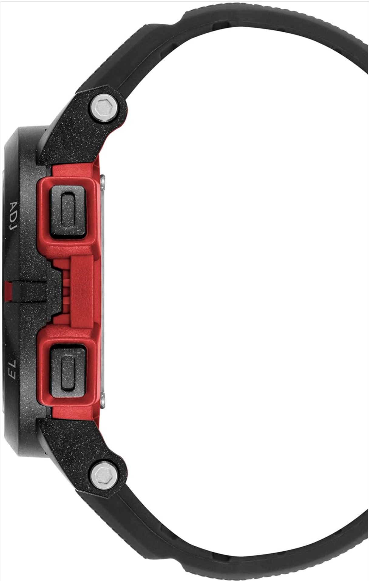
Figure 2: Side view of the watch, highlighting the 'ADJ' (Adjust) and 'EL' (Electroluminescent backlight) buttons on the left side of the case.