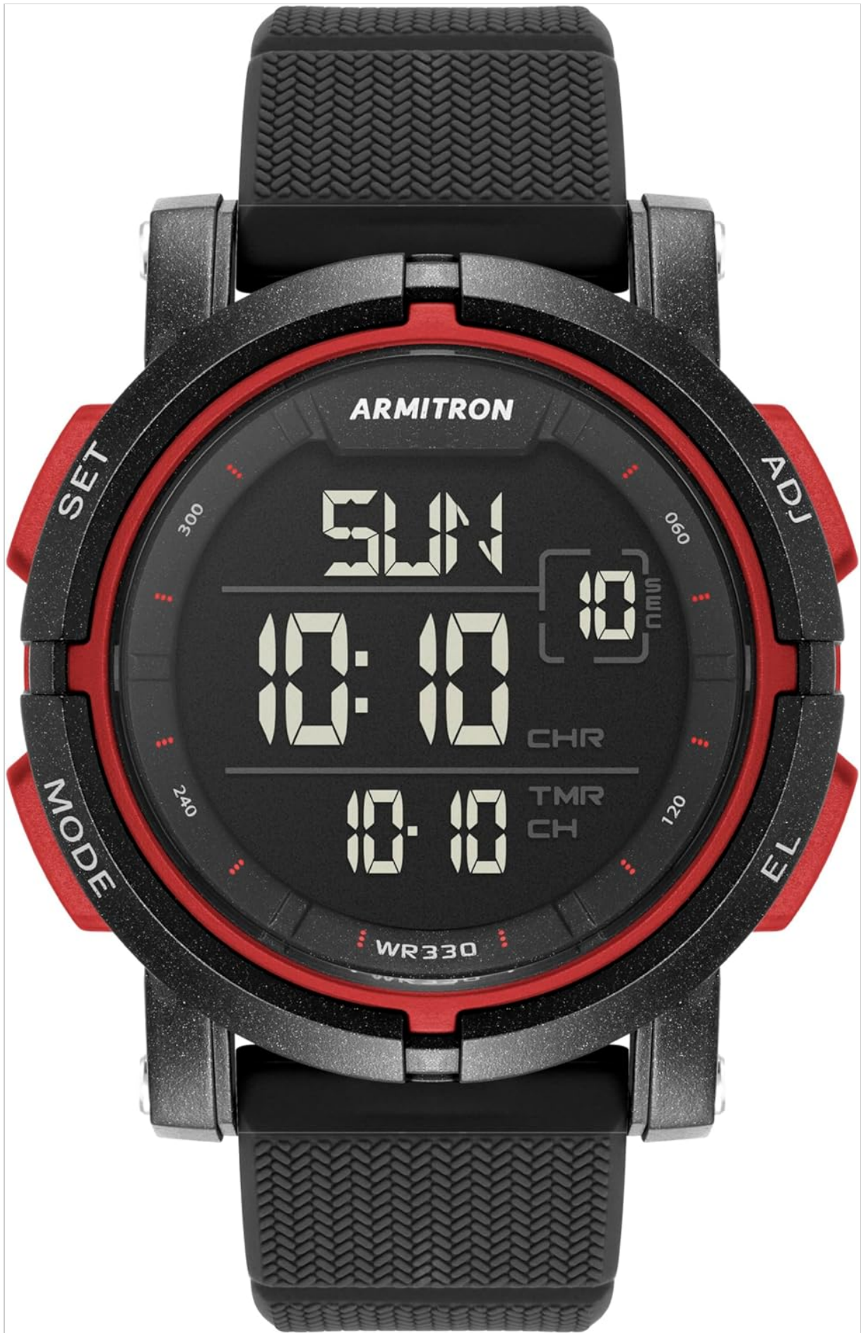
Figure 1: Front view of the Armitron Sport Digital Chronograph Watch, Model 40/8509RBK, showcasing the digital display and red/black case design.