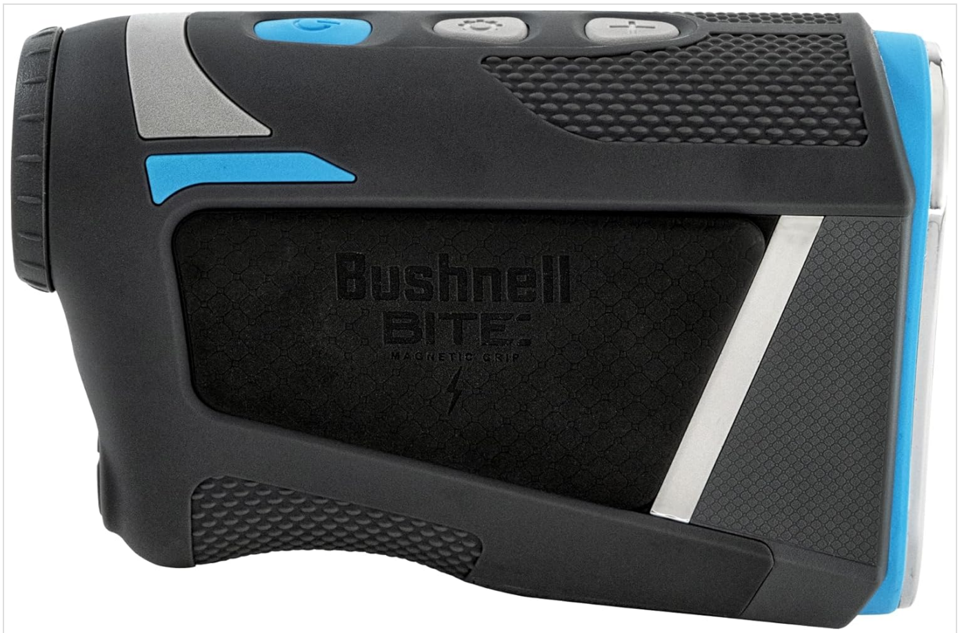
Image: The Bushnell Golf Tour Hybrid Laser Rangefinder showcasing its integrated BITE magnetic cart mount on the side.