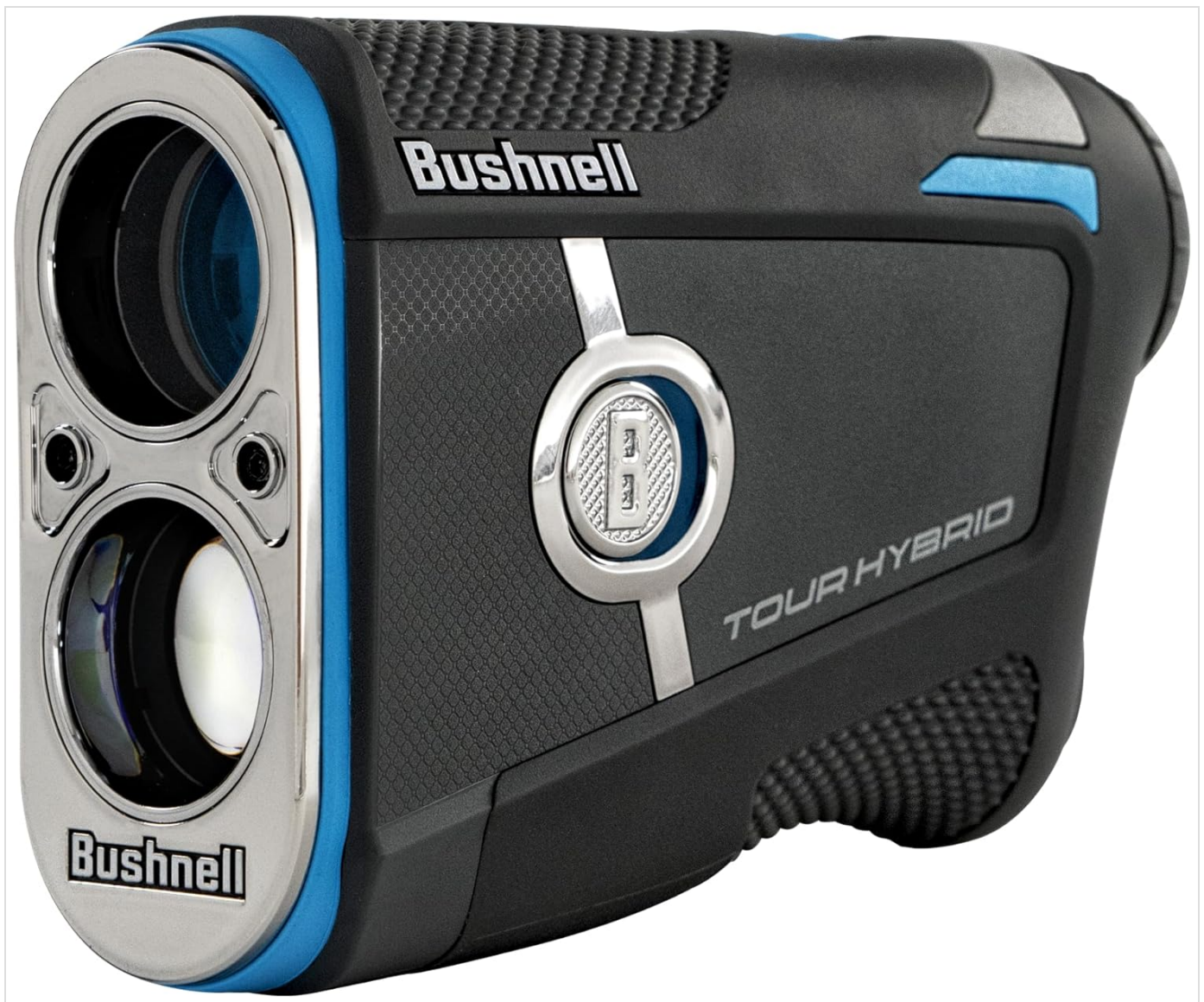
Image: Side view of the Bushnell Golf Tour Hybrid Laser Rangefinder, showcasing its compact design and blue accents.