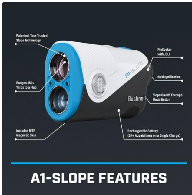
Diagram illustrating the Pinseeker with JOLT technology for accurate flag targeting.

For precise flag targeting, utilize Pinseeker with JOLT. When multiple objects are in the field of view, Pinseeker prioritizes the closest object (the flag). Once the flag is acquired, the device will provide short vibrating pulses (JOLT) to confirm that you have locked onto the flag, giving you confidence in your measurement.