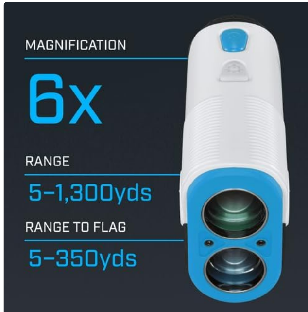
Visual representation of the 6x magnification and ranging capabilities of the A1-Slope.

To obtain a distance measurement, look through the eyepiece and press the power/fire button once. Aim the reticle at your desired target. The distance will be displayed in yards (Y) or meters (M) depending on your selected unit. The A1-Slope offers 6x magnification for clear viewing of targets up to 1,300 yards.