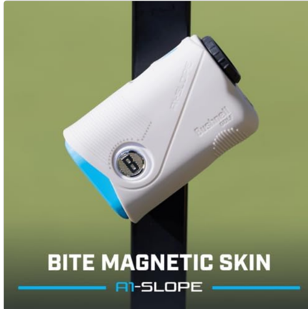
The Bushnell Golf A1-Slope package contents, including the rangefinder and accessories.

Upon opening the package, ensure all components are present and in good condition. The package should include the A1-Slope Rangefinder, BITE Magnetic Skin, Premium Carry Case, USB-C Charging Cord, and this User Manual.