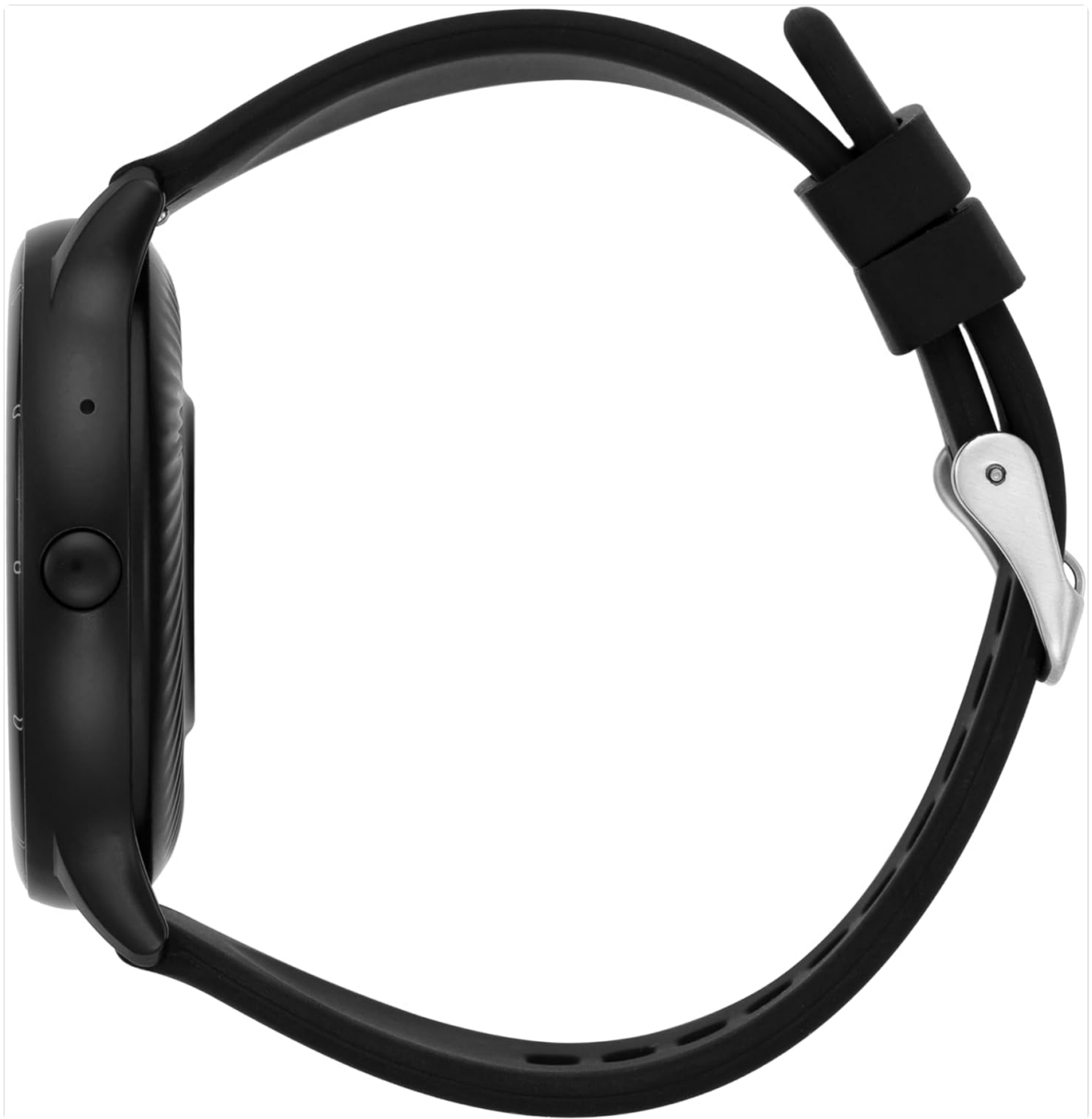
Figure 3: Side view of the smartwatch, showing its slim profile and how it sits on the wrist. The watch has a black case and a black silicone strap with a silver buckle.