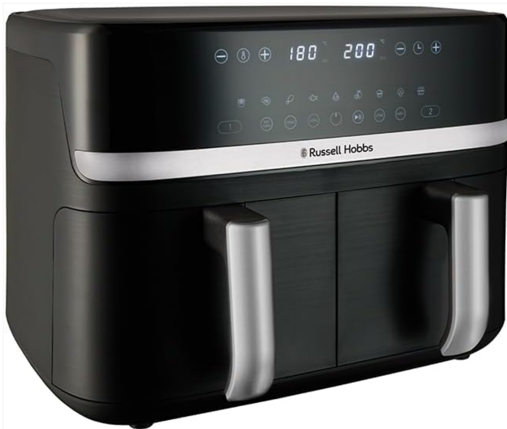
Figure 1: Front view of the Russell Hobbs Satisfry 9L Dual Basket Air Fryer, showcasing its sleek design and digital control panel.