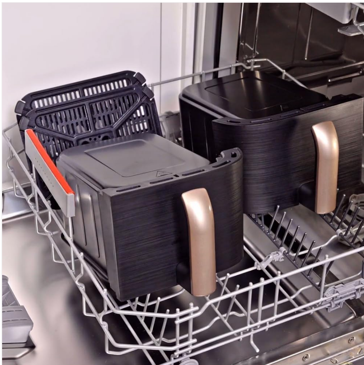
Figure 6: The cooking baskets and crisping plates positioned in a dishwasher, illustrating their dishwasher-safe design for effortless cleaning.