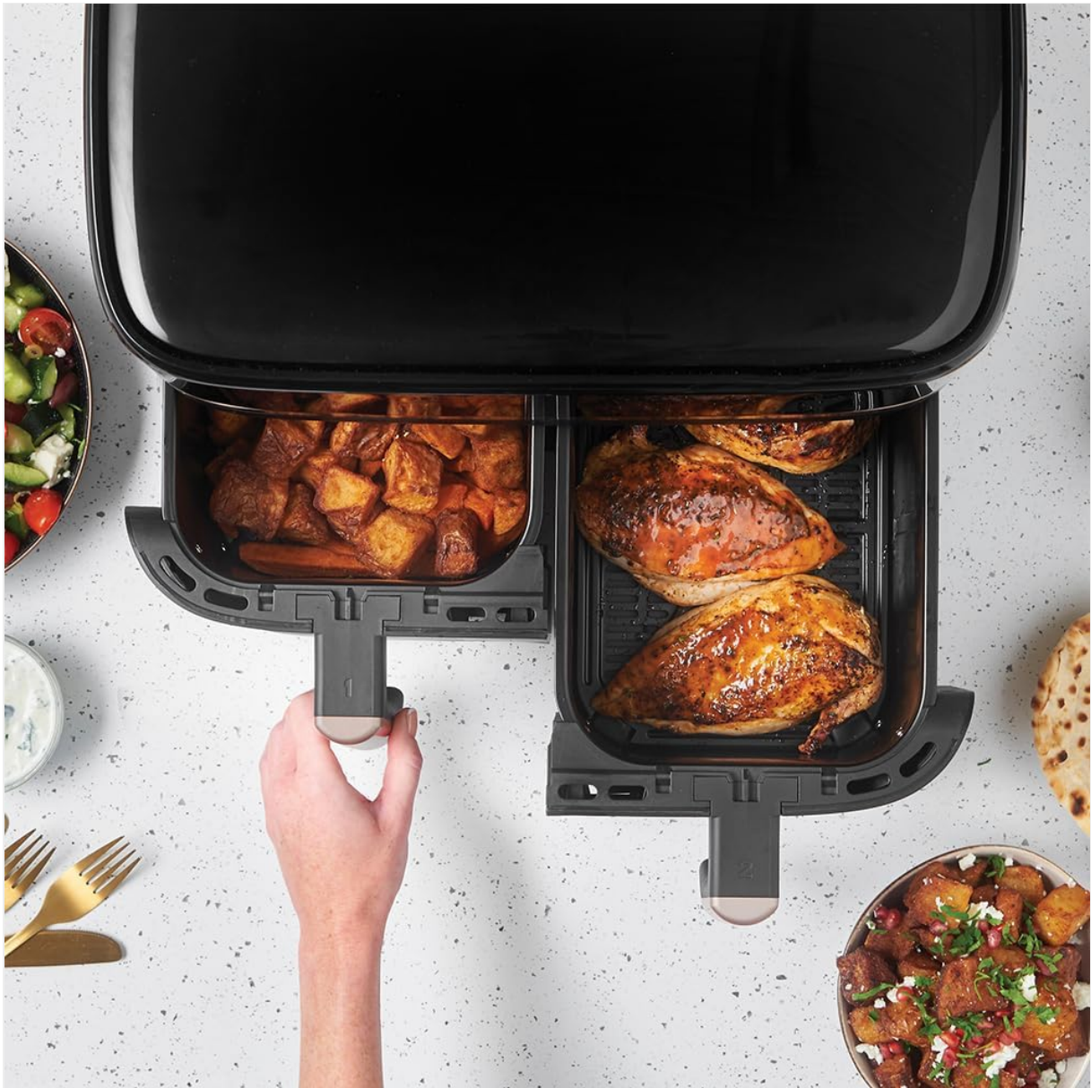
Figure 5: An overhead perspective illustrating the dual baskets filled with different food items, such as roasted potatoes and chicken breasts, highlighting the appliance's versatility.