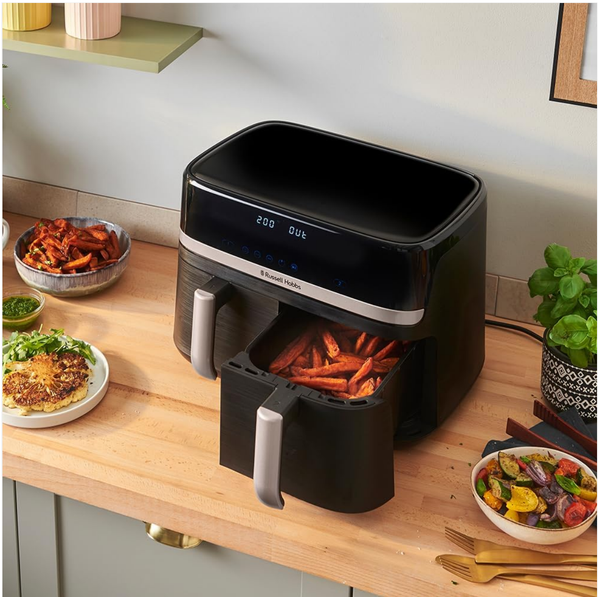
Figure 4: The air fryer in operation on a kitchen counter, demonstrating one basket pulled out to reveal perfectly cooked sweet potato fries.