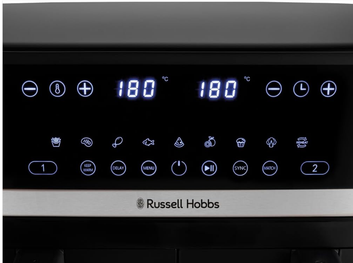
Figure 3: Detailed view of the intuitive digital control panel, showing temperature and time adjustments, and dedicated buttons for presets and smart functions.

The digital control panel allows you to manage all cooking functions. It features touch controls for temperature, time, and various preset programs.