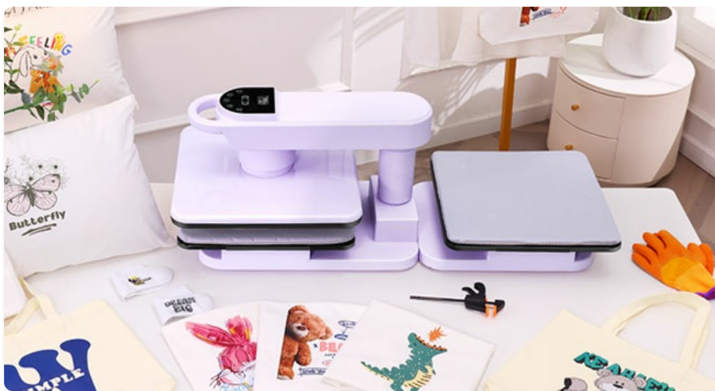
Image: Detailed view of the dual-tube heating system for uniform temperature, the 15x15 inch heating plate, anti-slip insulation pad, and the auto shut-off function.

Image: The heat press highlighting its increased heating height of 1.85 inches, allowing for transfers on thicker items beyond standard t-shirts.