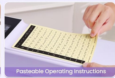
Pasteable Operating Instructions

Image: Close-up of the heat press demonstrating the 360-degree rotation of the upper heating plate and the secure attachment of the F-shaped clamp to the table.