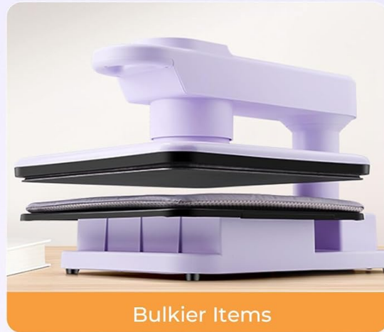
Image: The heat press highlighting its increased heating height of 1.85 inches, allowing for transfers on thicker items beyond standard t-shirts.