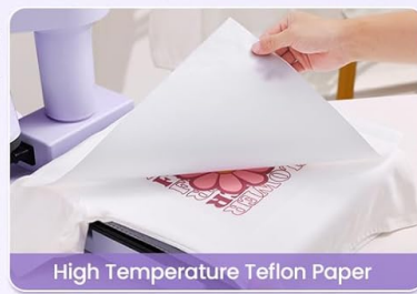
High Temperature Teflon Paper