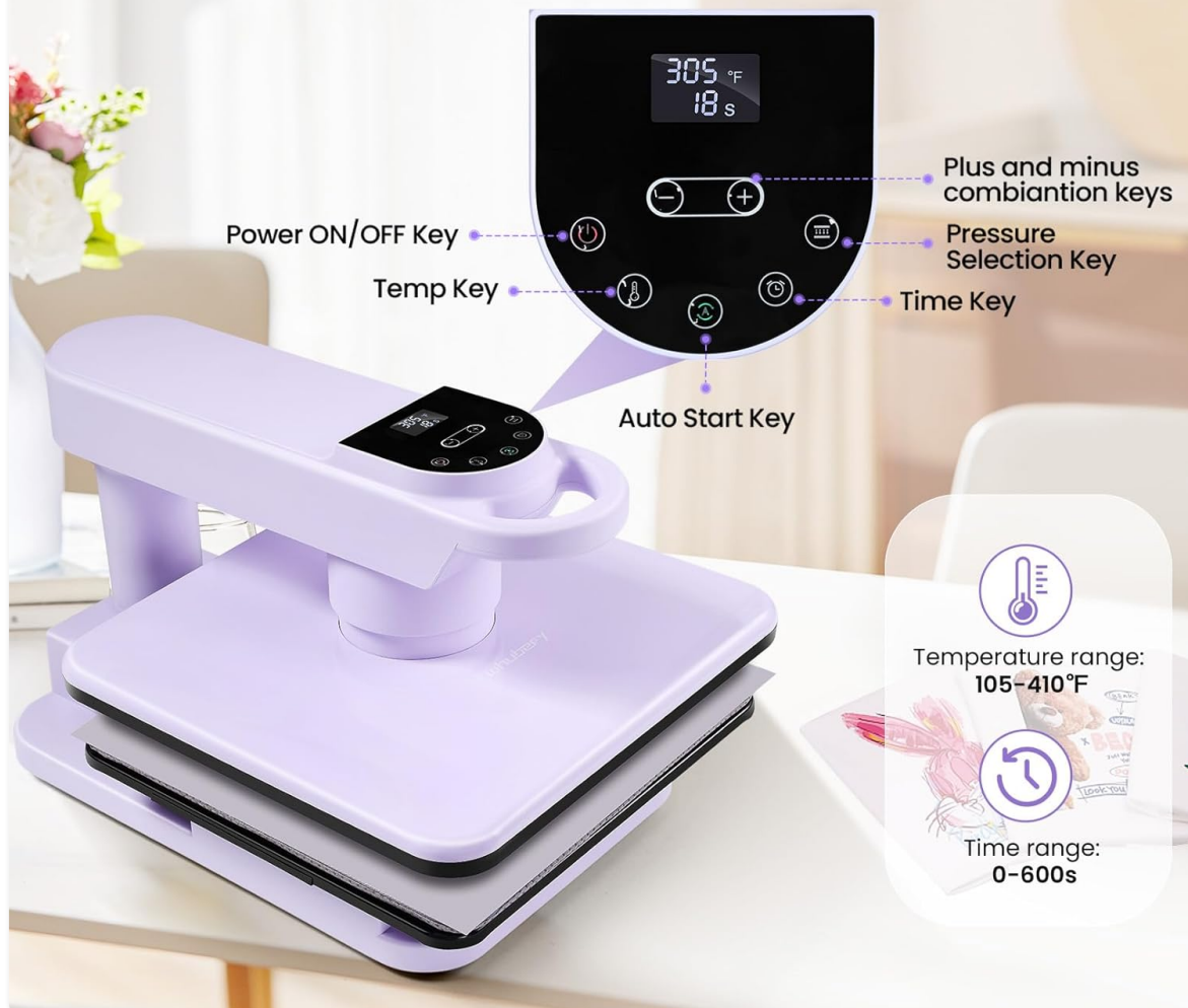
Image: The intuitive LCD display and control panel of the heat press, showing buttons for power, temperature, time, pressure selection, and auto start.

High accuracy temperature sensor, precise adjustable time and temp.