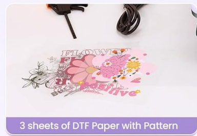
3 sheets of DTF Paper with Pattern