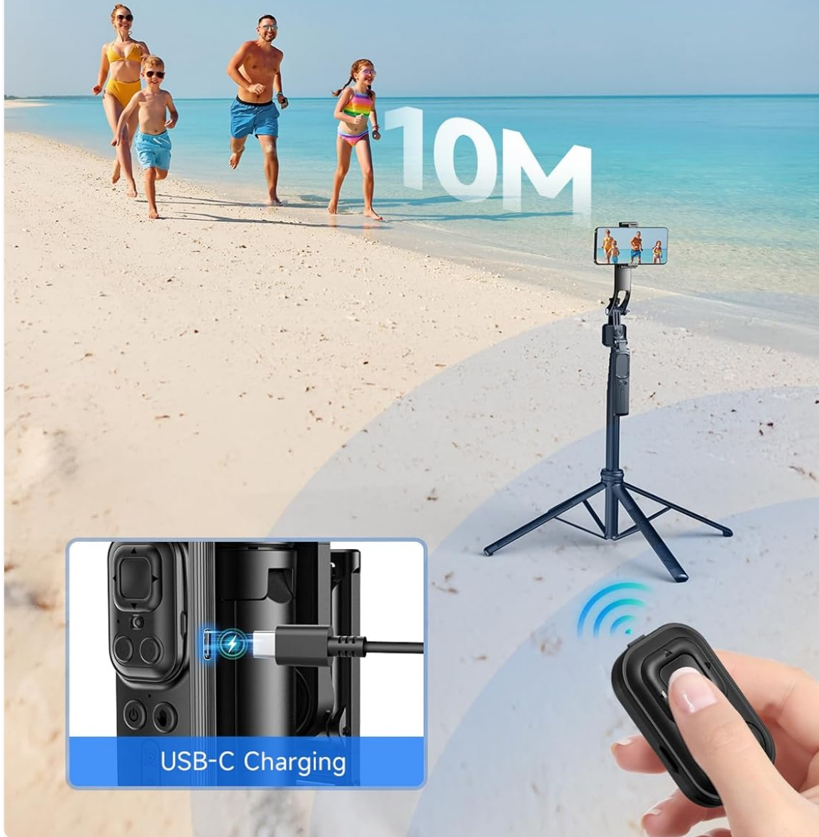
Image Description: The image shows the remote control being charged via a USB-C cable, with a visual indicator of its wireless range.