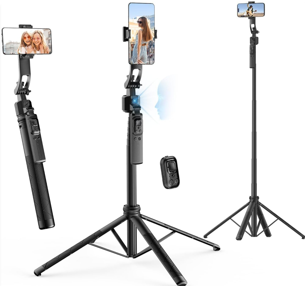
Image Description: The image displays the Rollei Easy Creator Quadpod in three configurations: folded as a