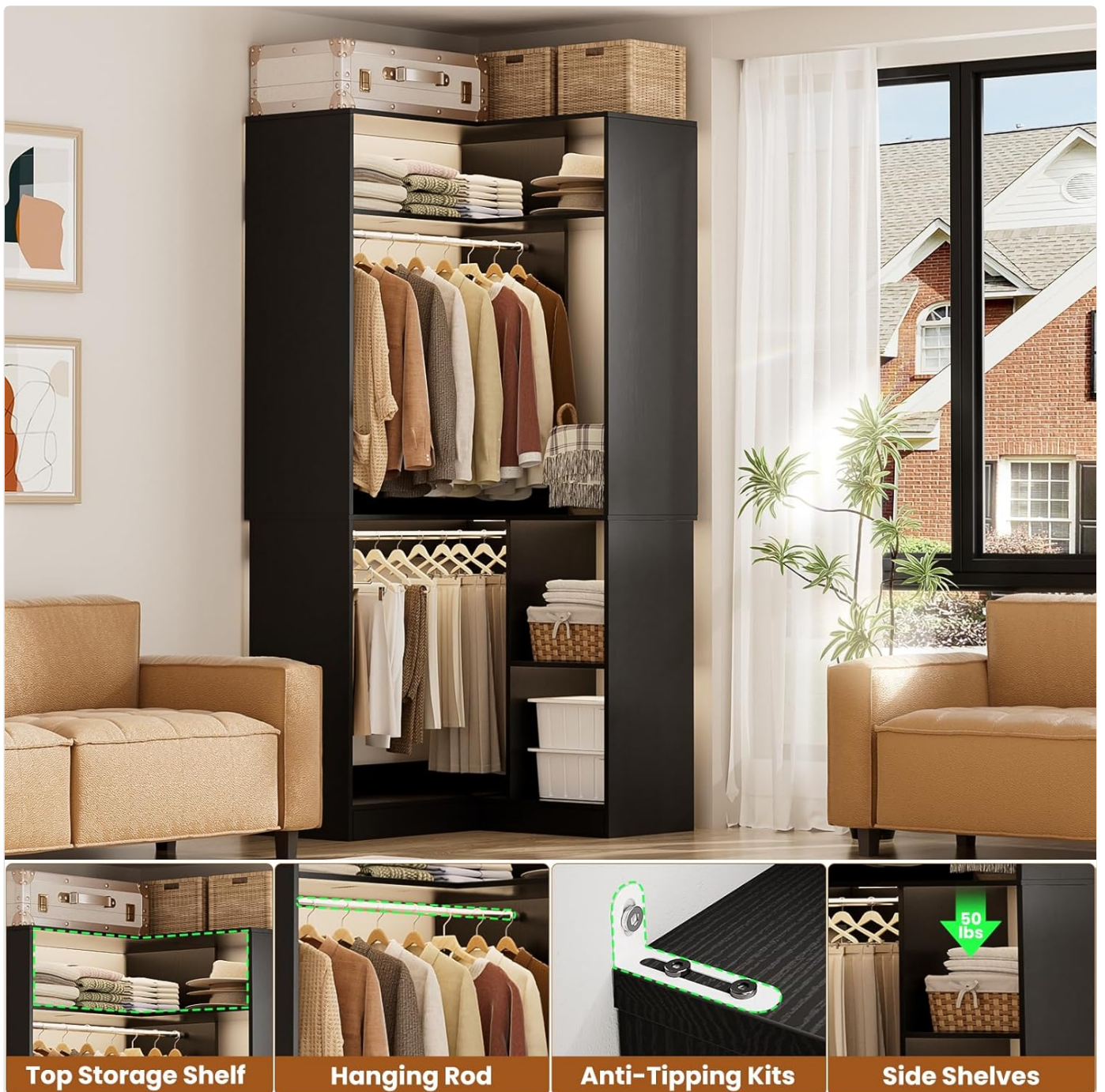
Image 1: Overview of the Aheaplus Corner Closet System highlighting key features like the top storage shelf, hanging rods, anti-tipping kits, and side shelves. This image demonstrates the structural components and safety features.