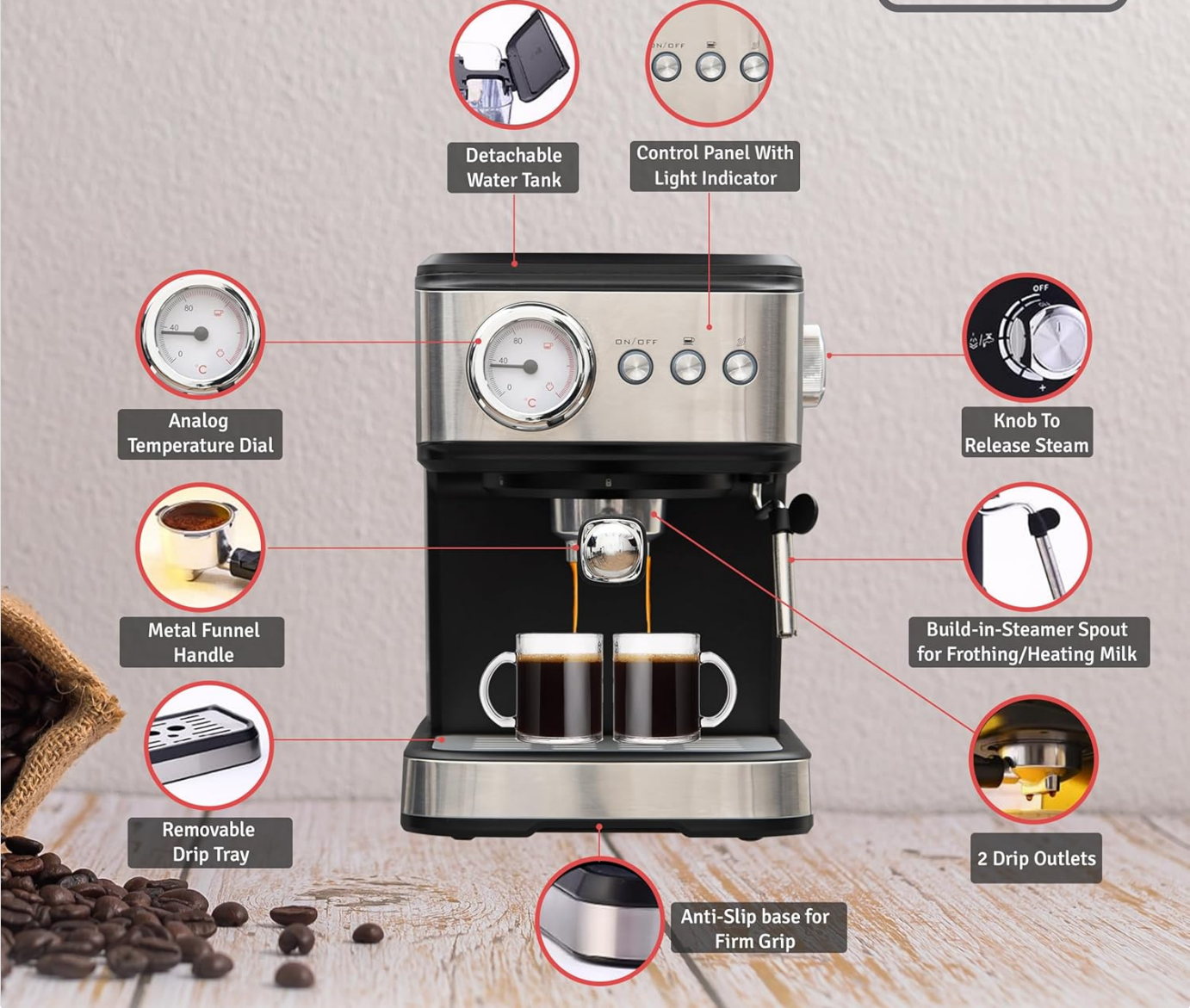
Image: Table summarizing key features of the BLACK+DECKER BXC1001IN Espresso Coffee Maker, including 15 Bar Pressure, Stainless Steel Body, Adjustable Foaming, Dual Thermostat, and 1.5L Water Tank.