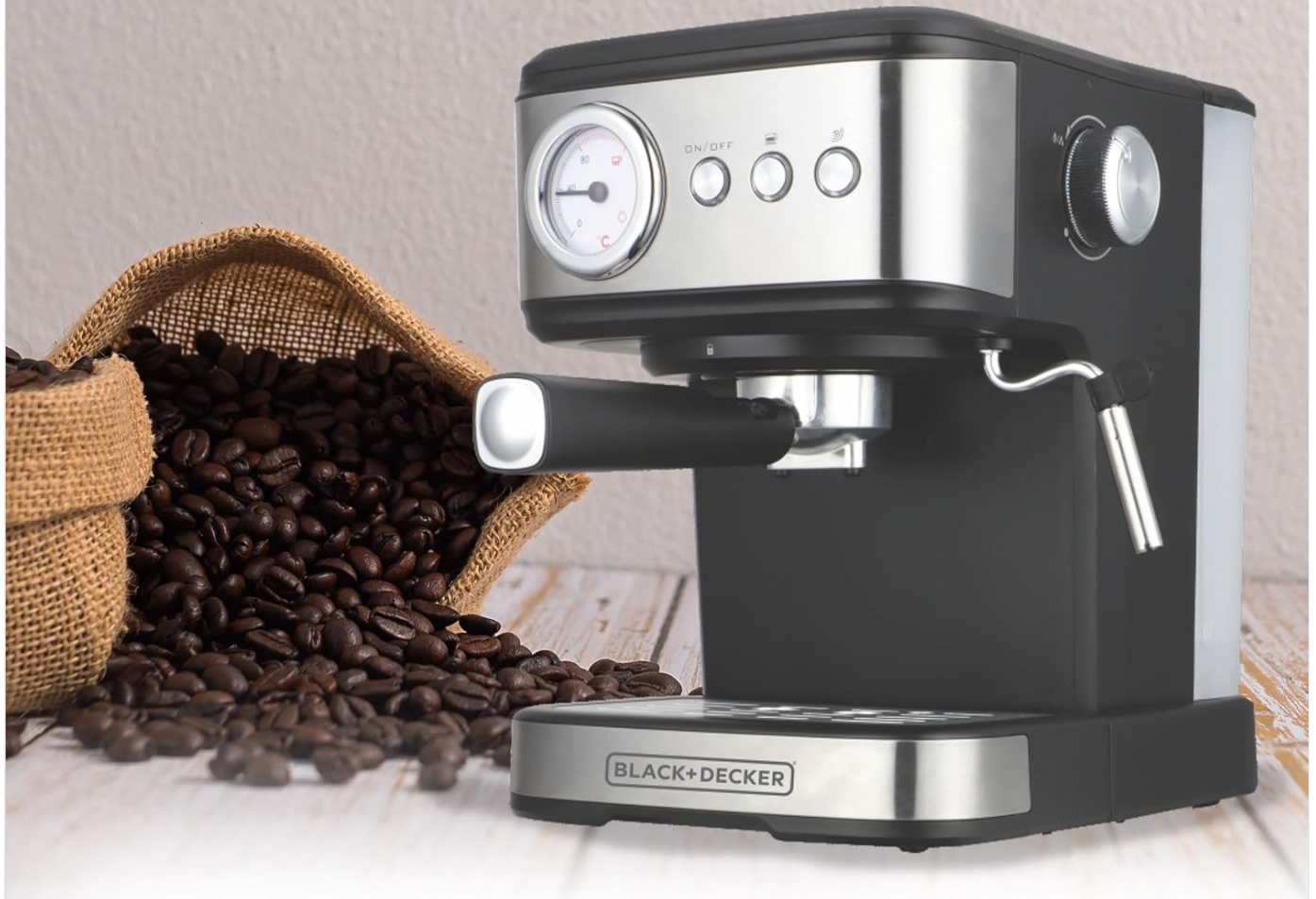
Image: Front view of the BLACK+DECKER BXCM1001IN Espresso Coffee Maker, showcasing its design and main controls.