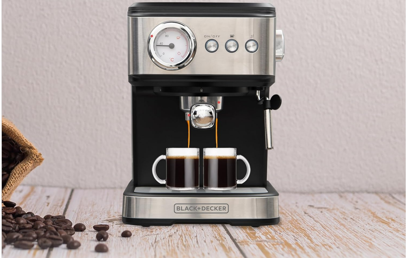
Image: Visual representation of the coffee maker's features, including 1100W power, 15 bar pressure, 1.5L detachable transparent water tank, and dual stainless steel filter.