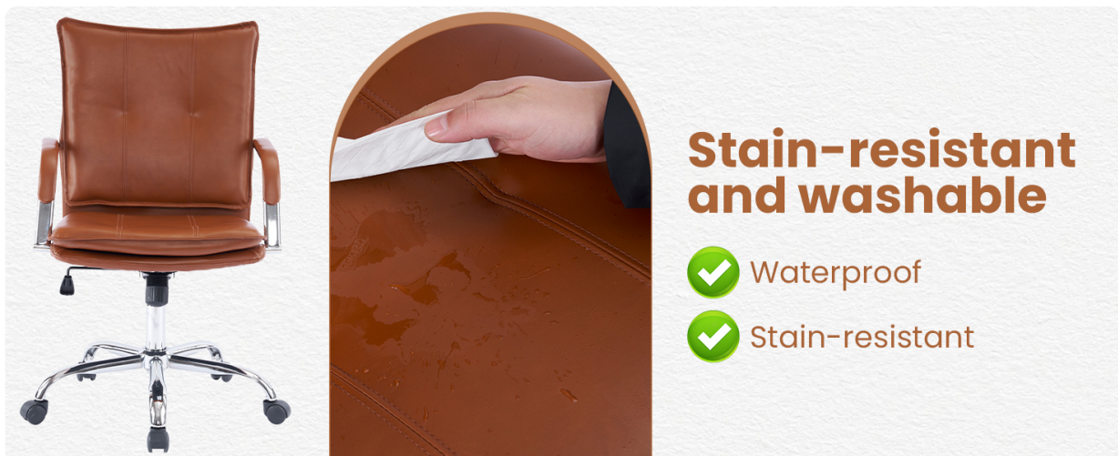
Figure 6: Water-resistant and stain-resistant faux leather.