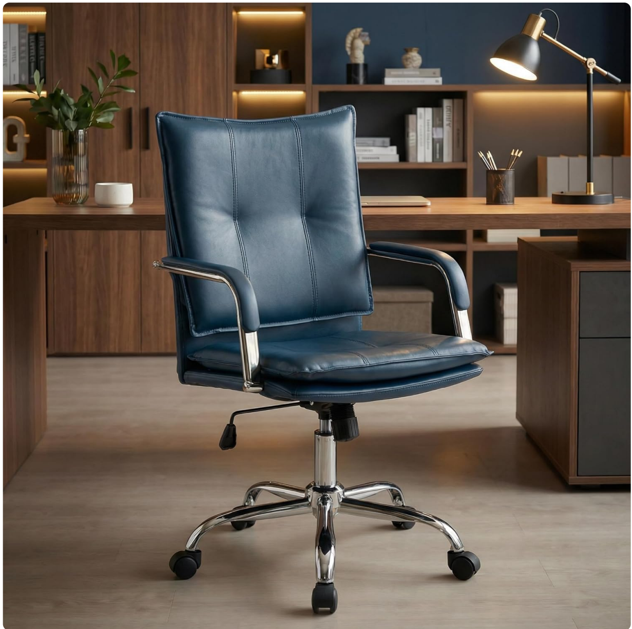
Figure 1: MOJAY Office Chair M6563 (Dark Blue with Silver Legs)