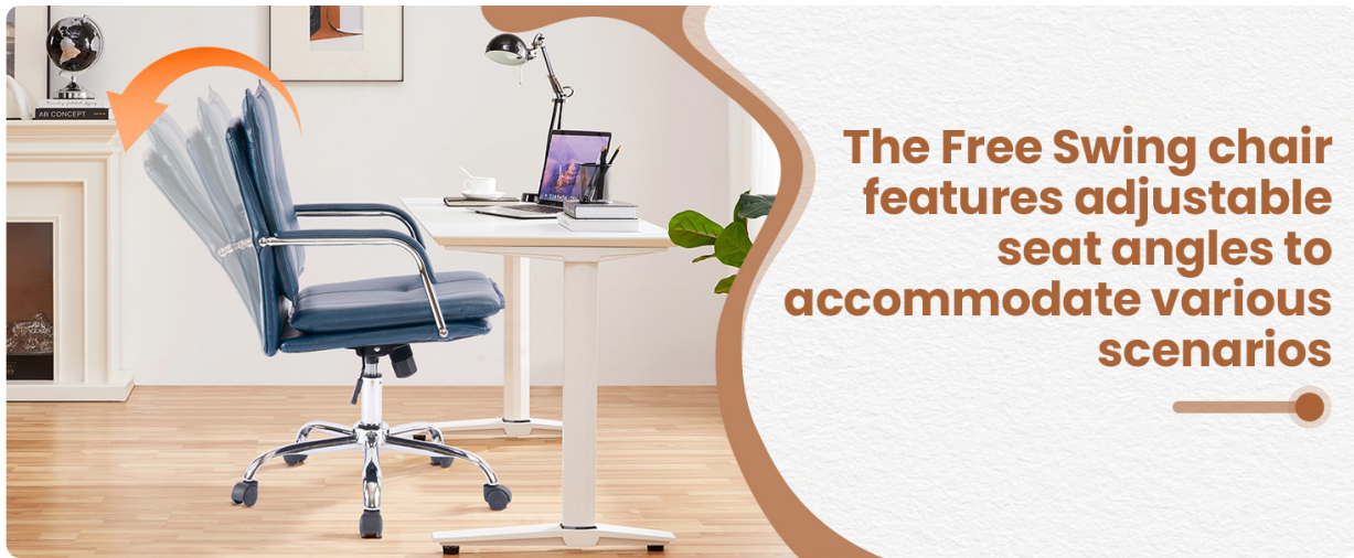
Figure 5: Rocking function knob for tilt adjustment.