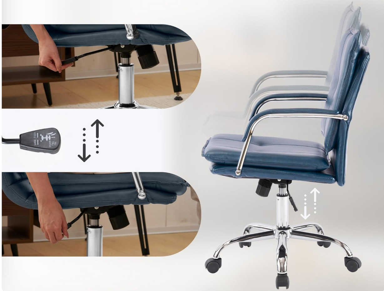
Figure 3: Height adjustment mechanism.