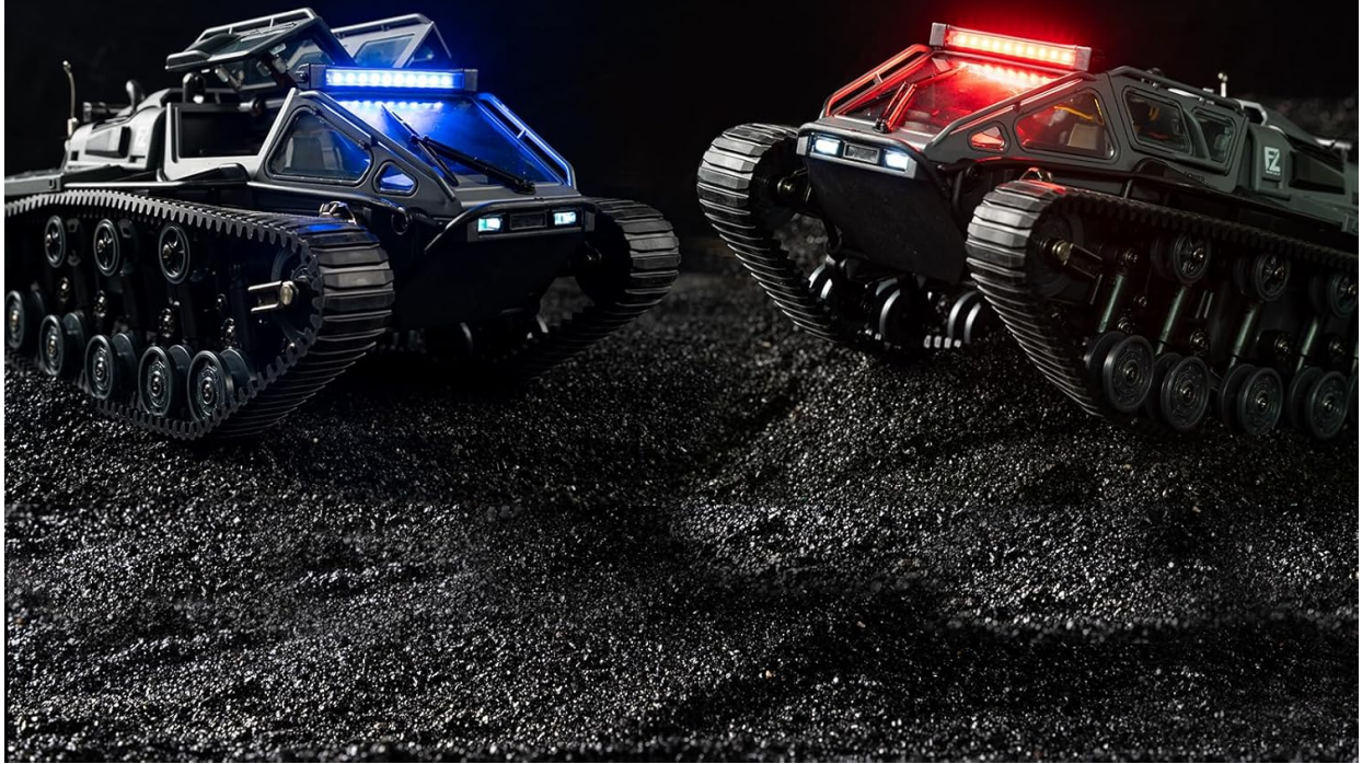
Figure 4: High-Brightness Front Lights. This image displays two RC tanks with their bright front lights illuminated, demonstrating the 13 switchable light modes for enhanced night driving and visual effect.

13 switchable light modes smooth night driving with style and flare