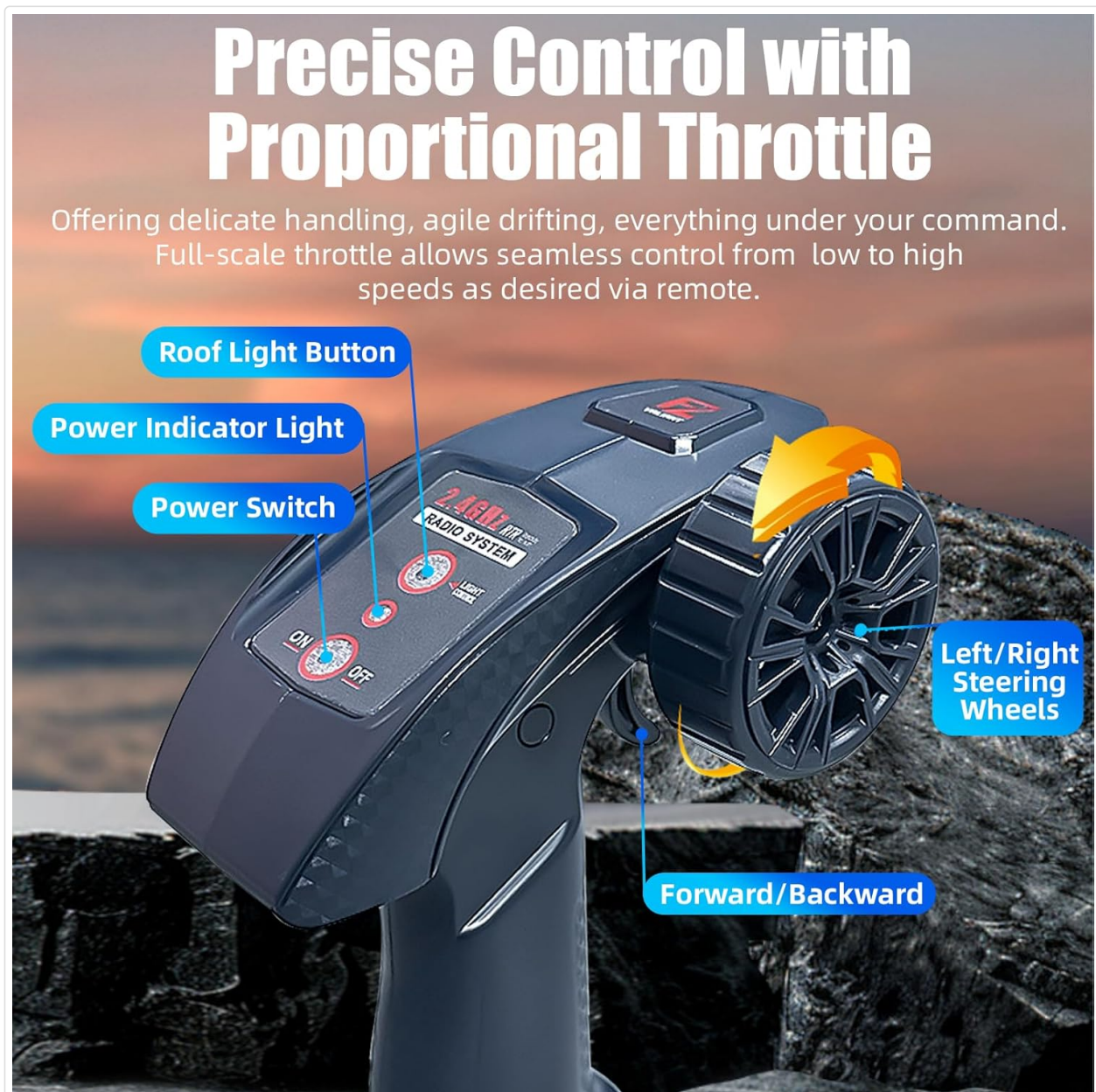
Figure 1: Remote Control Layout. This image illustrates the various controls on the remote, including the power switch, power indicator light, roof light button, and the left/right steering wheels for precise control.