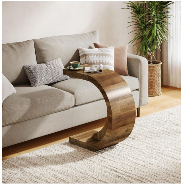
Image: Usage as a Couch Side Table. The C-shaped design allows the table to slide under furniture, providing a convenient surface.