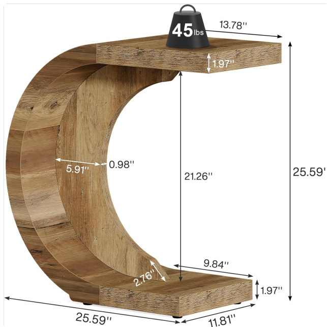
Image: Product Dimensions. A detailed diagram illustrating the key measurements of the C-shaped end table.