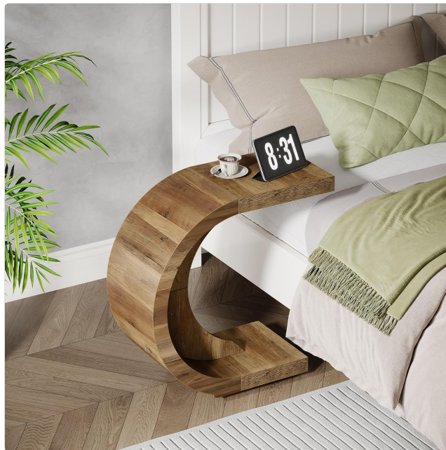
Image: Usage as a Nightstand. The compact design is suitable for use beside a bed, holding essentials like a tablet or coffee cup.