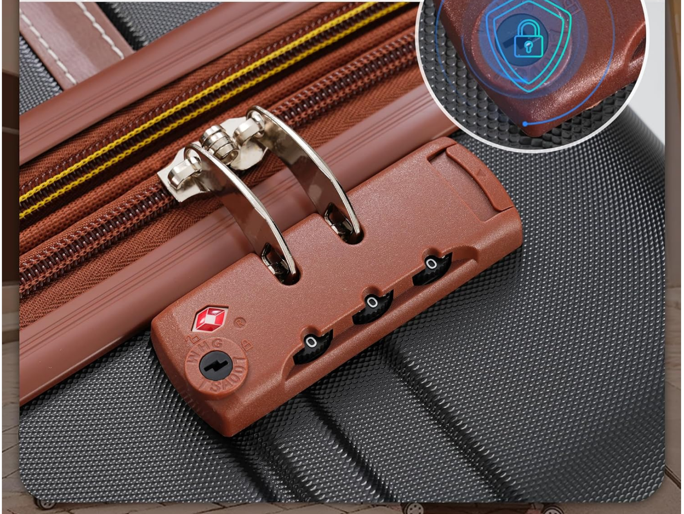
Image: A detailed view of the 3-digit secure TSA lock, highlighting its mechanism for setting a personal combination.

Ensure property safety & Passing the customs with no worries.