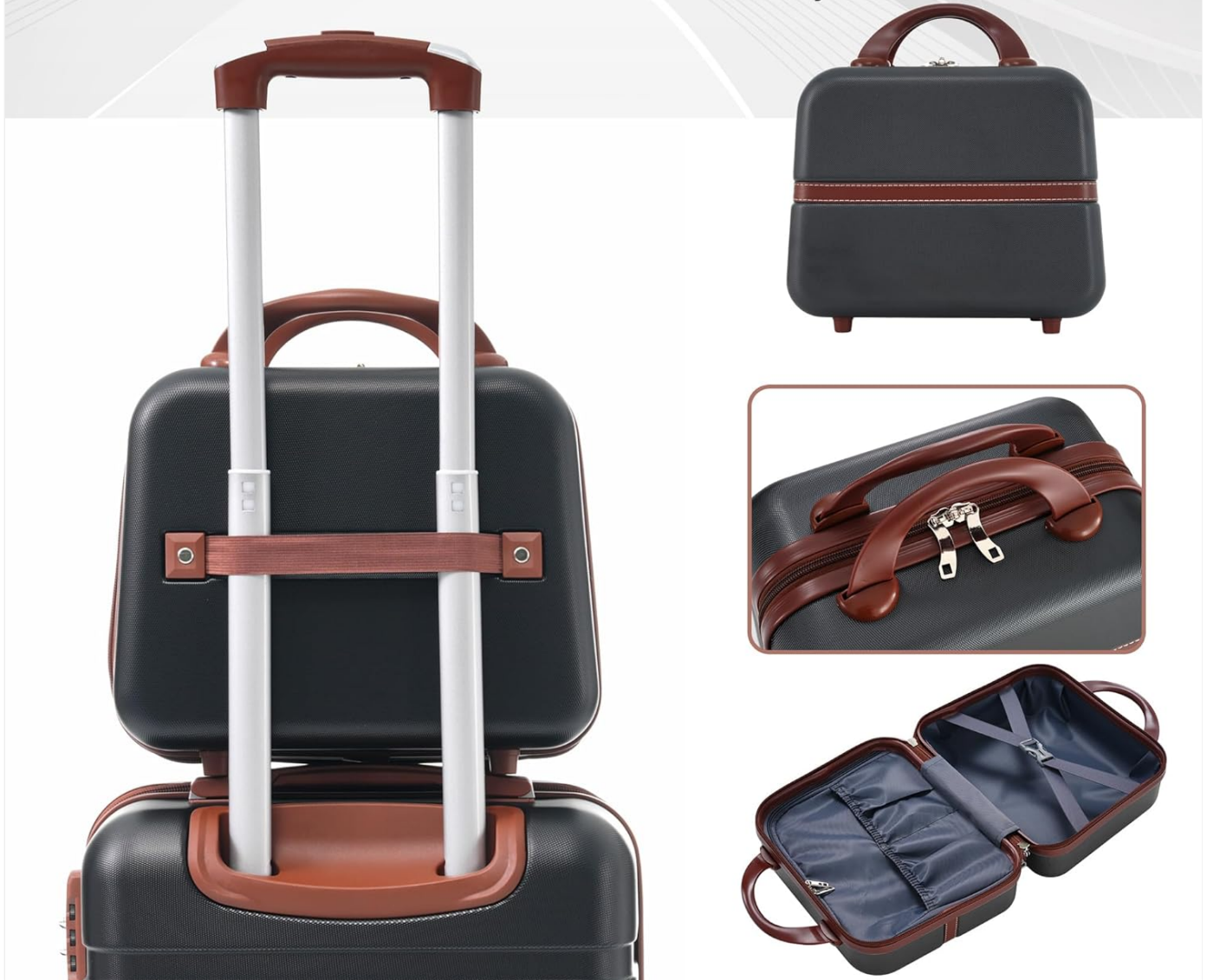
Image: Detailed views of the cosmetic case, illustrating its interior compartments and how it can be attached to the handle of a larger suitcase.

Suitable for carrying cosmetic bags, underwear and others, or short-term travel (within 2 days).