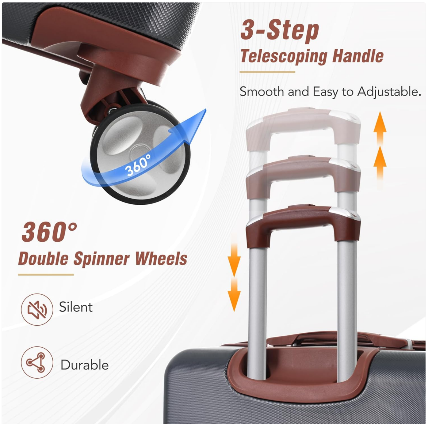
Image: Visual representation of the 3-step telescoping handle's adjustability and the 360-degree double spinner wheels.