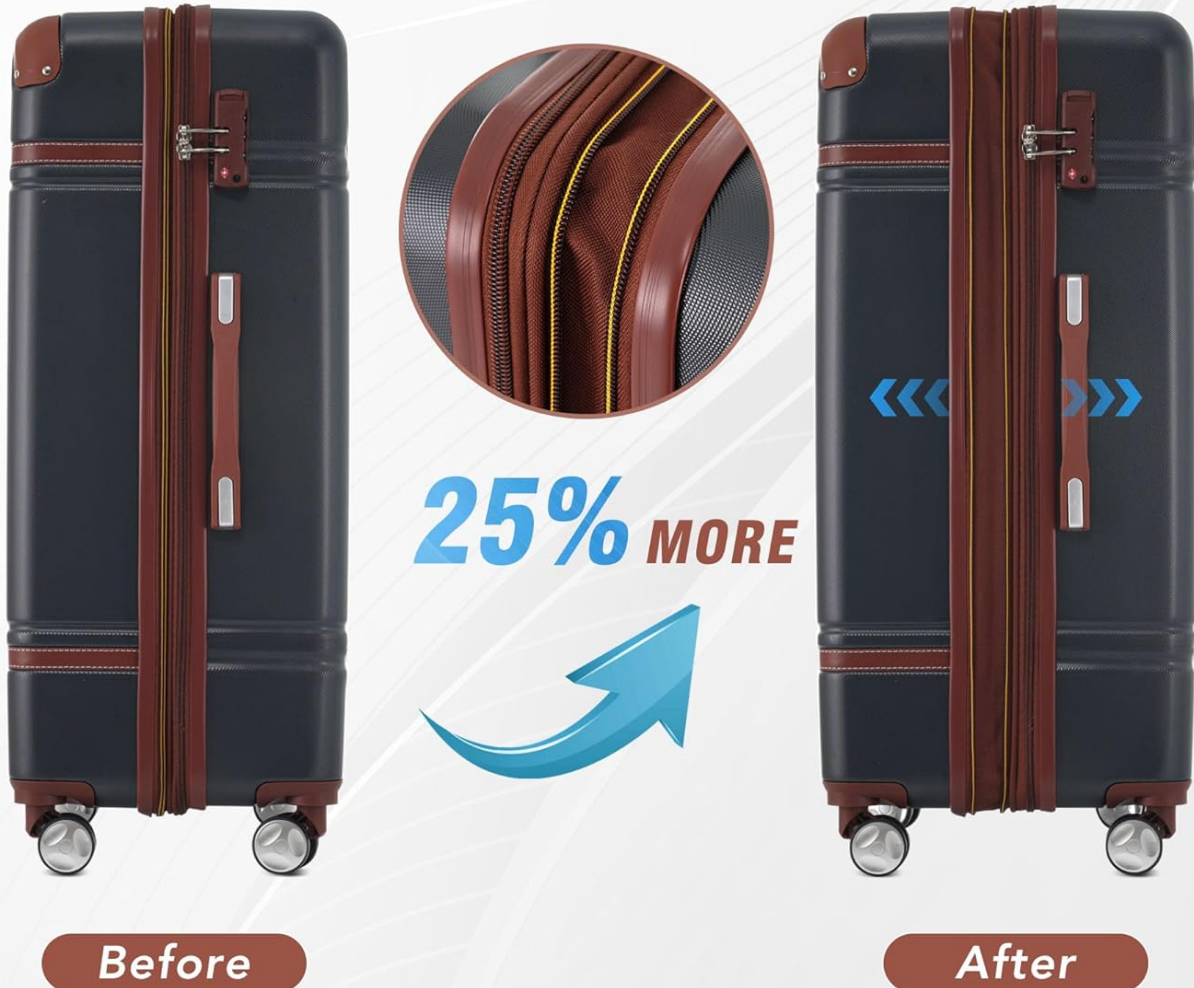
Image: A visual guide demonstrating the extra size expansion feature available on the 24" and 28" suitcases, providing 25% more packing space.