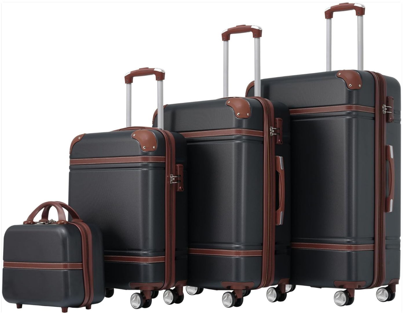
Image: The complete Merax 4-piece hardshell luggage set, showcasing the various sizes and the black and brown design.