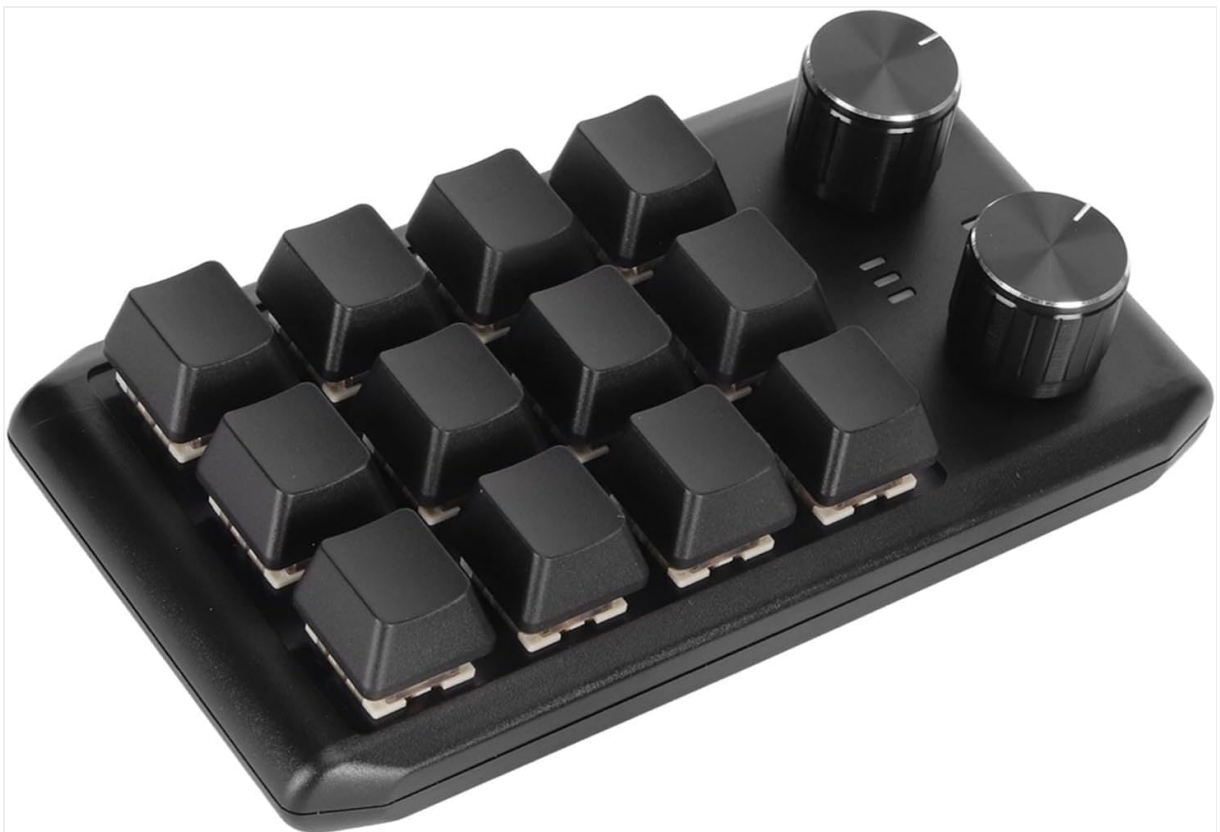
Figure 2: Angled view of the keypad, illustrating the side controls and connectivity port.