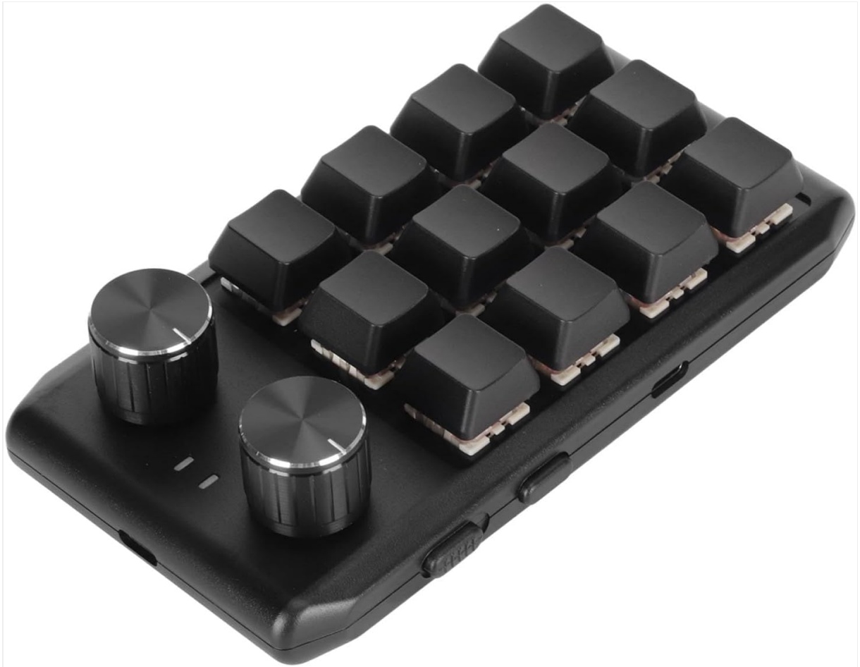
Figure 1: Top-down view of the keypad, highlighting the 12 programmable keys and two rotary encoders.