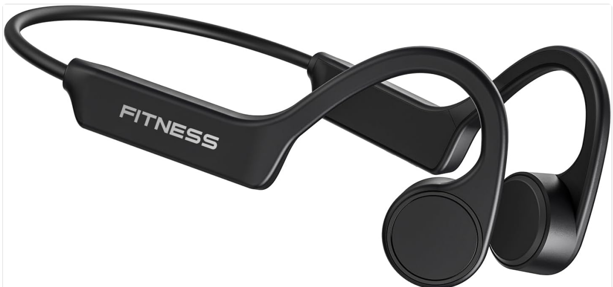
Image: PSIER Bone Conduction Headphones X11 and its contents.