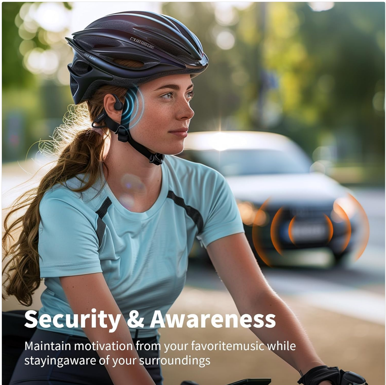
Image: Maintain motivation from your favorite music while staying aware of your surroundings.