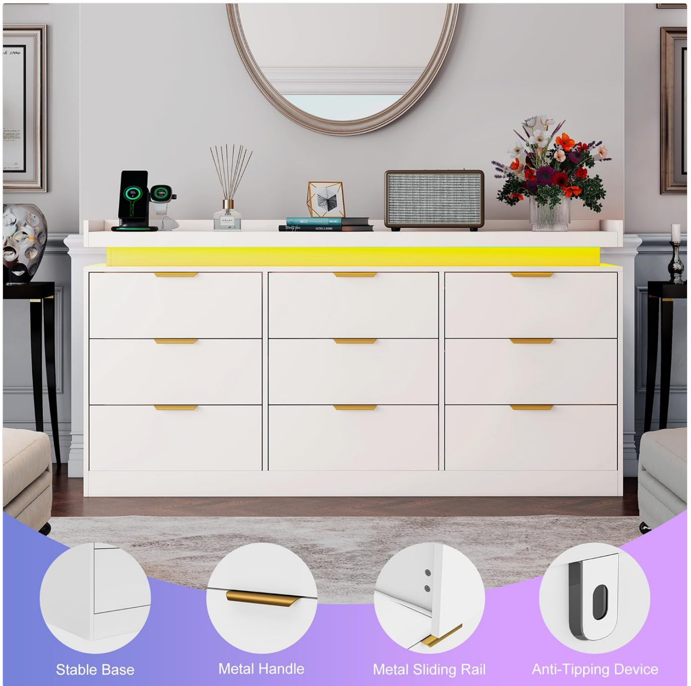
Image: Close-up view highlighting the stable base, durable metal handles, smooth metal sliding rails, and the essential anti-tipping device for secure installation.