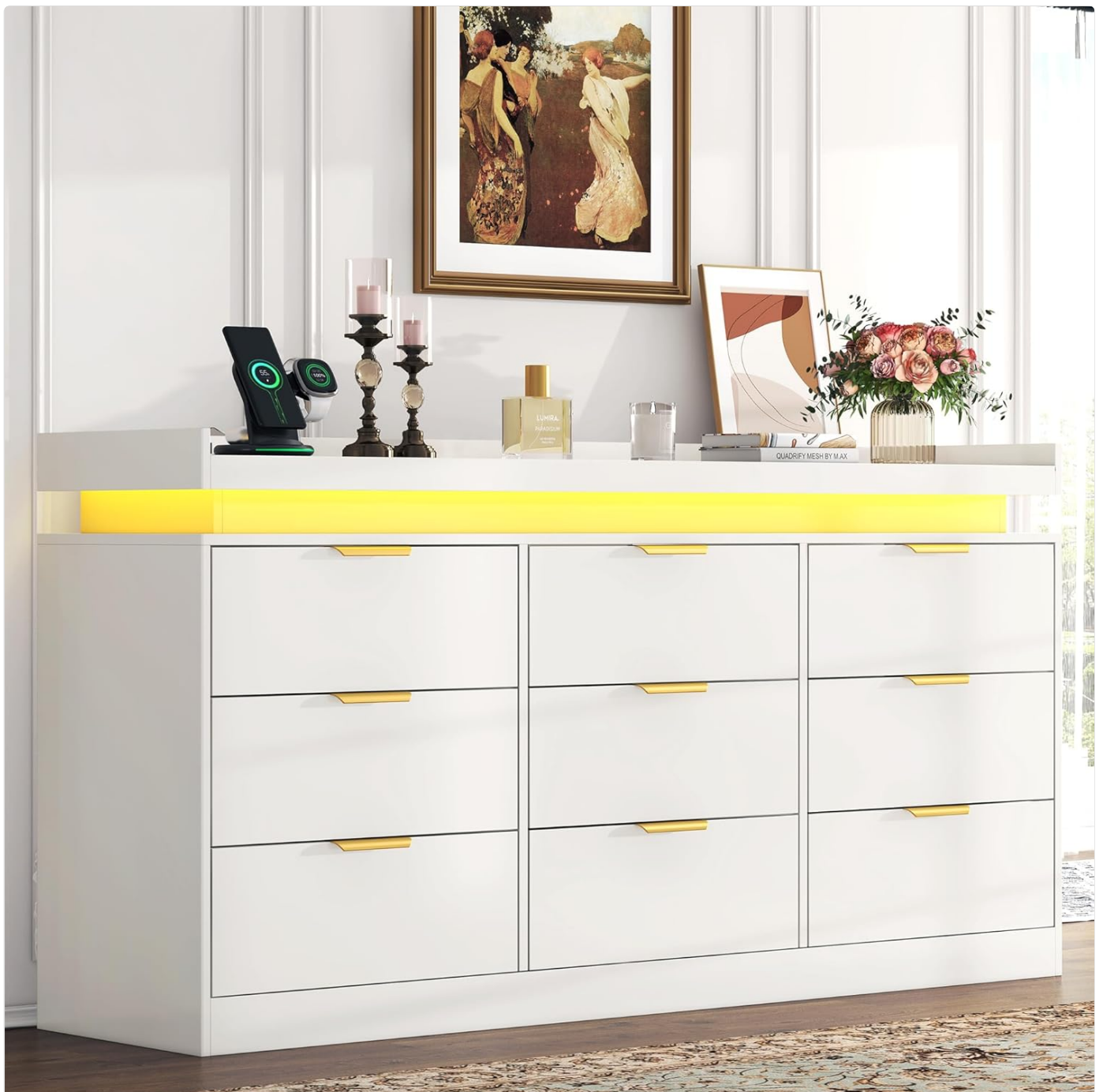
Image: The UNIQUTE 9-Drawer Dresser, showcasing its sleek white finish, gold handles, and illuminated top shelf.