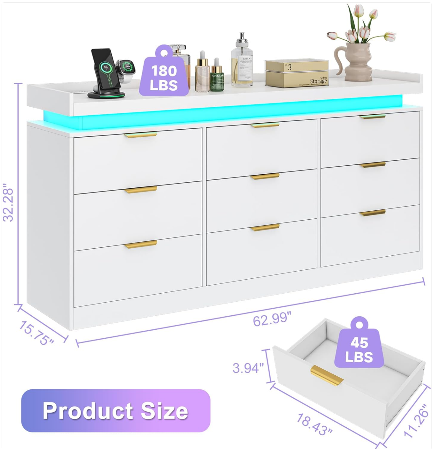
Image: Detailed product dimensions, showing depth, width, and height of the dresser, along with individual drawer dimensions and weight capacity.