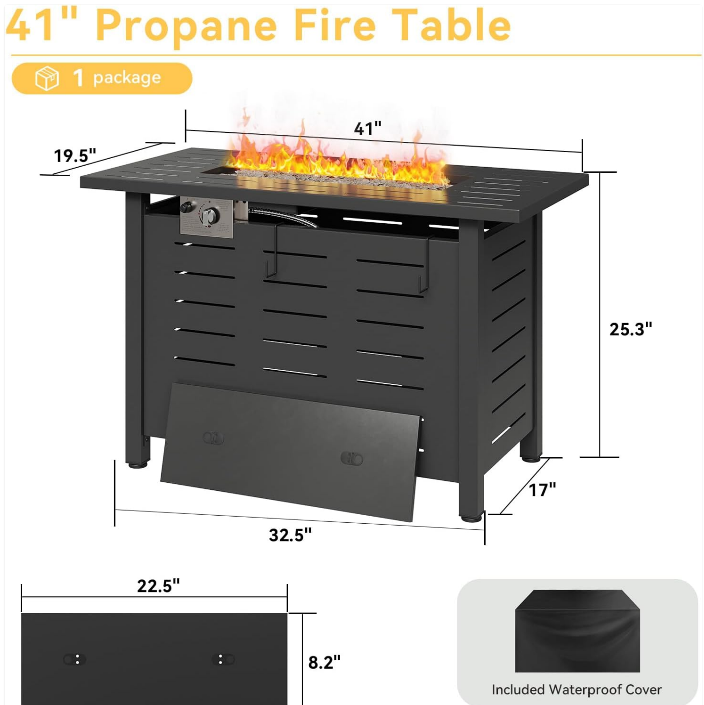
Image 3.1: Overview of the 41-inch propane fire table and its components.