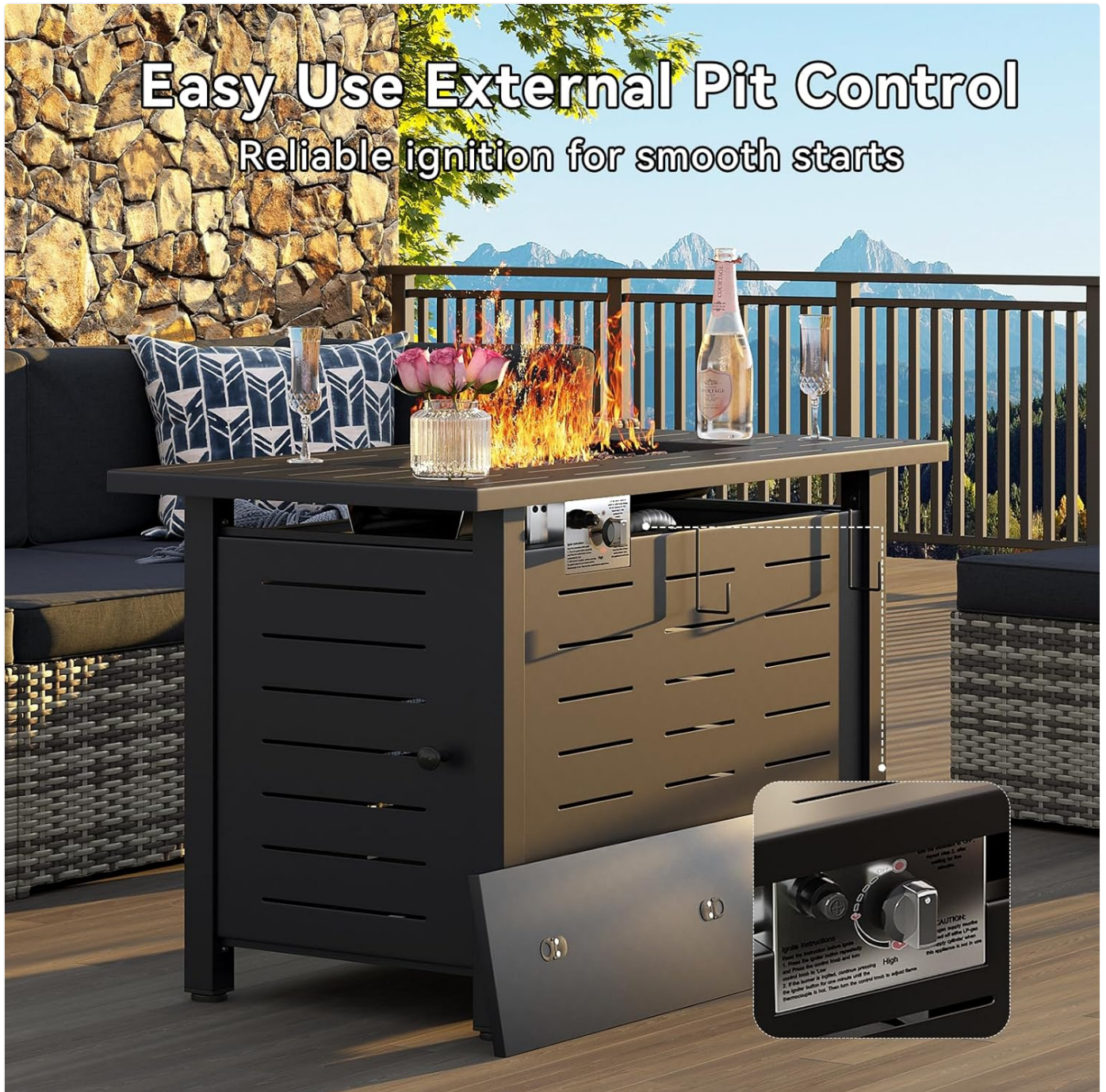
Image 6.1: External control panel for ignition and flame adjustment.

Your browser does not support the video tag.