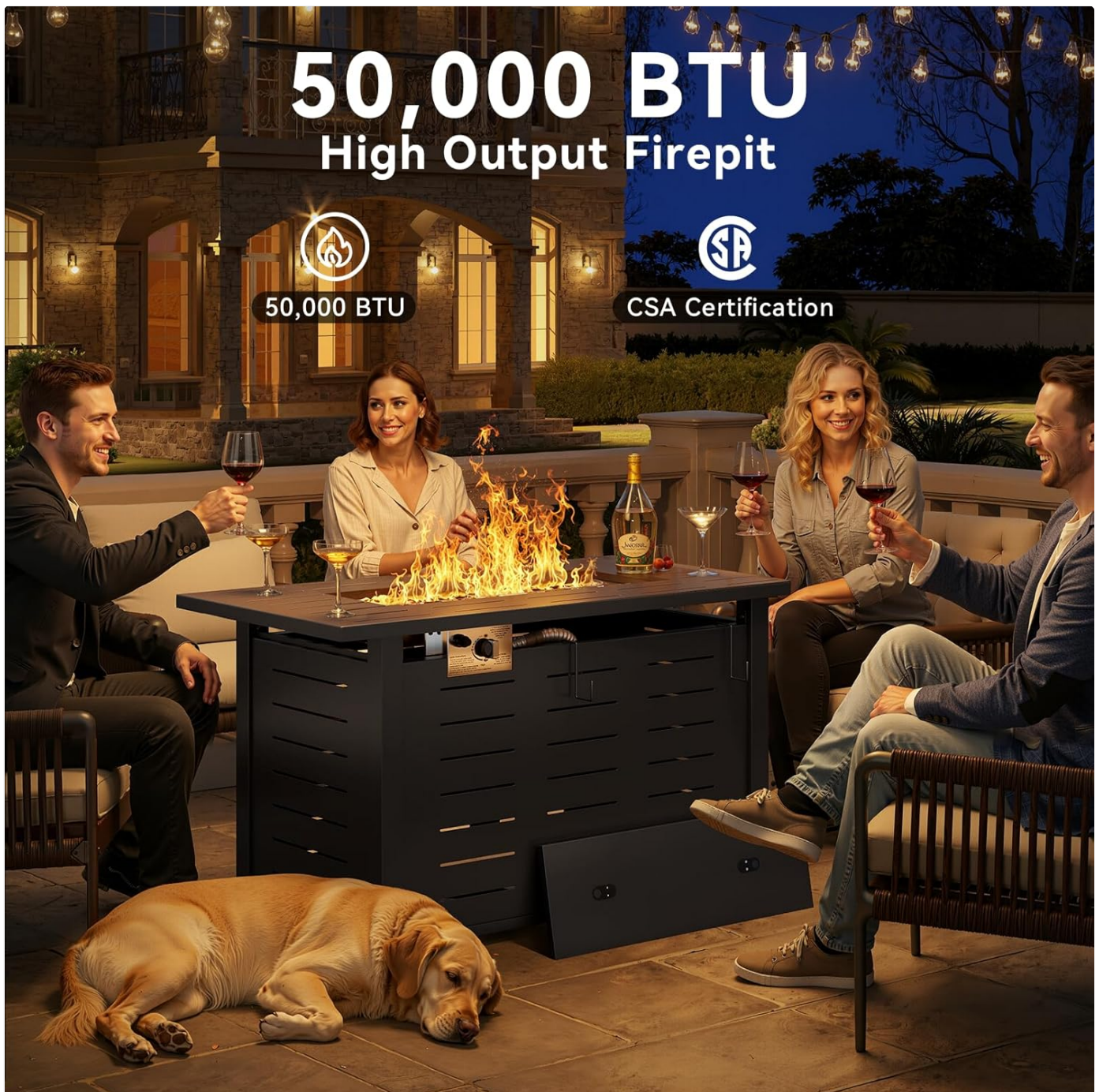
Image 1.1: The Aoxun 41 Inch Propane Fire Pit Table providing warmth and ambiance.