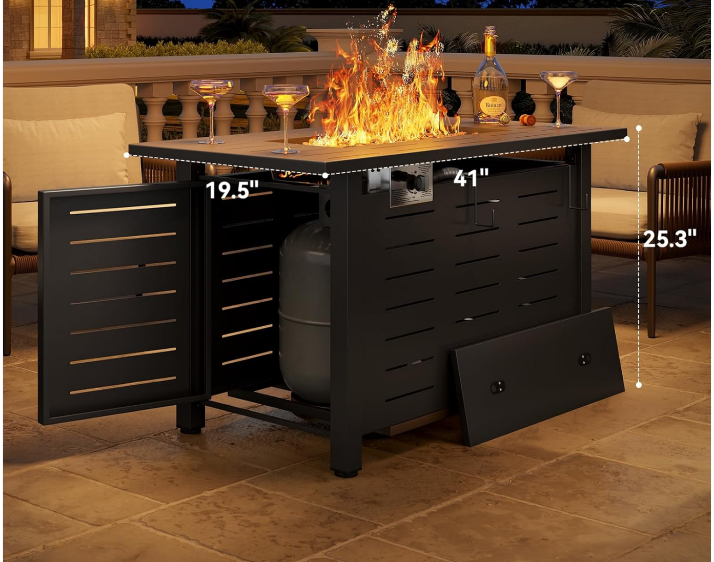
Image 5.1: Proper placement of the propane tank within the fire pit table.