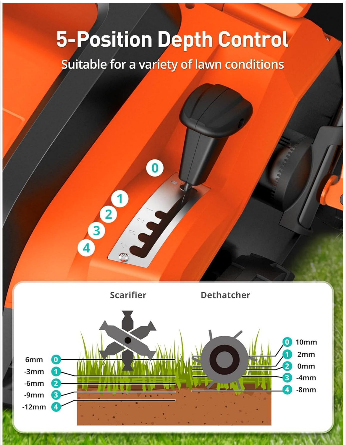
Image: Diagram illustrating the 5-position depth control lever and its corresponding dethatching and scarifying depths.

Suitable for a variety of lawn conditions