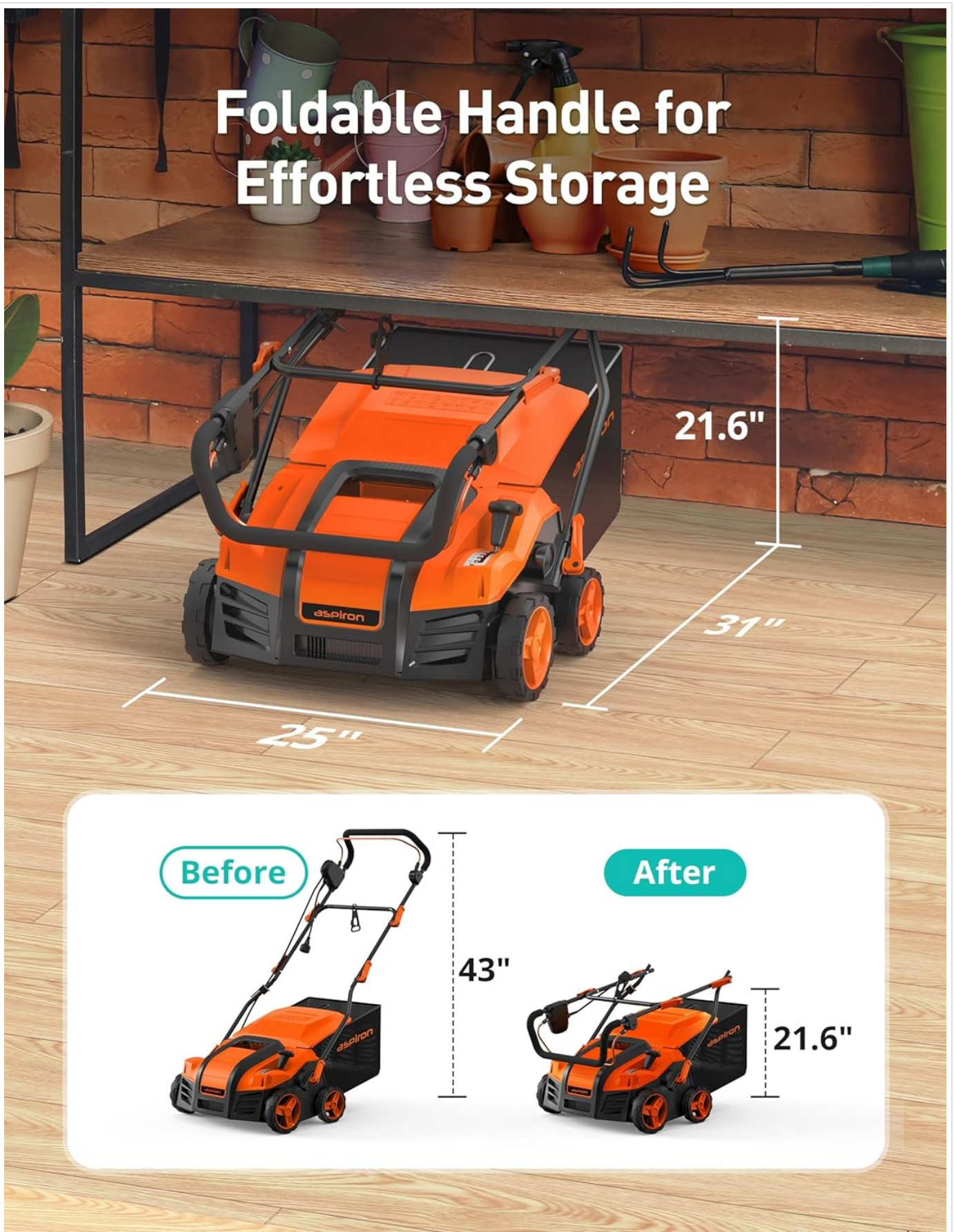
Image: The dethatcher scarifier with its handle folded, demonstrating its compact storage capability.