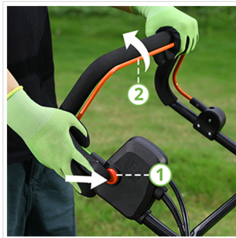
Image: Close-up showing the two-step process for engaging the double safety switch and bail switch to start the unit.