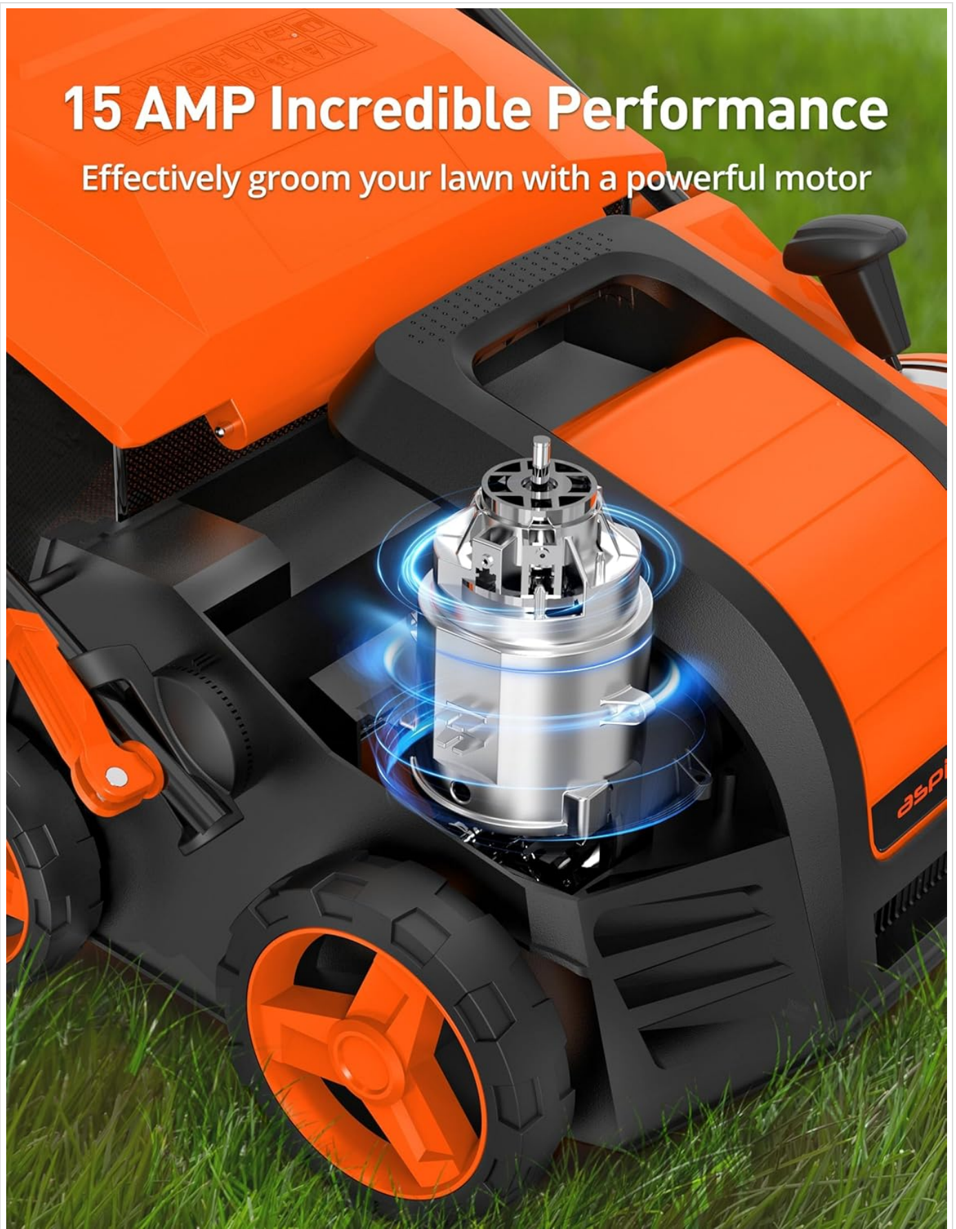
Image: The Aspron 16-Inch 15 Amp Electric Dethatcher Scarifier, showcasing its orange and black design with a wide raking path.

Effectively groom your lawn with a powerful motor