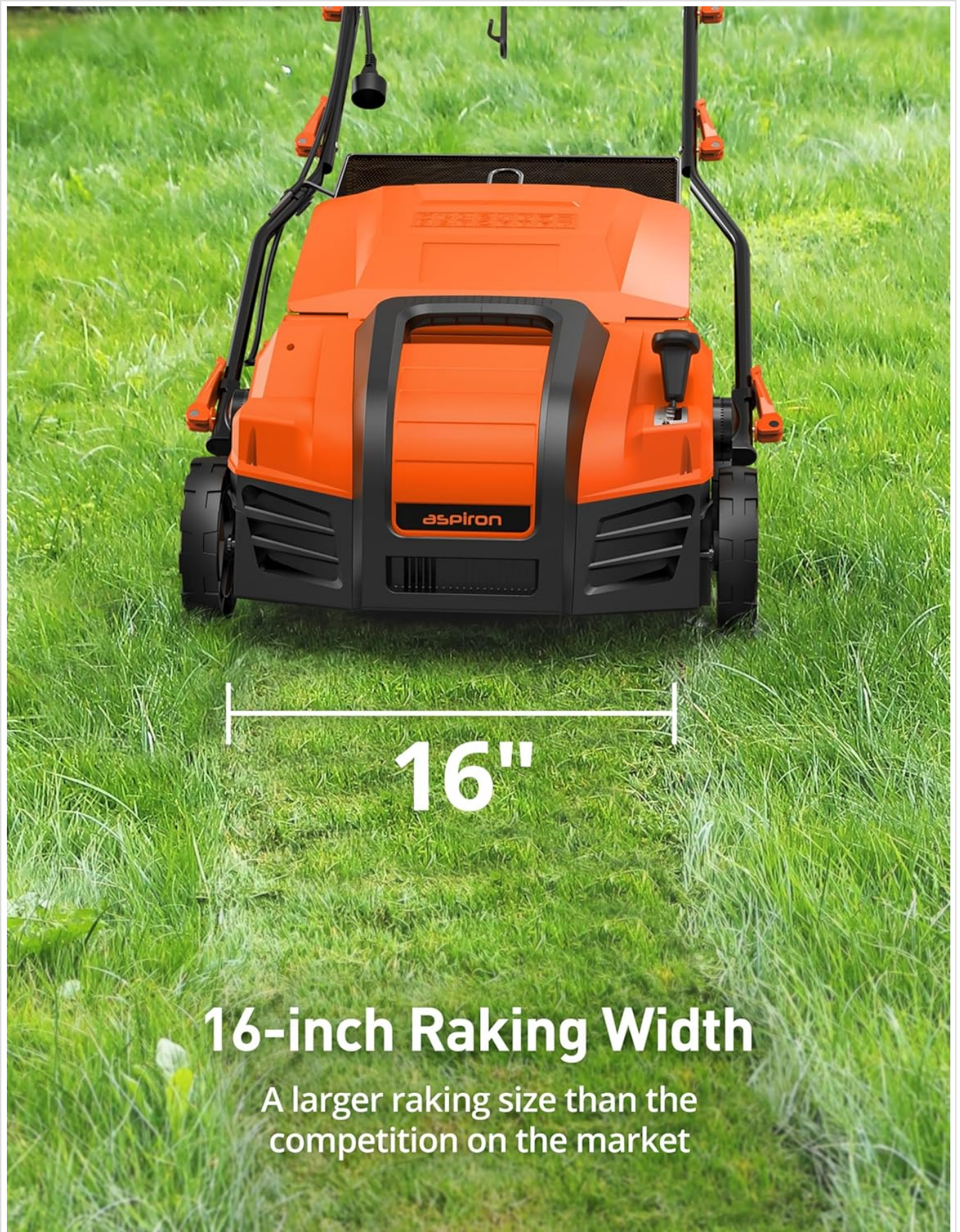
Image: The dethatcher scarifier operating on a lawn, highlighting its 16-inch raking width.