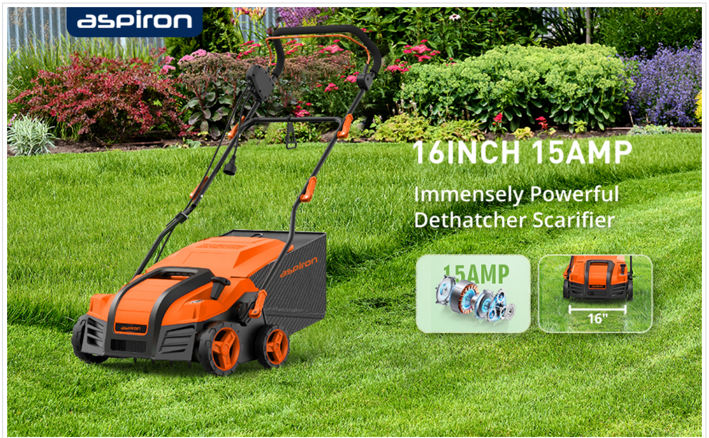
Image: Internal view highlighting the 15 Amp motor of the Aspiron dethatcher scarifier.