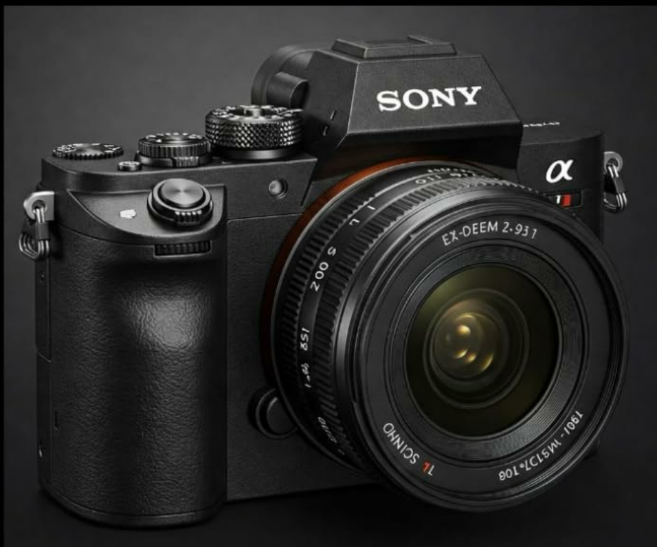
Image: Front cover of the Sony ZV-1F User Guide. This image illustrates the manual itself, which details the camera's features and operation.