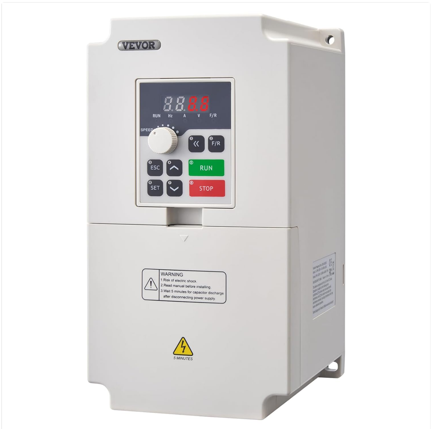
Front view of the VEVOR Frequency Inverter, showcasing its compact design and control panel.