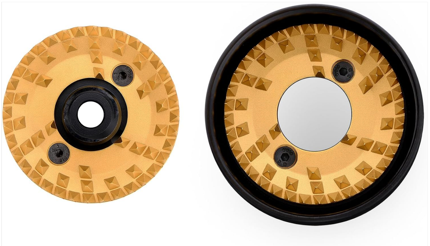
Image: Close-up of the 48.6mm Titanium Ghost Burr, showing its unique design for uniform grinding.