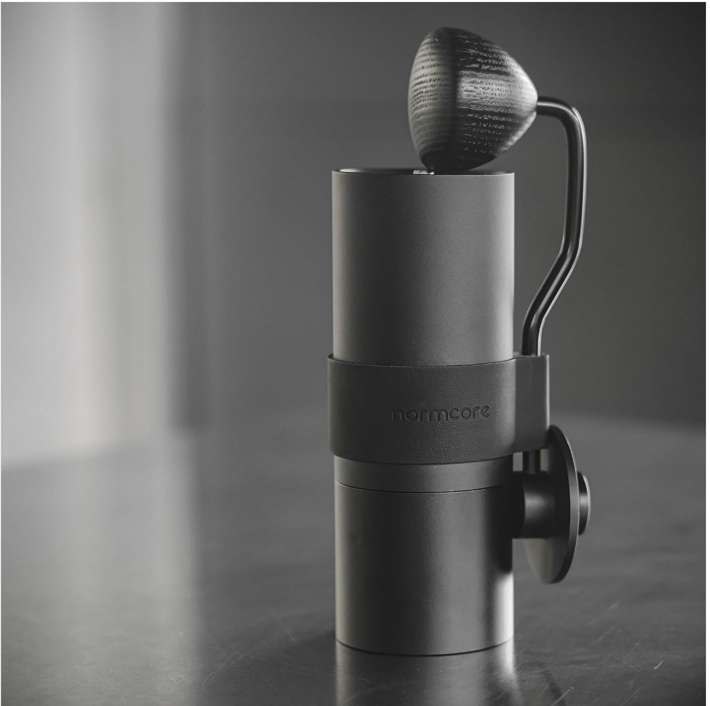
Image: Fully assembled Normcore Manual Coffee Grinder V2, showcasing its sleek black design and handle.