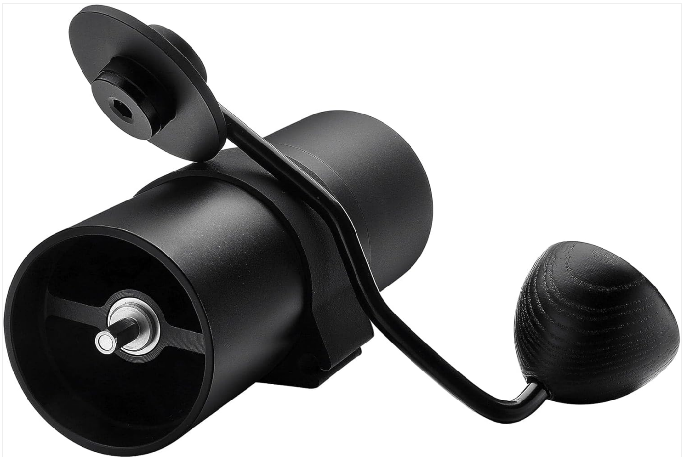
Image: Top-down view of the Normcore Manual Coffee Grinder V2, highlighting the handle and grinding mechanism.