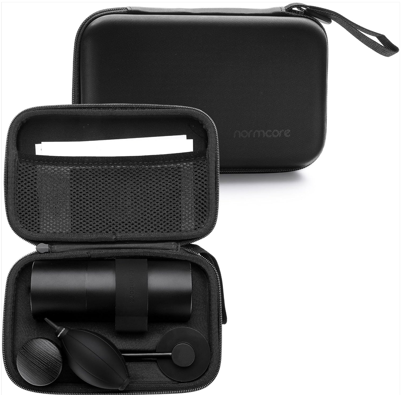
Image: The Normcore Manual Coffee Grinder V2 and its accessories, including the EVA carrying case and cleaning brush.