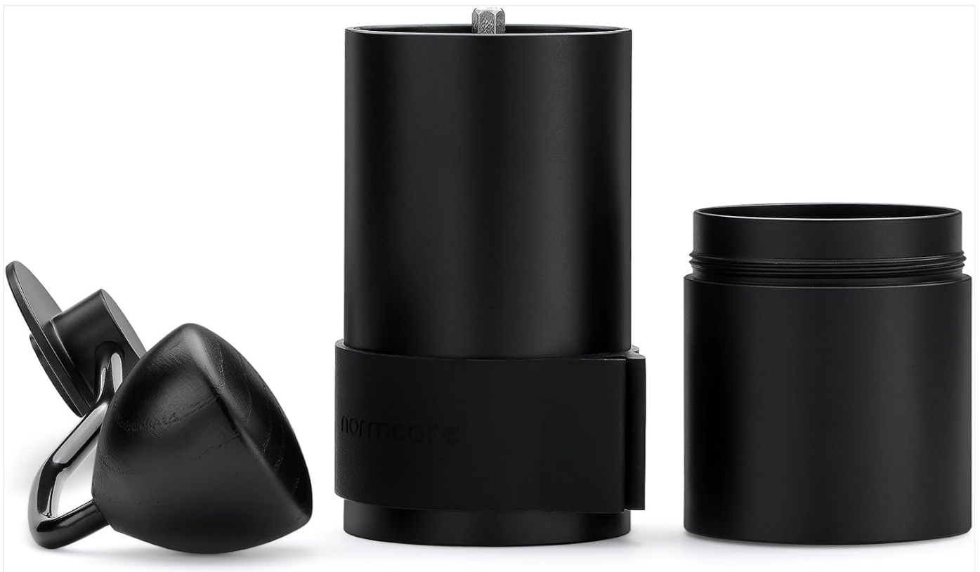
Image: Disassembled components of the Normcore Manual Coffee Grinder V2, showing the main body, handle, and collection cup.