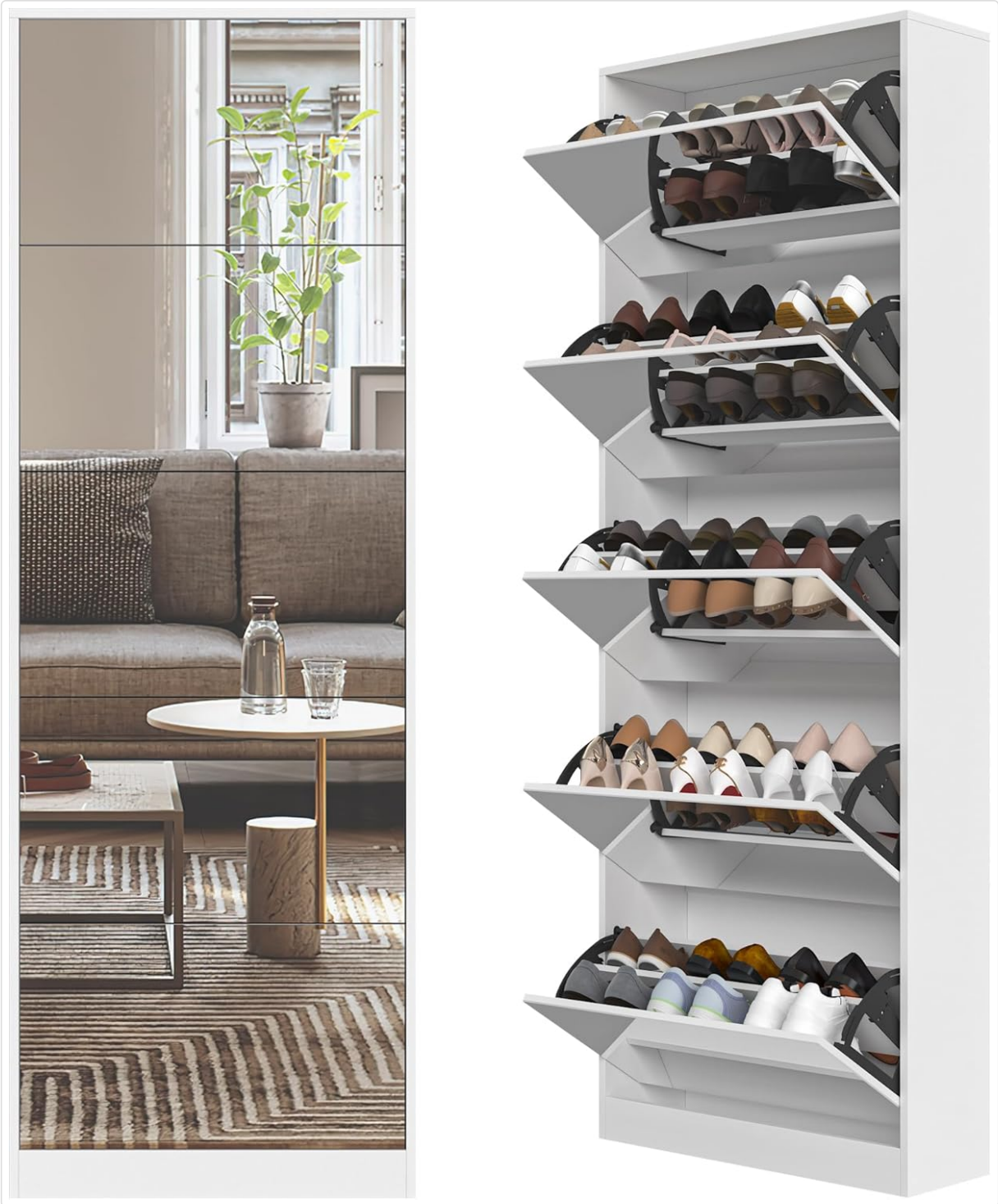
Figure 2.1: Organizedlife Shoe Storage Cabinet with full-length mirror, closed view.