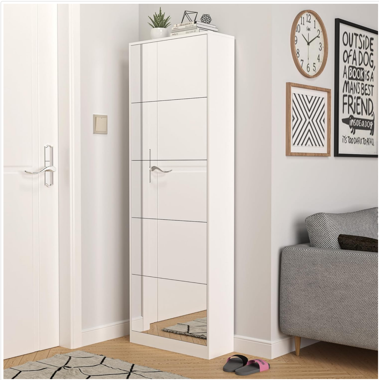
Figure 2.2: Organizedlife Shoe Storage Cabinet positioned in an entryway, demonstrating its compact design.