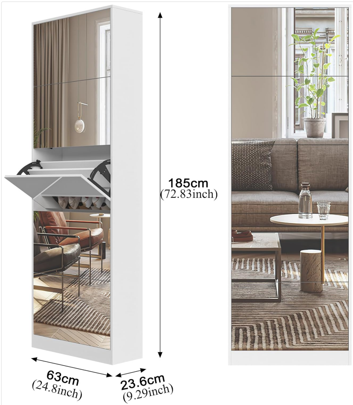
Figure 8.1: Overall product dimensions.