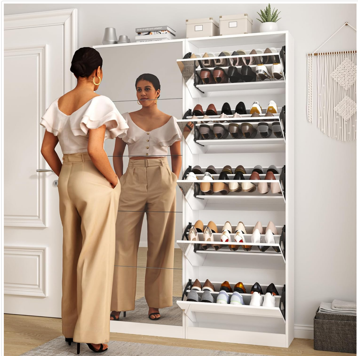
Figure 5.1: Shoe cabinet with drawers open, showing shoe storage capacity.

The cabinet features five flip-down drawers designed for shoe storage. Each drawer can accommodate multiple pairs of shoes, depending on their size and style.