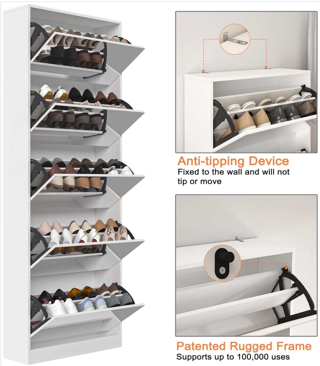
Figure 4.1: Detail of the anti-tipping device and drawer mechanism.