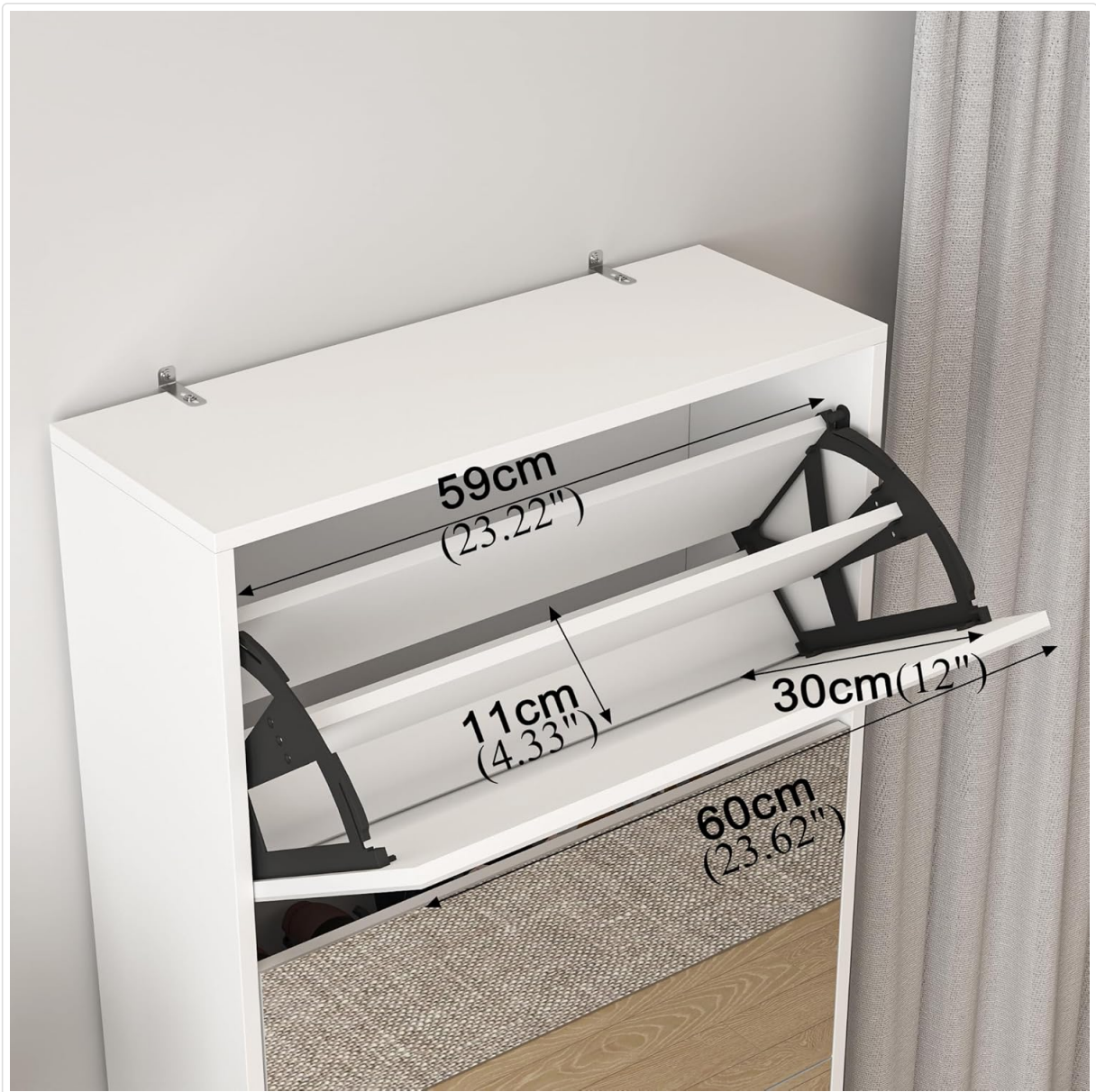
Figure 5.2: Internal dimensions of a single flip drawer.