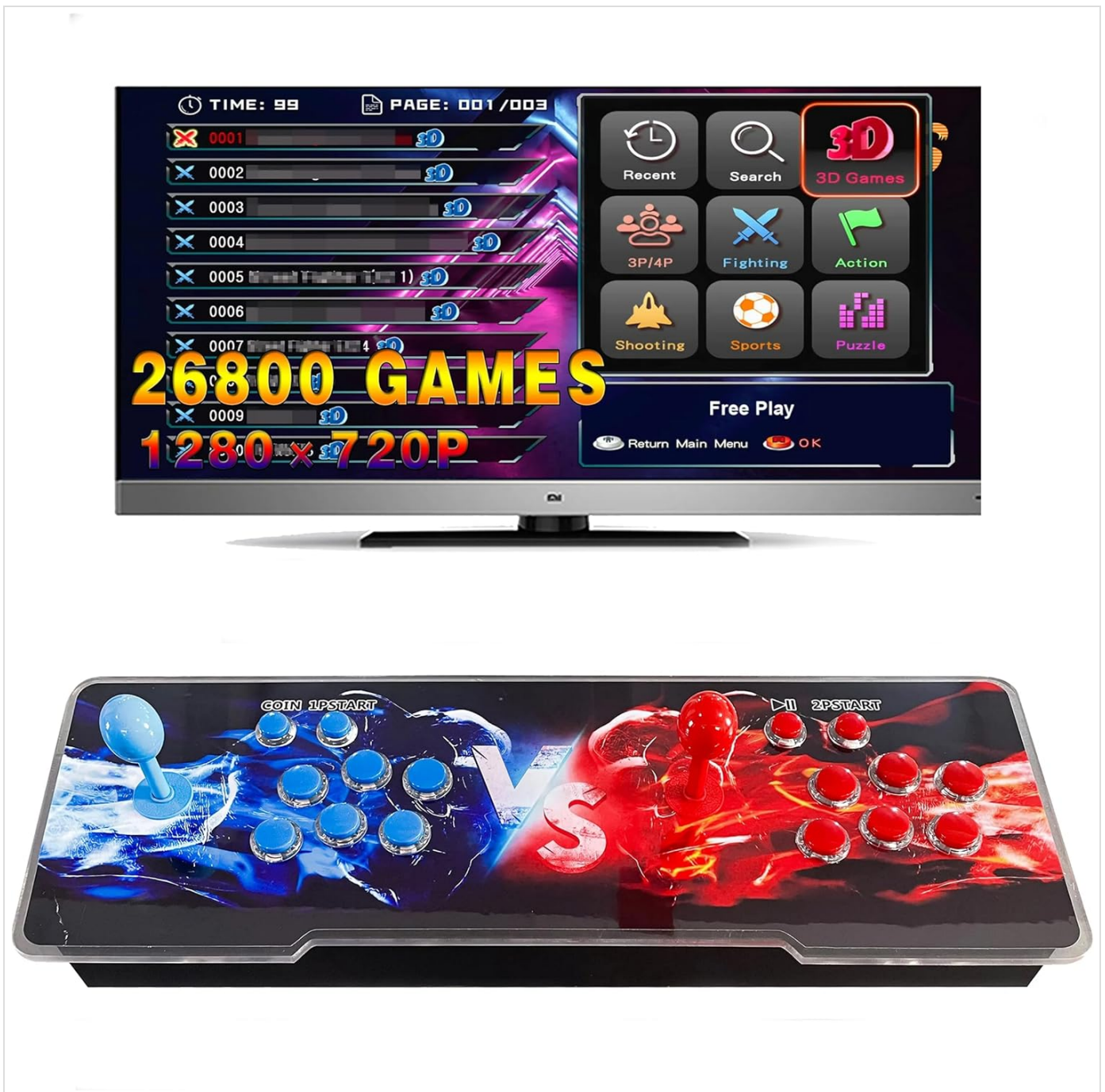
Figure 2: The DX 9800 Arcade Game Console and its display interface.