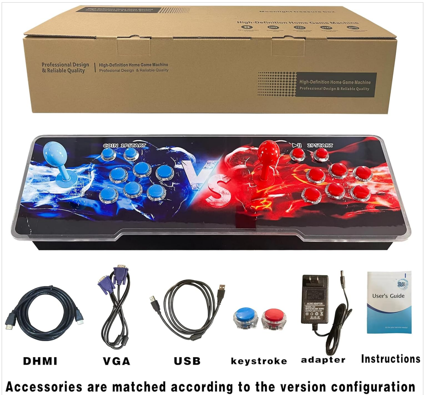
Figure 1: Package contents of the DX 9800 Arcade Game Console.