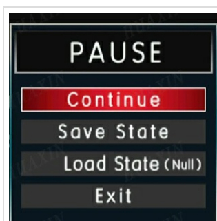
Figure 5: In-game pause menu.