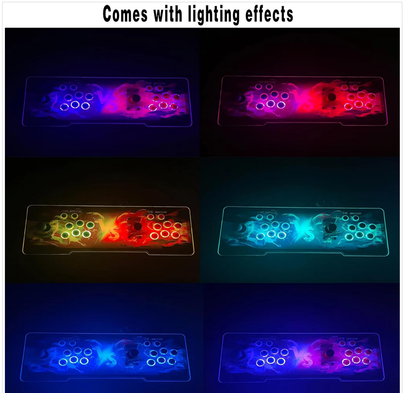
Figure 6: Console with various LED lighting effects.

The console features dynamic LED lighting effects that enhance the gaming atmosphere. These lights cycle through various colors during operation.