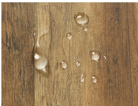
Image 6.1: The table surface is designed to be stain-resistant, making cleaning easy.