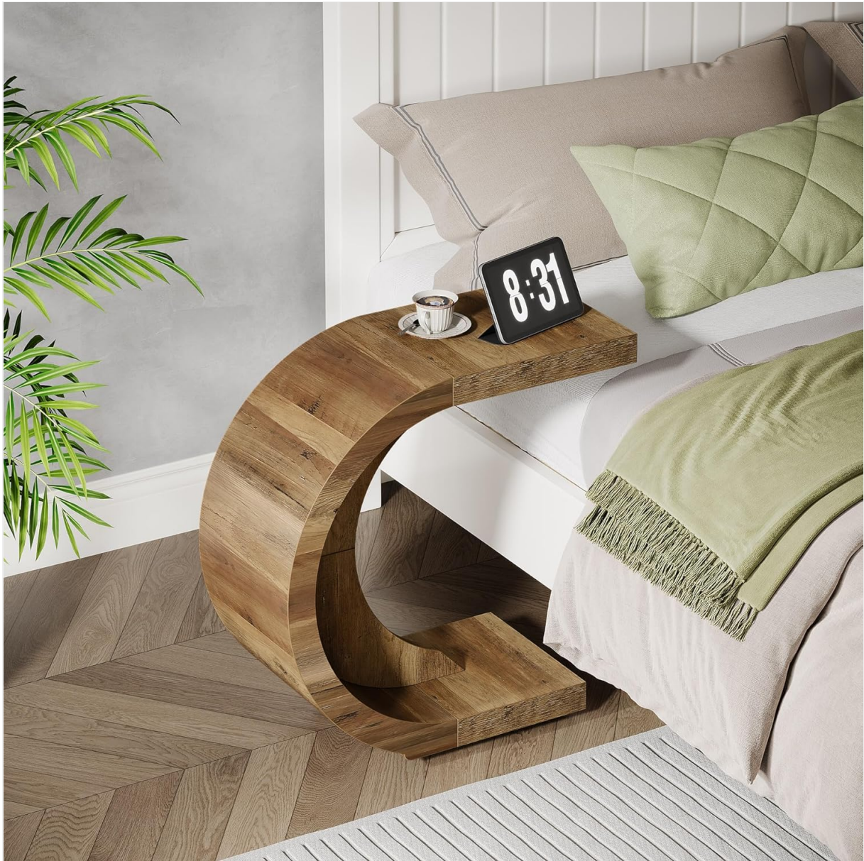
Image 5.1: The C-shaped table functions perfectly as a bedside table.

Your browser does not support the video tag.