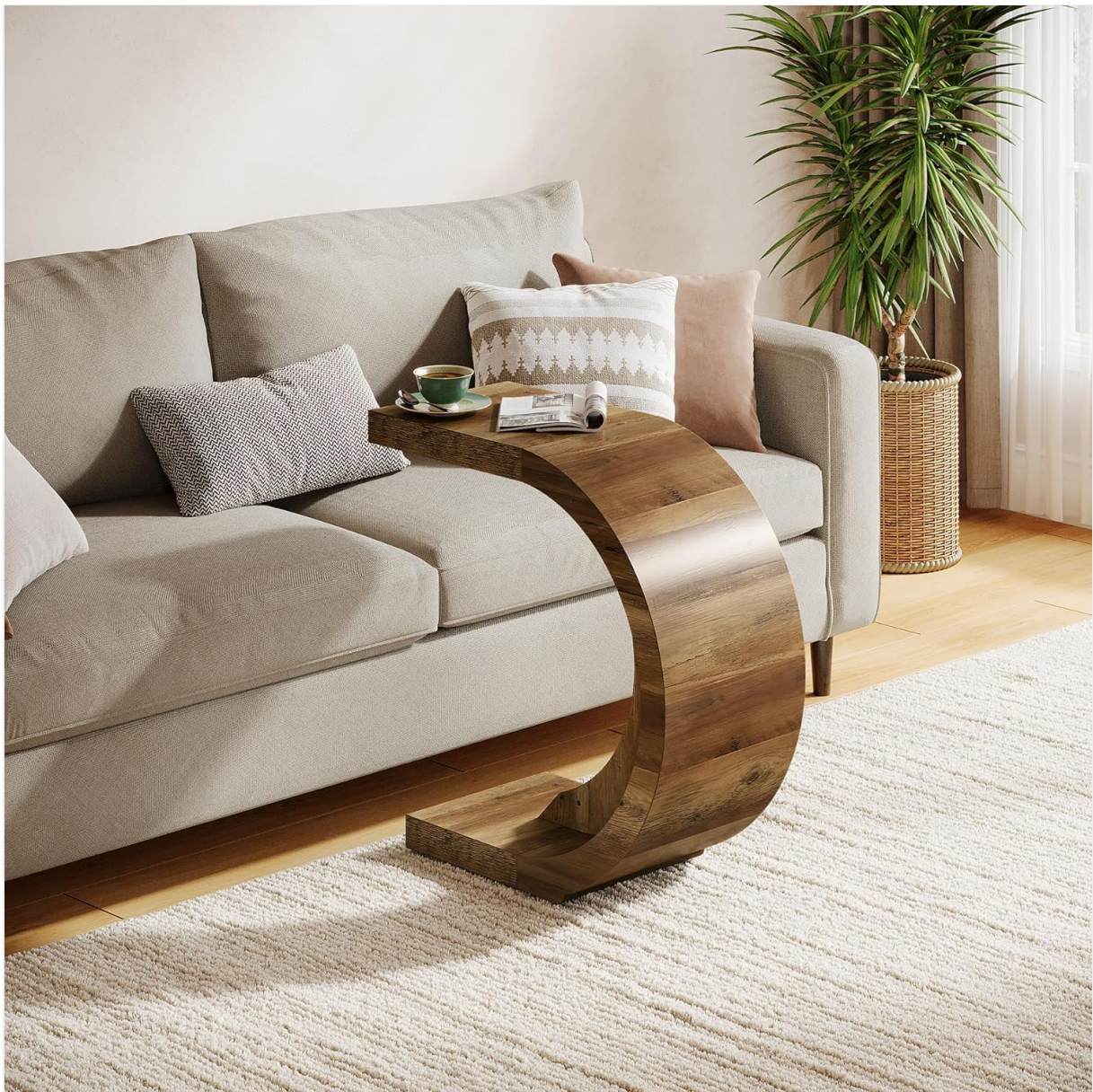
Image 1.1: Tribesigns C-Shaped End Table in a living room setting.