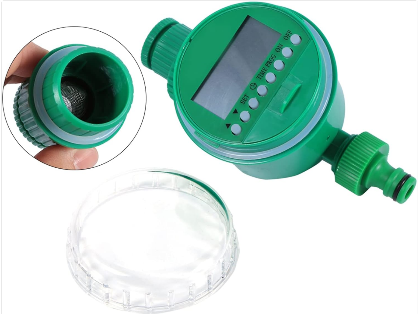
Image: The FLEXMAN irrigation timer with its battery compartment open, showing the internal components and a small filter screen, indicating where batteries are inserted and maintenance can be performed.