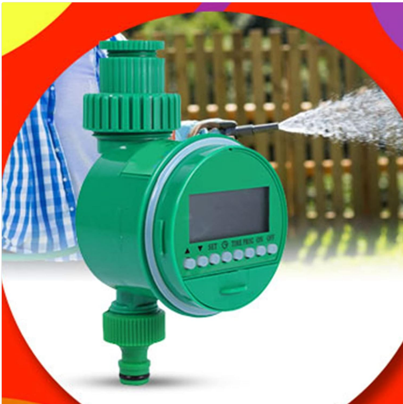
Image: The FLEXMAN irrigation timer actively watering a garden, demonstrating its function in an outdoor setting.