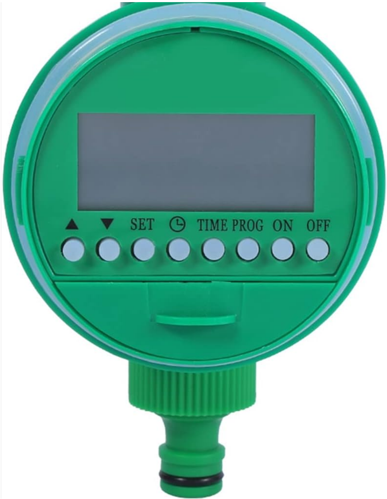
Image: A close-up front view of the FLEXMAN irrigation timer, highlighting its green casing, LCD display, and control buttons labeled 'SET', 'TIME', 'PROG', 'ON', and 'OFF'.