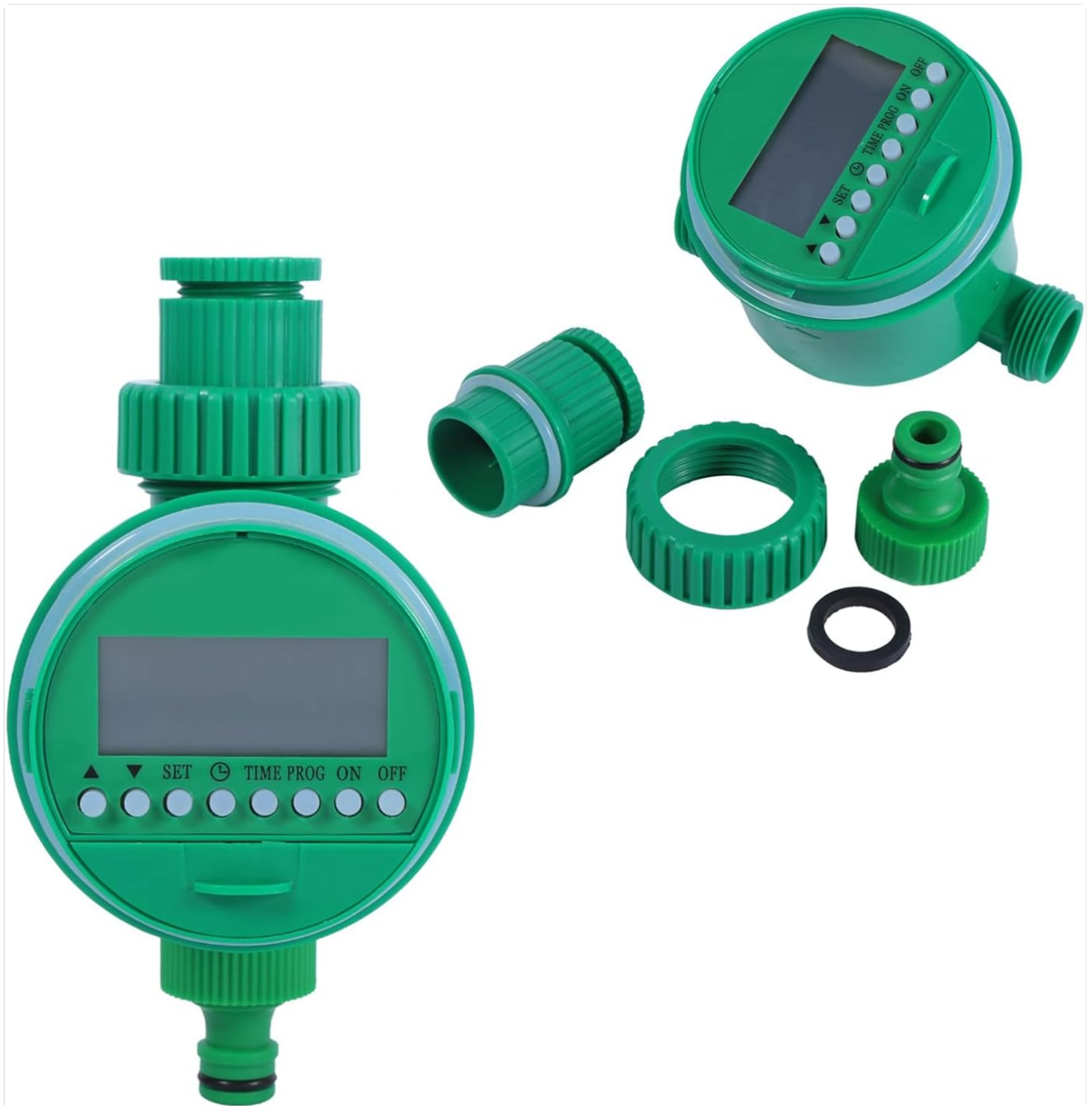
Image: The FLEXMAN irrigation timer shown with its various connection accessories, including a filter and different sized adapters.