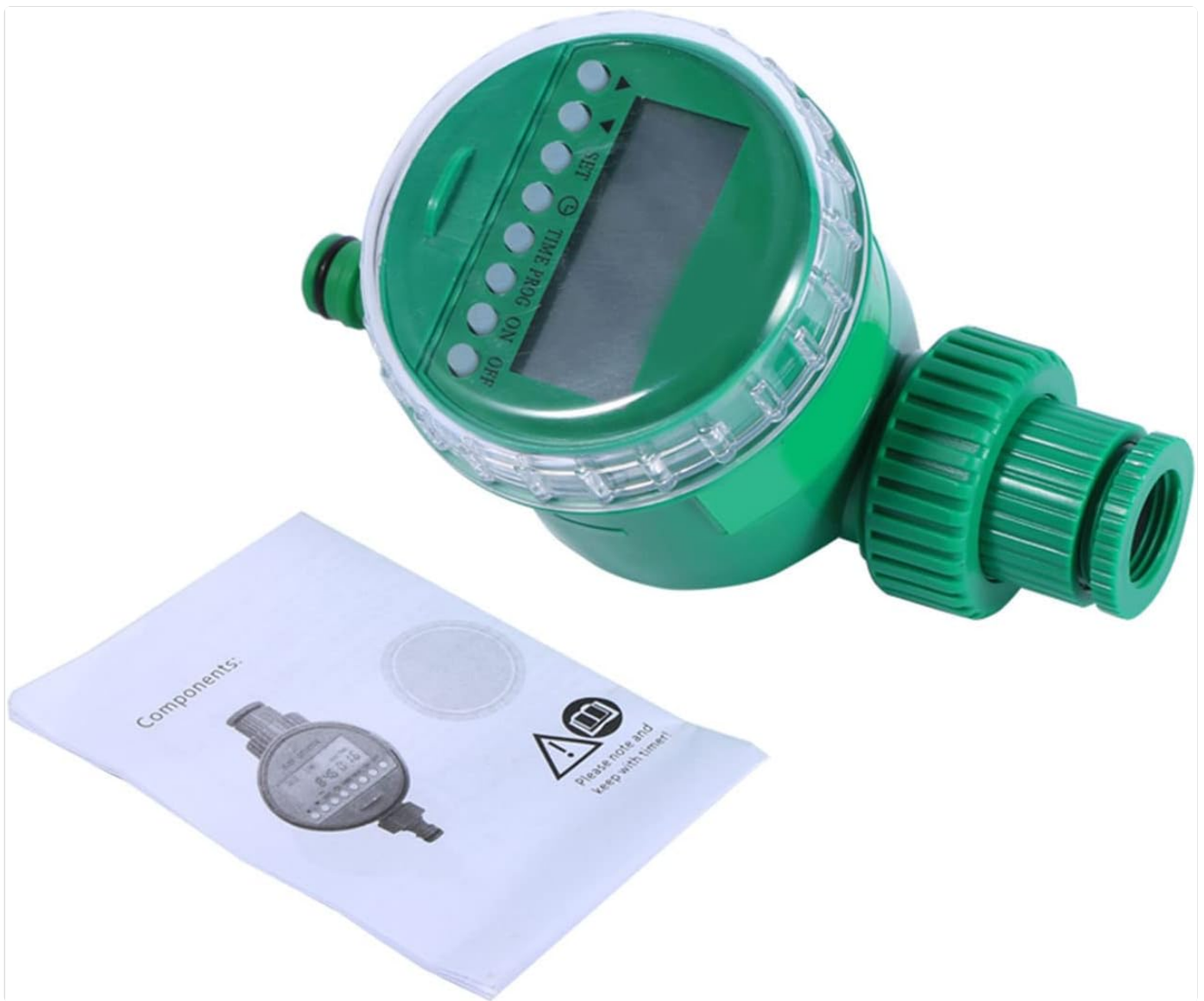
Image: The FLEXMAN irrigation timer positioned next to its user manual, indicating the included documentation.