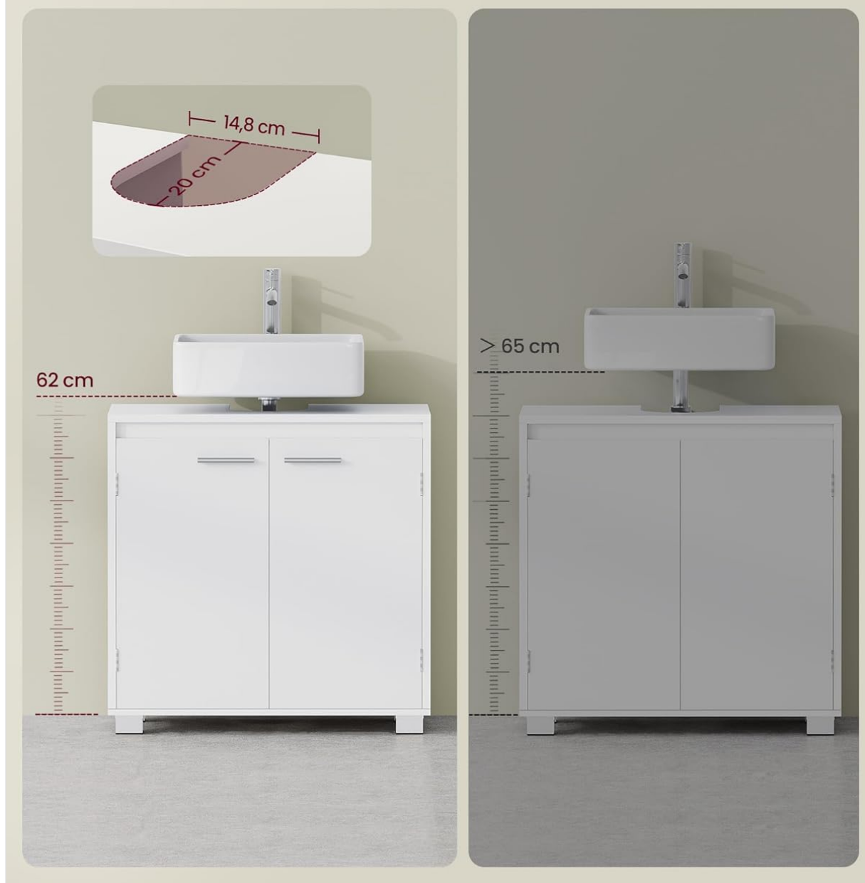
Image: The cabinet is designed for washbasins with a height of 62 cm or less from the floor to the bottom of the basin, ensuring proper fit.