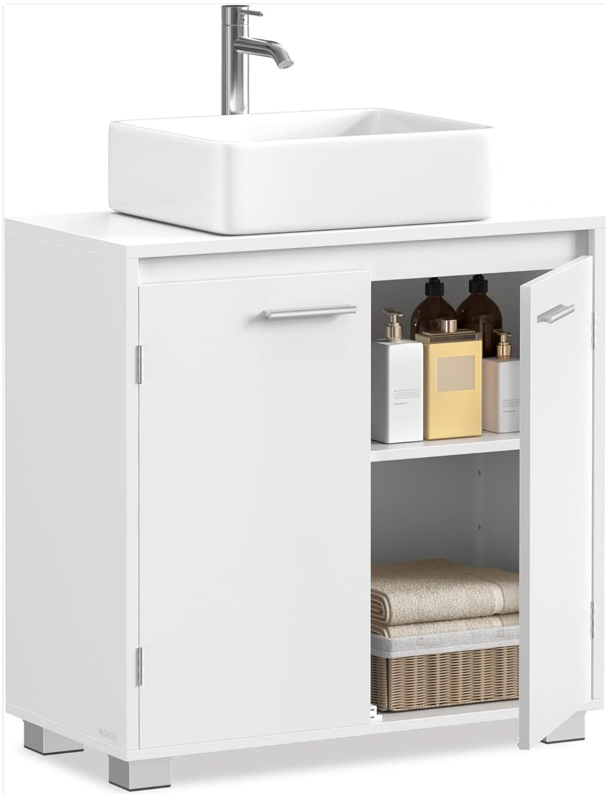
Image: The fully assembled VASAGLE BBK505W01 Bathroom Vanity Unit with a washbasin and faucet, showcasing its functional design.