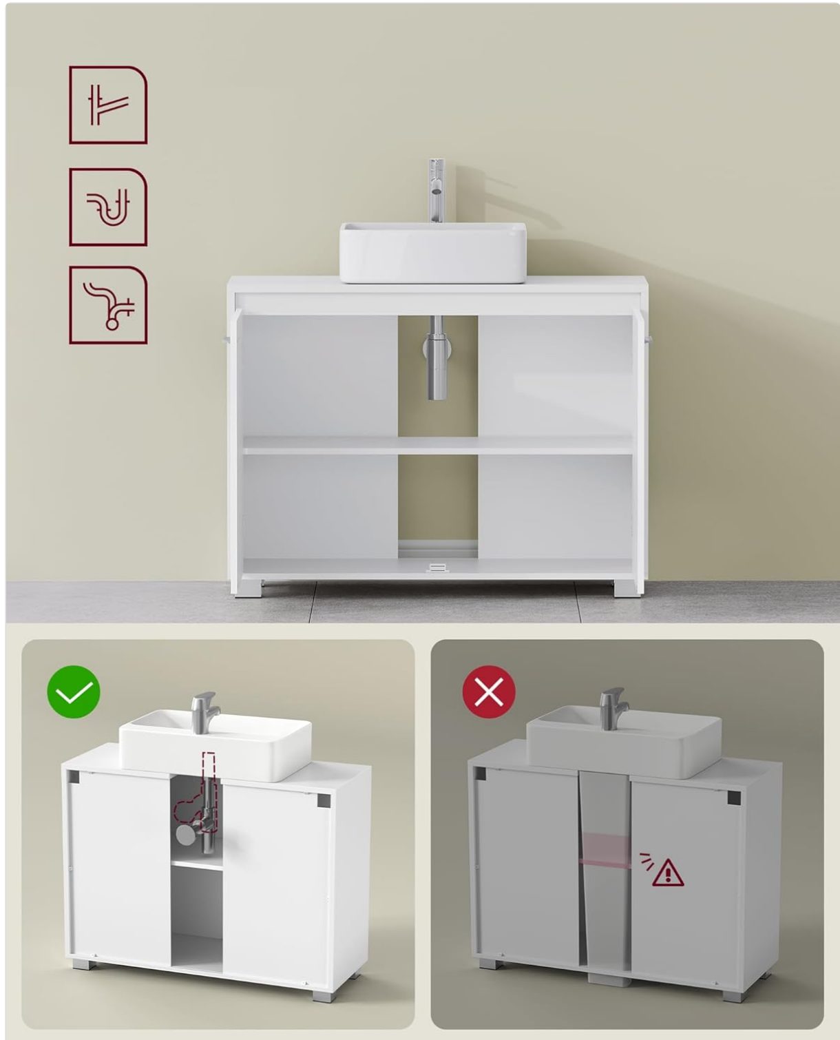
Image: Ensure your washbasin's siphon and plumbing align with the cabinet's rear opening. The top image illustrates the required pipe configuration (wall-mounted), while the bottom images show correct and incorrect fitment.