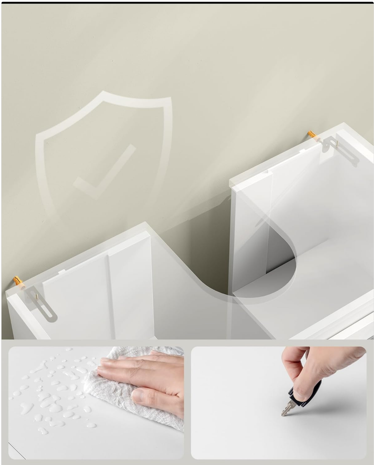
Image: The cabinet surface is designed to be wear-resistant and easy to clean, with properties that help resist water and minor scratches.