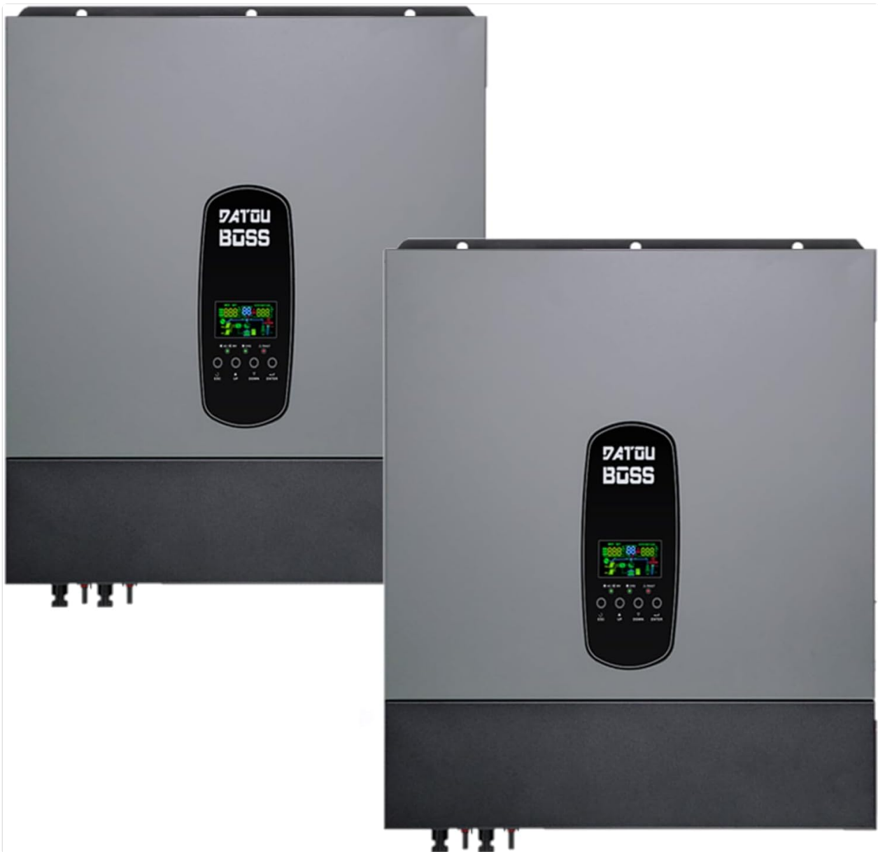
Figure 1: DATOU BOSS 11KW Hybrid Pure Sine Wave Inverter units.