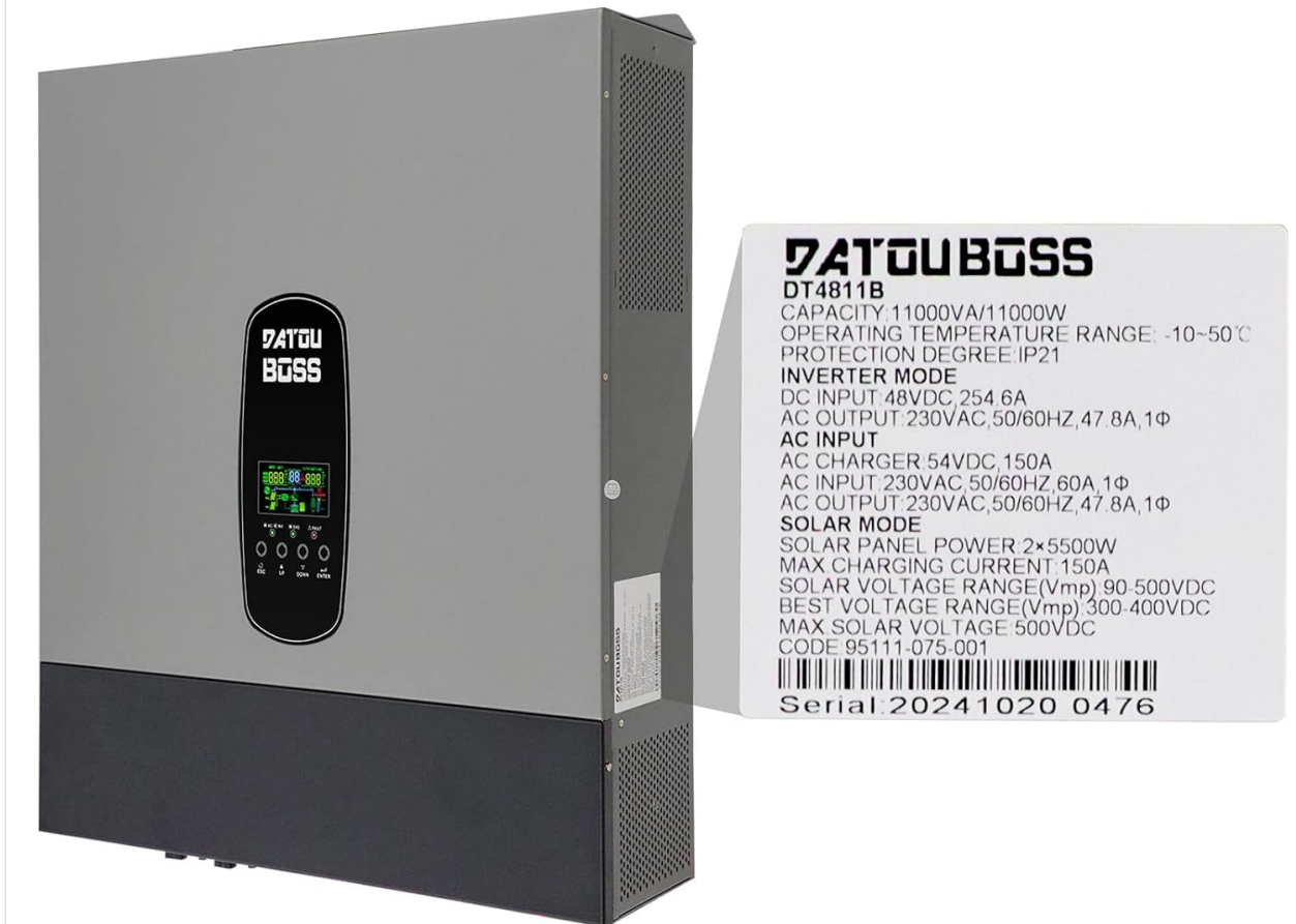
Figure 4: Product label displaying detailed technical parameters and serial number.