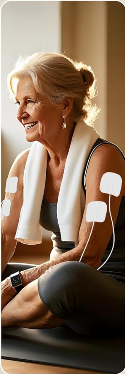
TENS PAIN RELIEF (P1-P8)