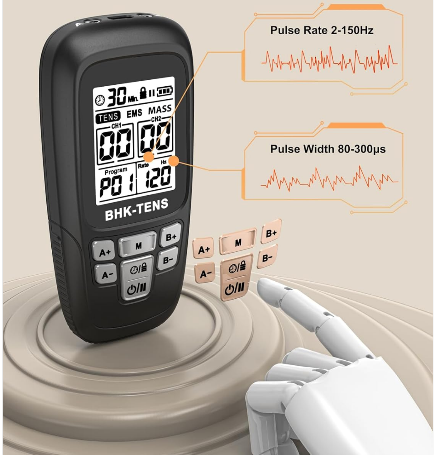
Image: BHK-TENS device displaying pulse rate and pulse width settings.