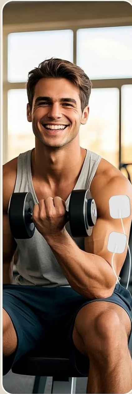
EMS MUSCLE CONDITIONING (P1-P8)