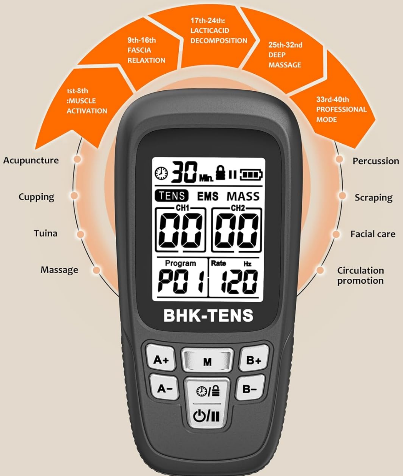
Image: BHK-TENS device illustrating its 24 modes and 40 intensity levels.