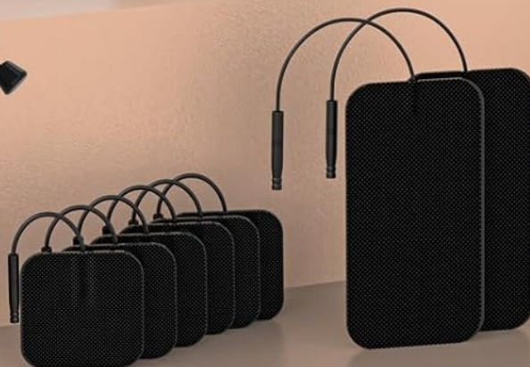
Image: All items included in the BHK-TENS product package.