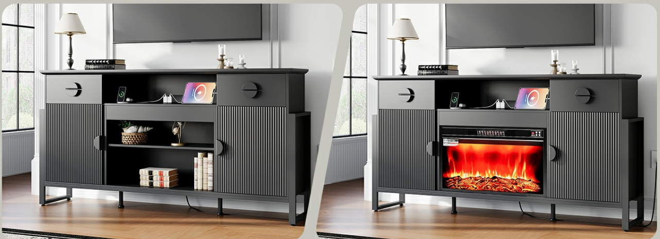
Image: The media console displaying various items stored in its shelves and drawers, demonstrating ample storage.