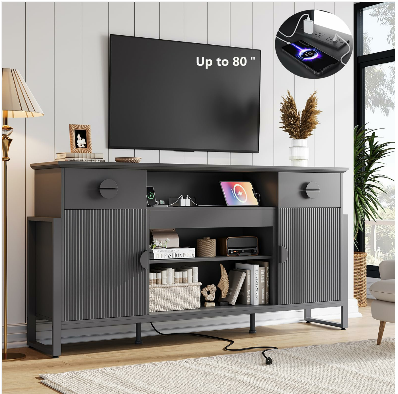
Image: The LGHM 70-inch Fluted TV Stand in a living room setting, showcasing its design and functionality.