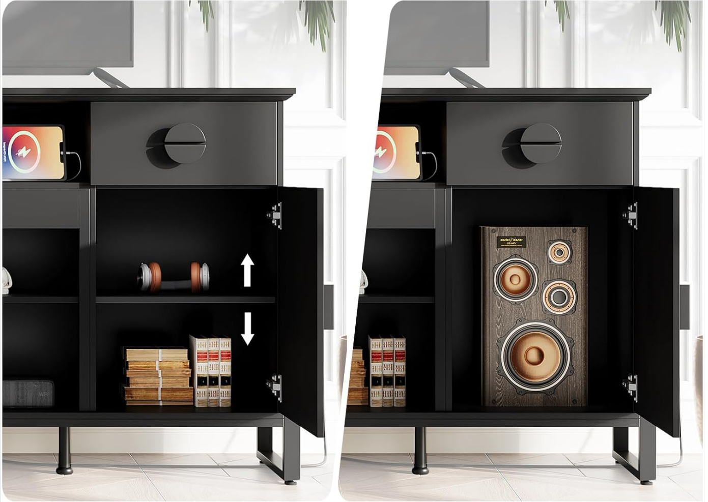
Image: Visual representation of how the shelves can be adjusted or removed to create different storage configurations.

Easily switch between 2 compartments or 1 large space for flexible storage!