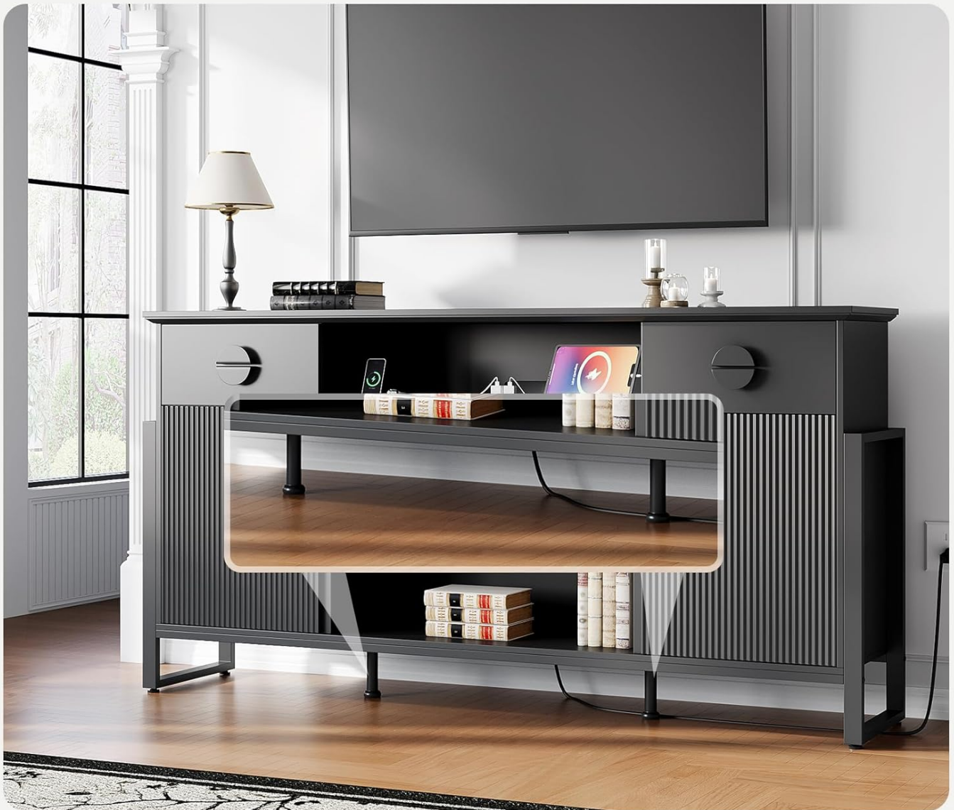
Image: Close-up of the adjustable legs and reinforced support, highlighting stability features.

Adjustable legs & reinforced support for perfect stability