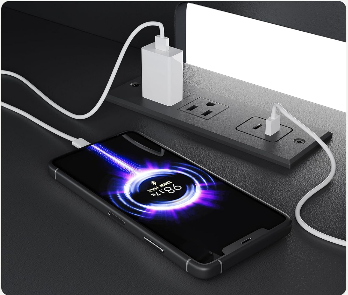
Image: A smartphone charging via the built-in USB port, with AC outlets visible.

Your TV, gaming gear, and lights plug directly into the stand