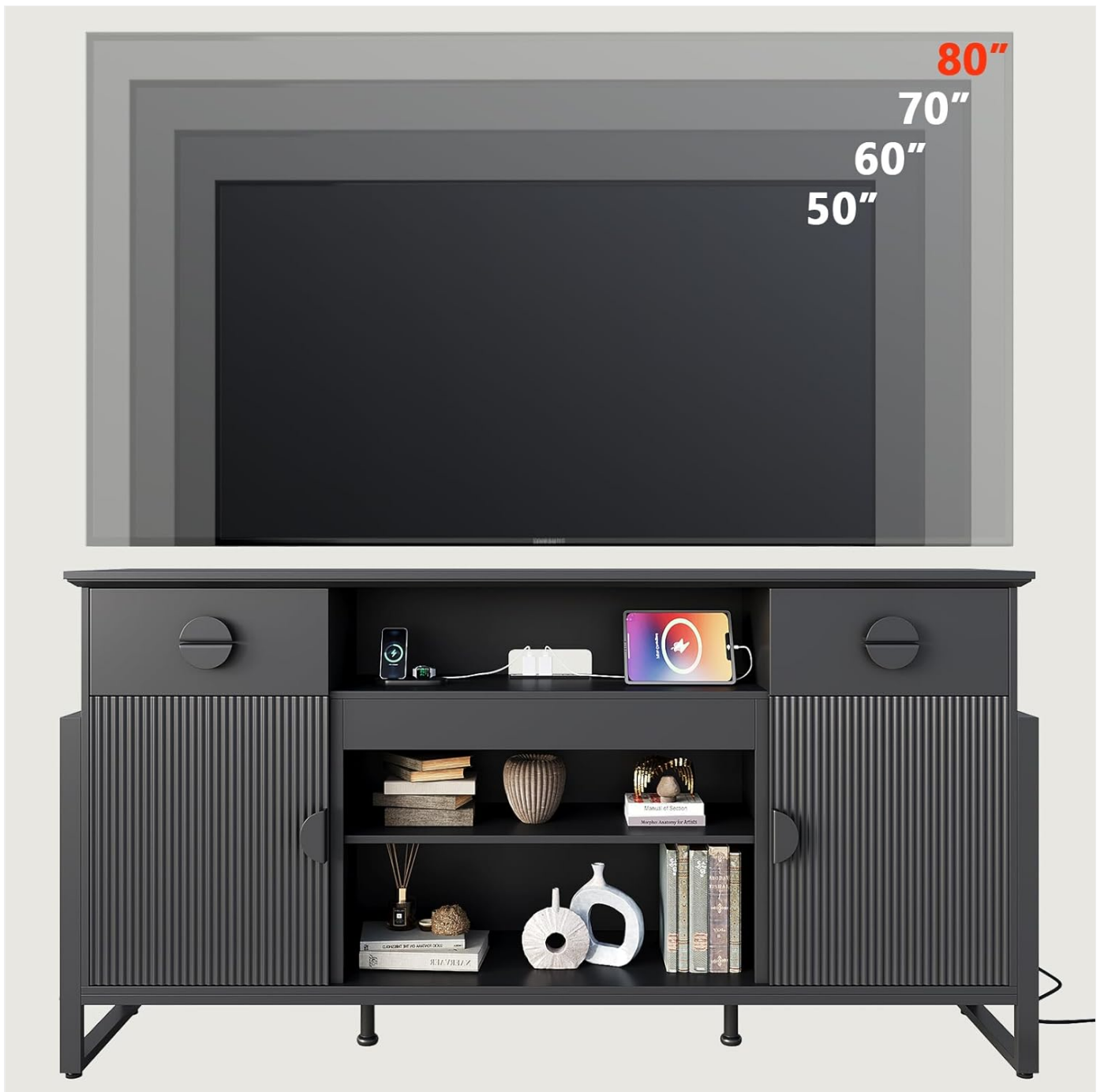
Image: A visual guide demonstrating the compatibility of the TV stand with various TV sizes, up to 80 inches.