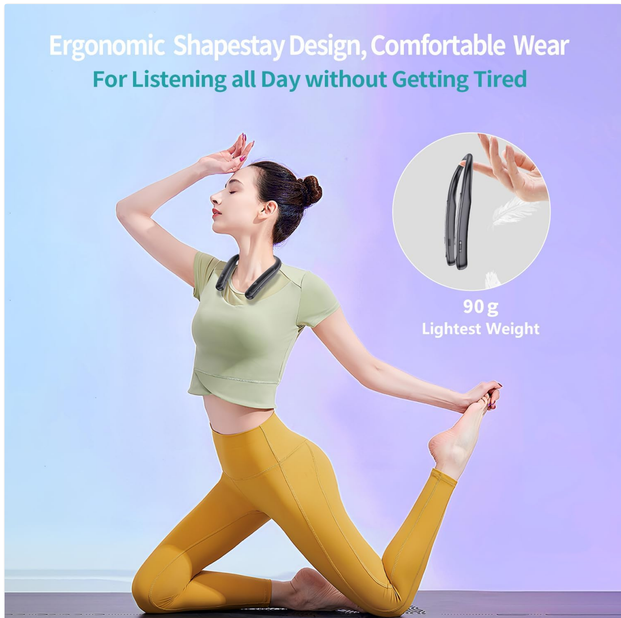
Image 5.1: A woman wearing the Gardway BBH-939s Neckband Speaker during a yoga session, demonstrating its lightweight and ergonomic design for comfortable all-day wear.

Wear the neckband speaker comfortably around your neck. The ergonomic design ensures a light and secure fit.