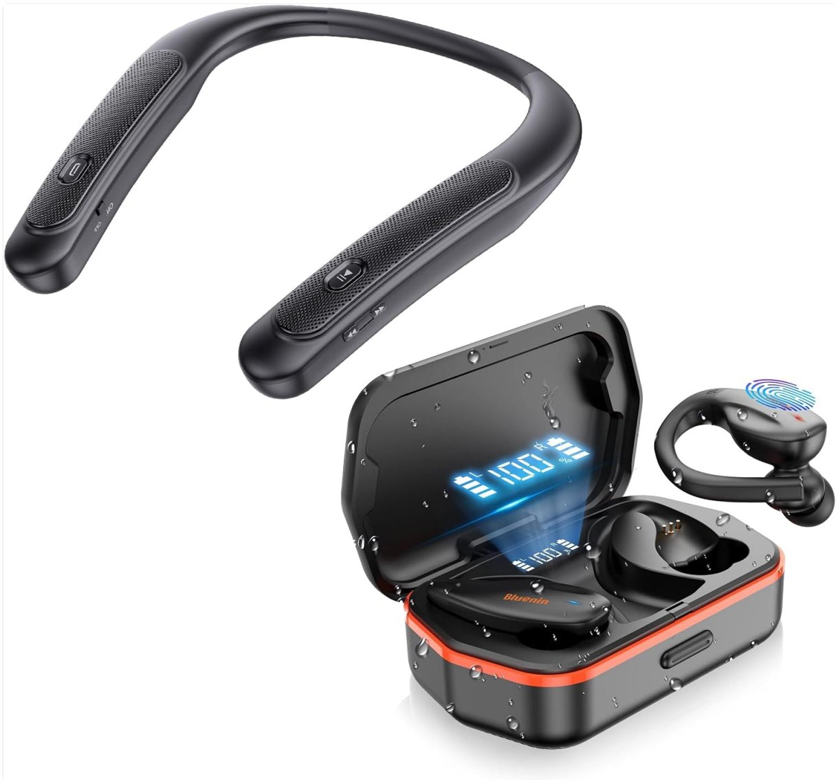
Image 1.1: The Gardway BBH-939s Neckband Bluetooth Speaker and T30 True Wireless Earbuds, showcasing both components.