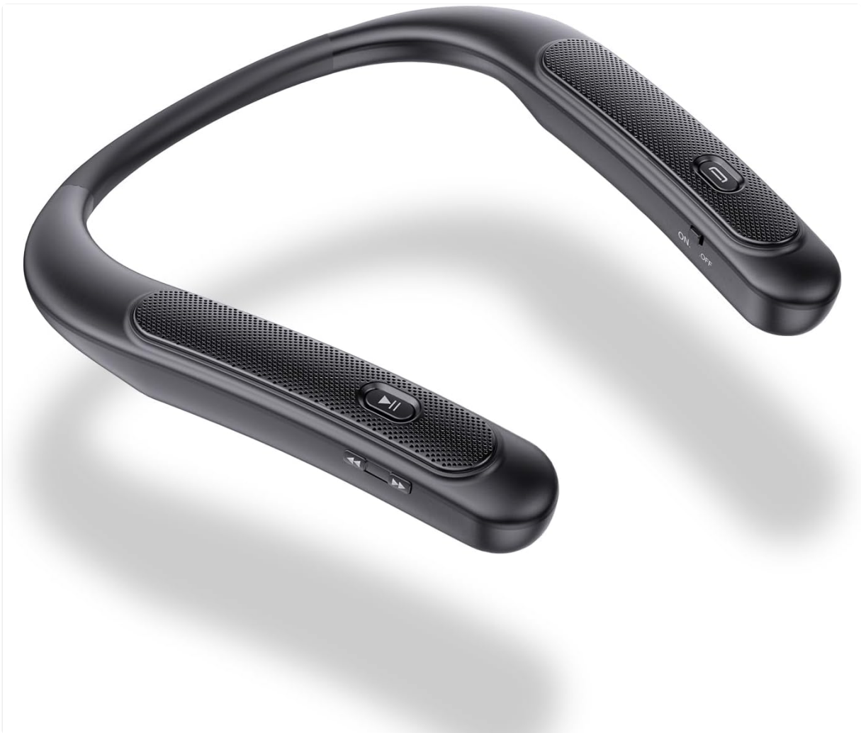
Image 3.1: The Gardway BBH-939s Neckband Bluetooth Speaker, showing its ergonomic design and controls. The BBH-939s neckband speaker is designed for comfortable wear around the neck, providing an immersive audio experience without covering the ears. It features four strategically placed speaker units for 360-degree sound.