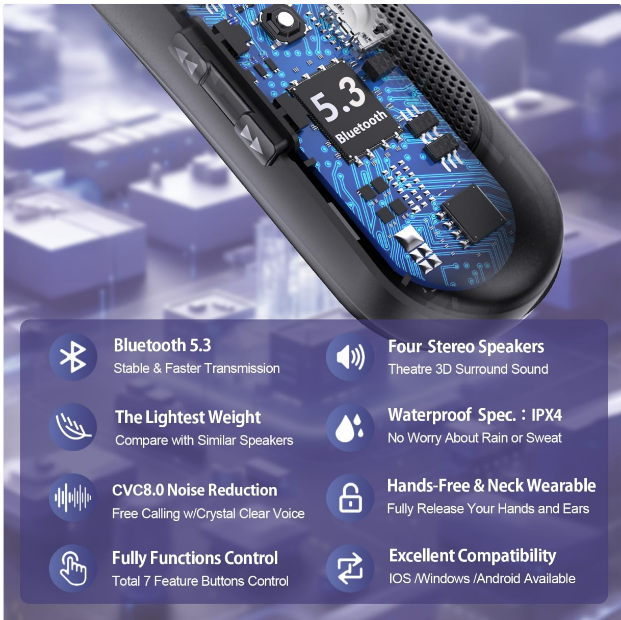
Image 4.2: Infographic highlighting key features including Bluetooth 5.3 technology, four stereo speakers, IPX4 waterproof rating, CVC8.0 noise reduction, hands-free design, full function control, and broad compatibility.