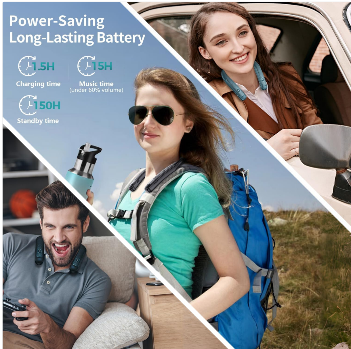
Image 4.1: Battery life information for the neckband speaker, indicating charging time, music time, and standby time.

Before first use, fully charge both the neckband speaker and the earbuds.