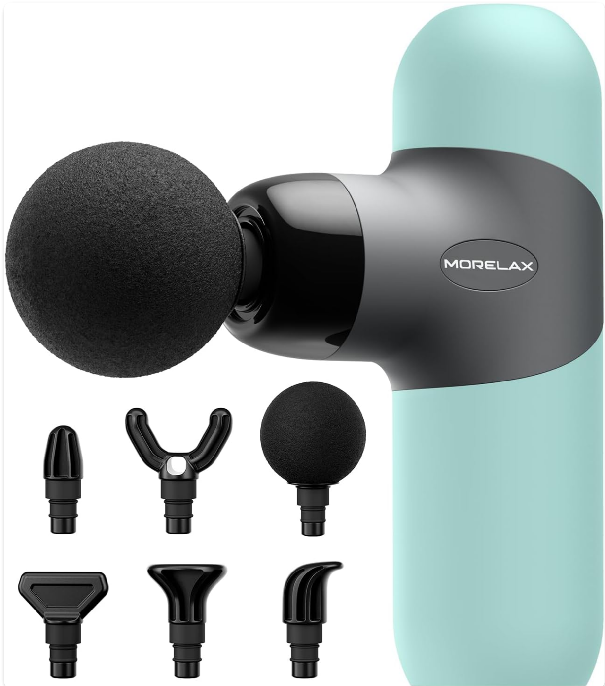
Image: The Morelax Mini Massage Gun, showcasing its compact design.

relief. It features a brushless motor, multiple speed settings, and interchangeable massage heads to target various muscle groups.