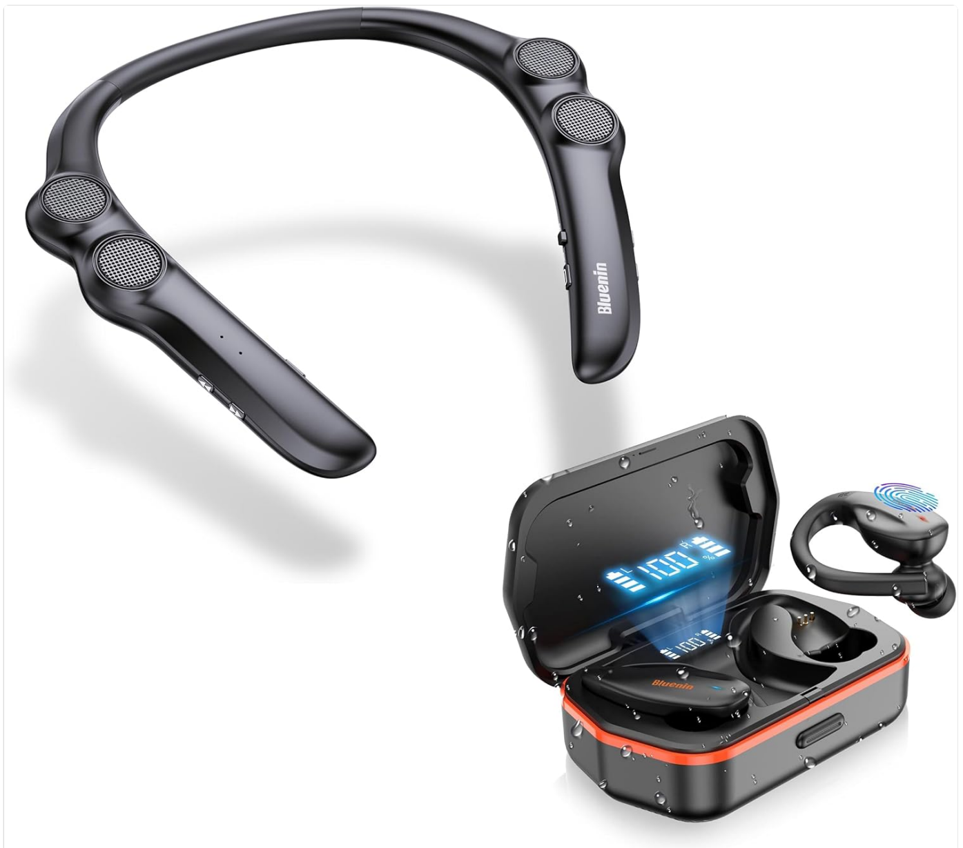
Image: The Gardway BBH-929s Neckband Bluetooth Speaker and T30 True Wireless Earbuds, showcasing both devices together.