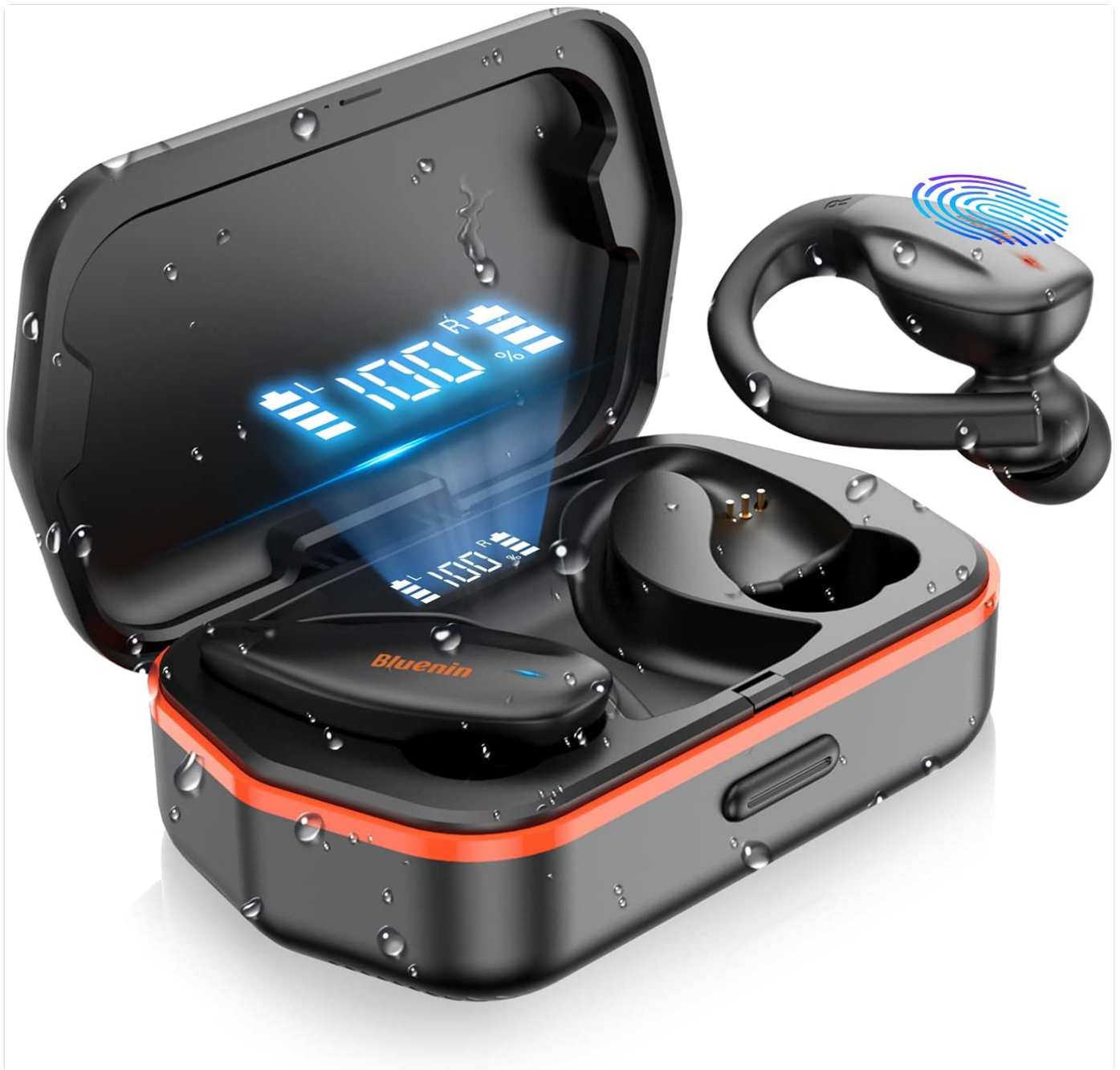
Image: The Gardway T30 True Wireless Earbuds placed inside their charging case, showing the digital battery display.