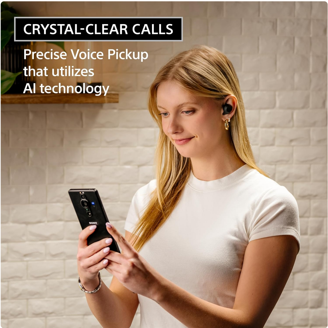
Figure 5: Showcases the clear call quality feature of the earbuds.

Precise Voice Pickup that utilizes AI technology