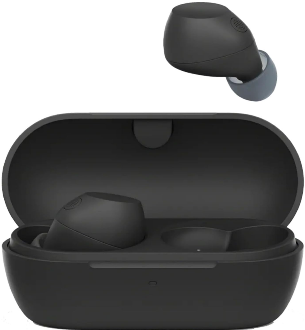
Figure 7: Close-up of the earbuds showing their water-resistant design.