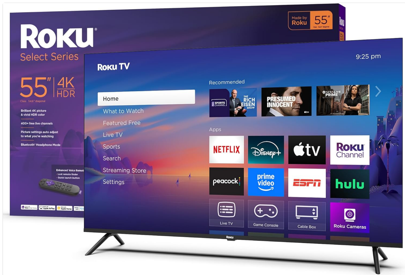
Figure 1: Roku Smart TV 2025 – 55-Inch Select Series

This manual provides essential information for setting up, operating, and maintaining your Roku Smart TV 2025 – 55-Inch Select Series. Please read thoroughly before use.