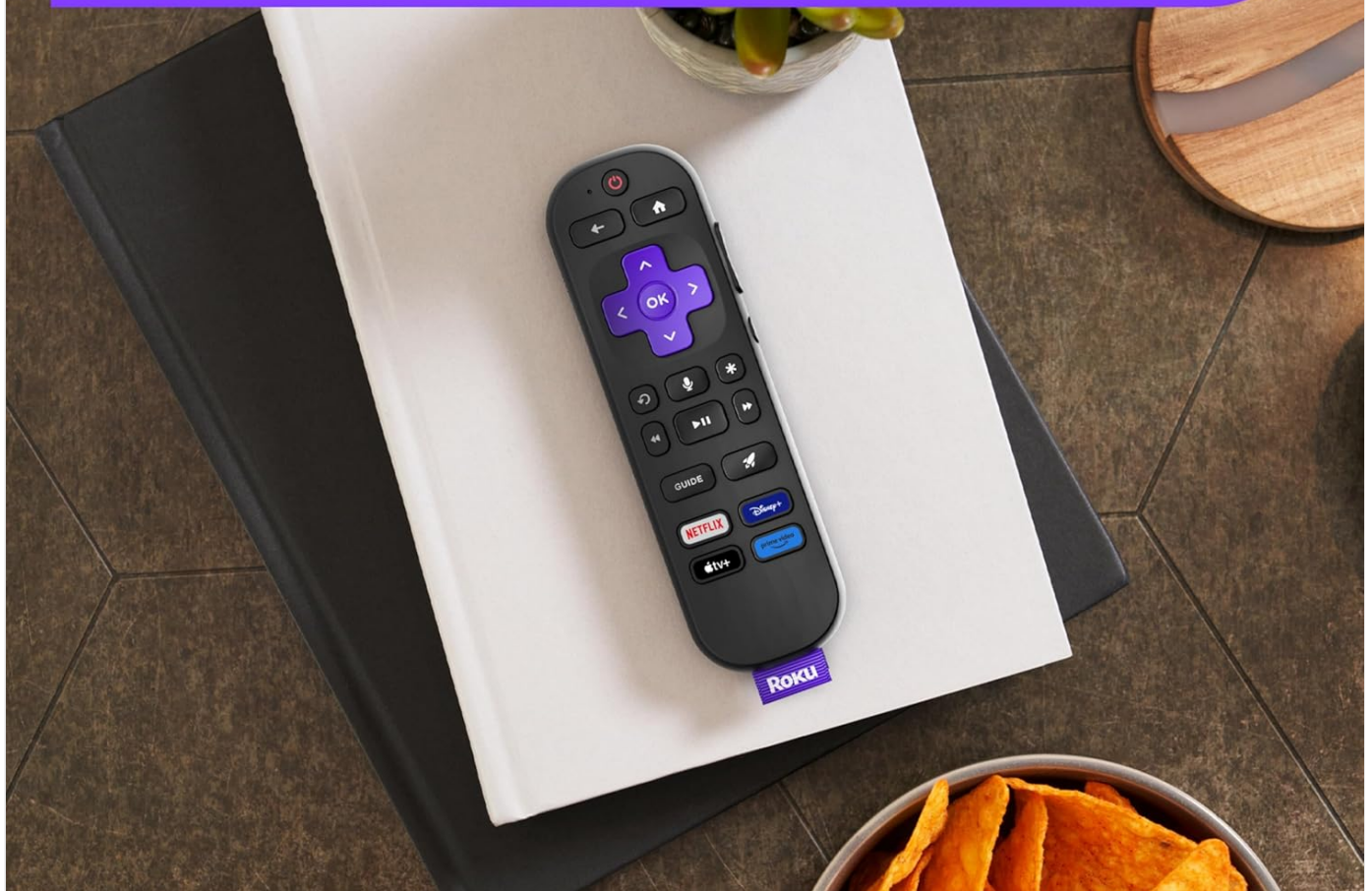
Figure 4: Enhanced Voice Remote.