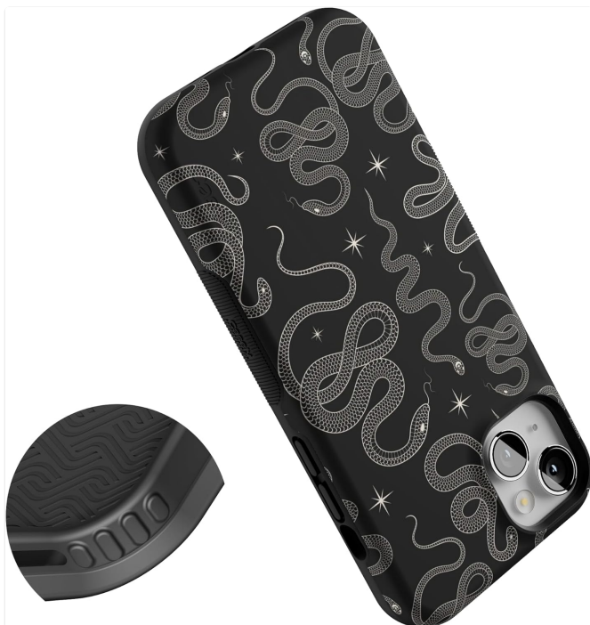
Image: Detail of the slip-resistant side grips for enhanced handling.