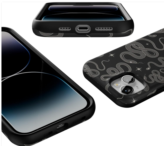
Image: Bottom view of the case, highlighting port alignment.