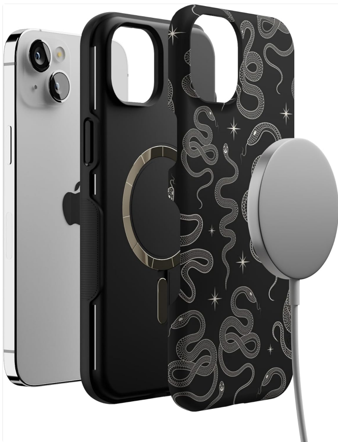
Image: MagSafe charger magnetically attached to the back of the case.