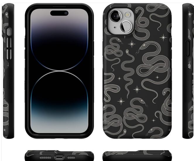
Image: Various angles of the case, highlighting precise cutouts for ports and buttons.