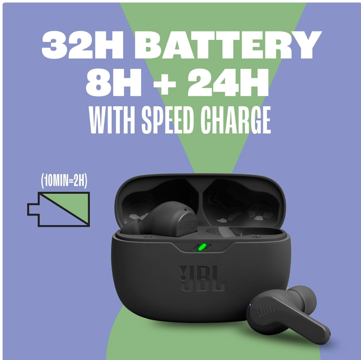
Image: JBL Vibe Beam earbuds in their charging case, illustrating the 32-hour battery life and speed charging capability.