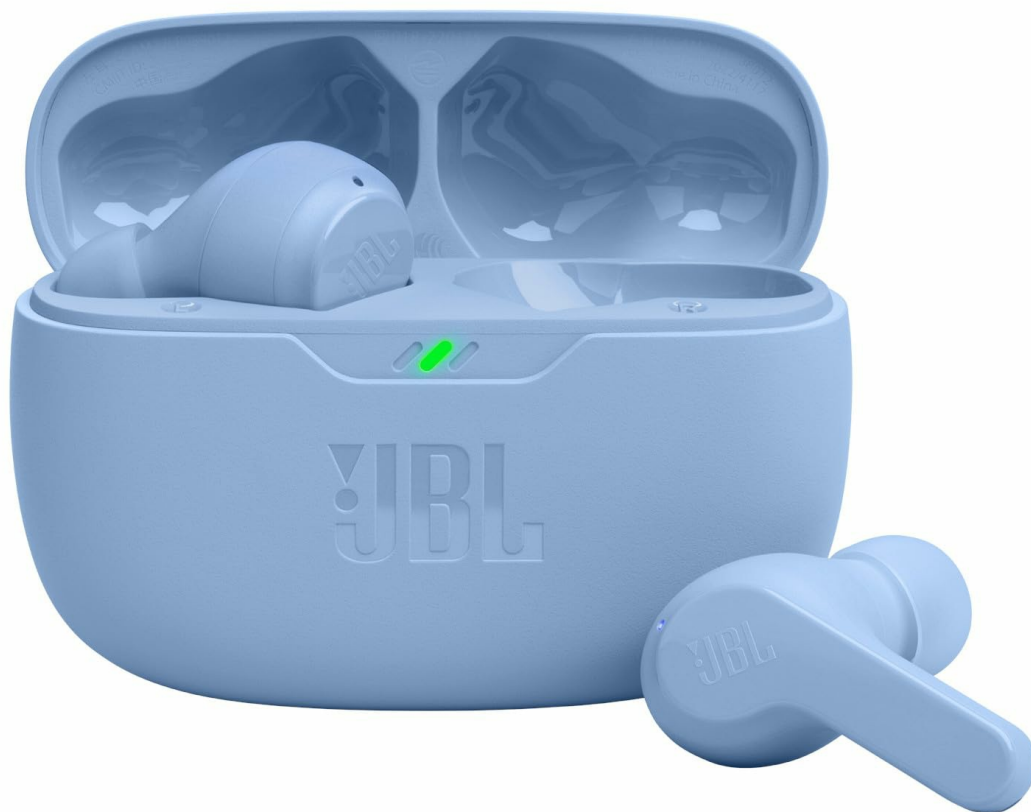
Image: JBL Vibe Beam True Wireless Earbuds in blue, showcasing their sleek design.