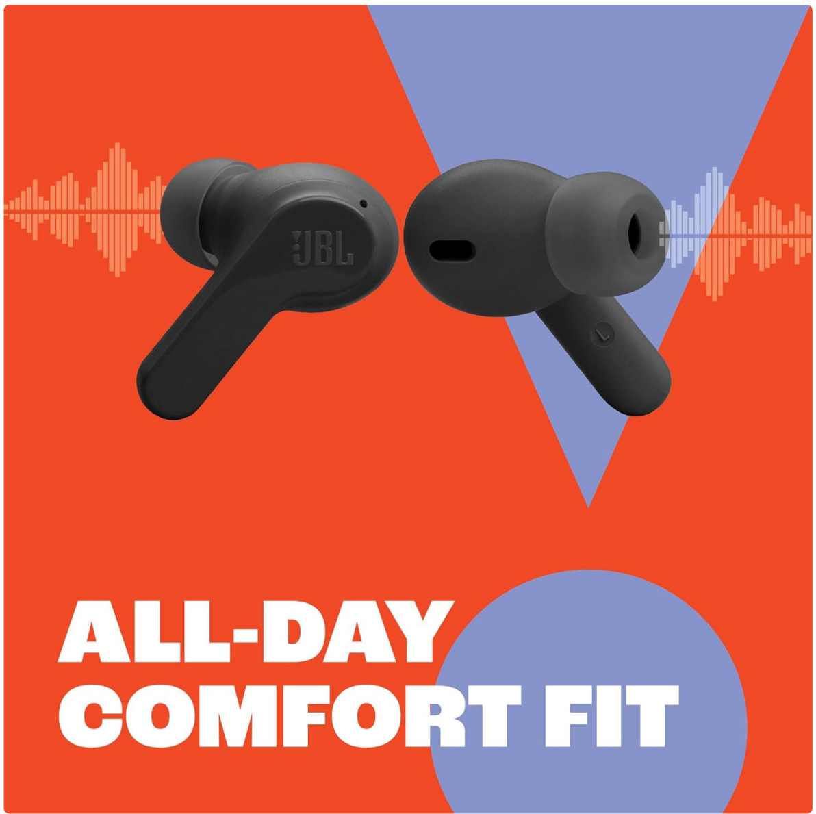
Image: JBL Vibe Beam earbuds emphasizing their comfortable fit for all-day wear.