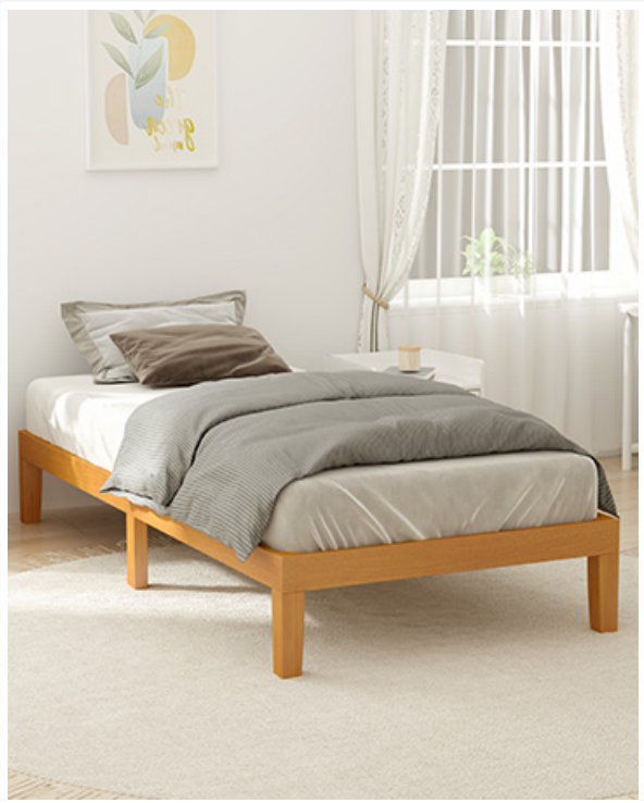
Figure 3: Illustration of the 8.5-inch under-bed storage space.