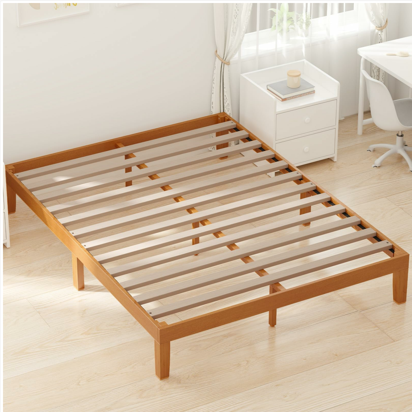
Figure 4: Detailed dimensions of the DUMOS Full Size Wood Bed Frame.

Brand: DUMOS Model Number: DM-WCJ-F Size: Full Product Dimensions: 74.4"L x 53.5"W x 12"H Material: Wood (Pine) Weight Capacity: Up to 700 lbs Under-bed Clearance: 8.5 inches Assembly Required: Yes Special Feature: No Box Spring Needed, Space Saving