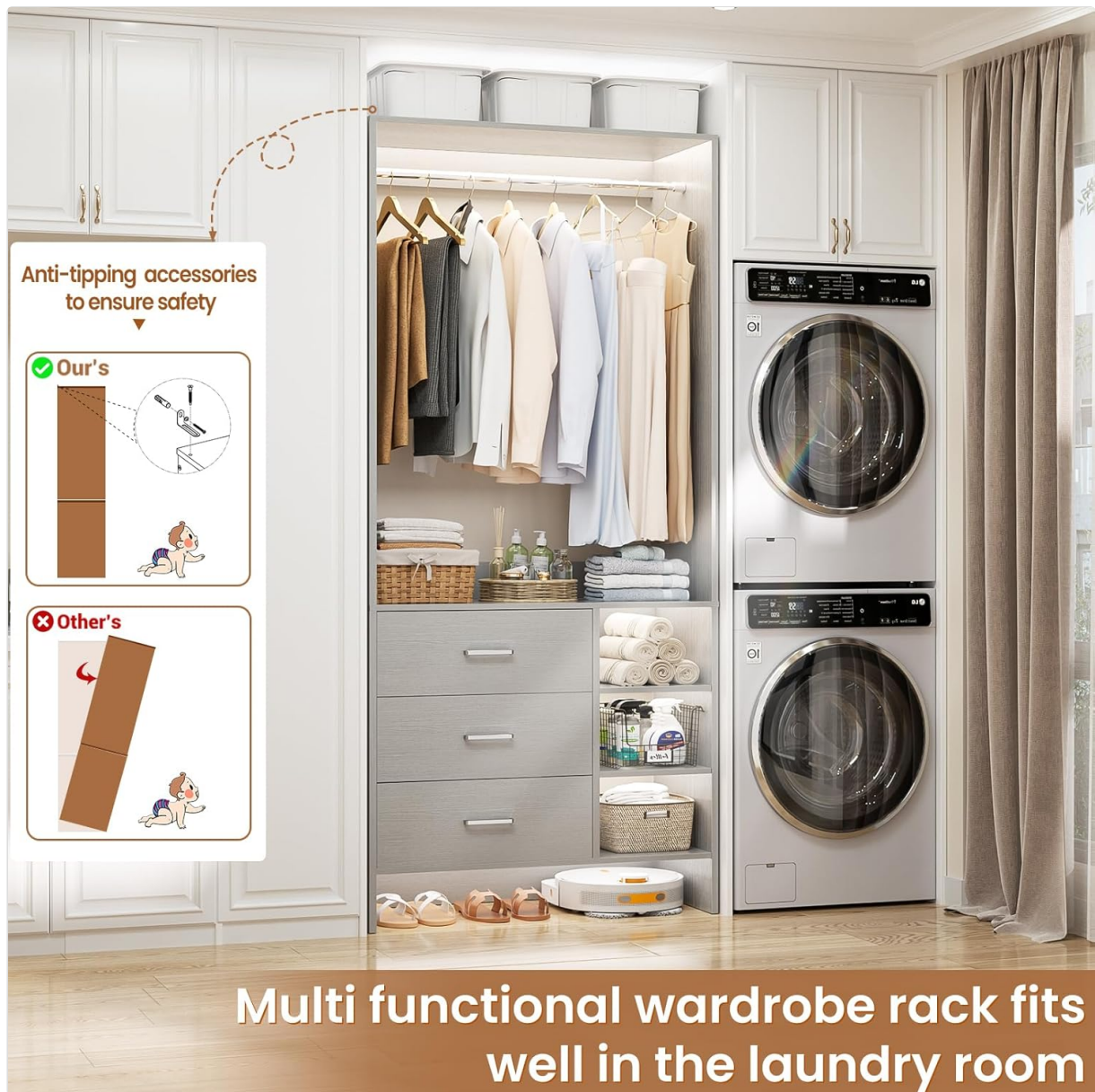
Figure 5.3: The closet system integrated into a laundry room, demonstrating its versatility for various household storage needs.