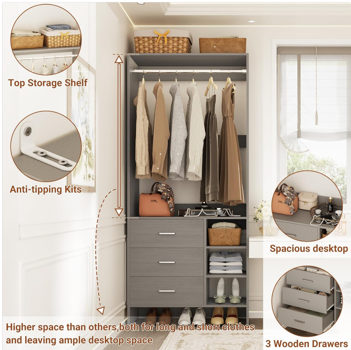
Figure 2.1: Illustration of the anti-tipping kits and key structural features. The anti-tipping kits are crucial for securing the unit and preventing accidental falls.