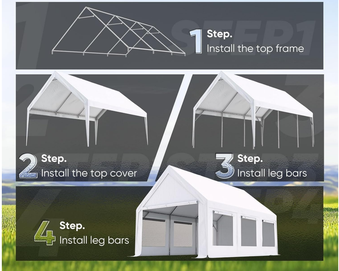
Figure 7: Carport tent configured for an outdoor event.

Just four steps to complete the installation, simple, fast, and effortless.