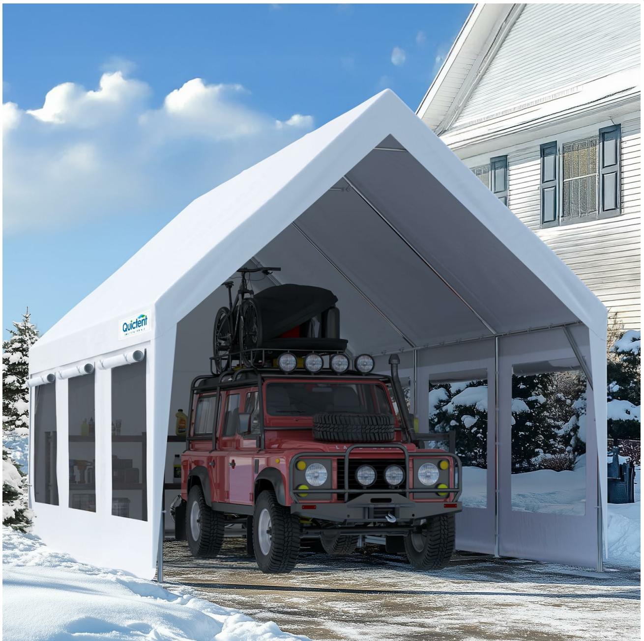
Figure 1: Assembled Quic Tent 12x20 ft Carport Tent.