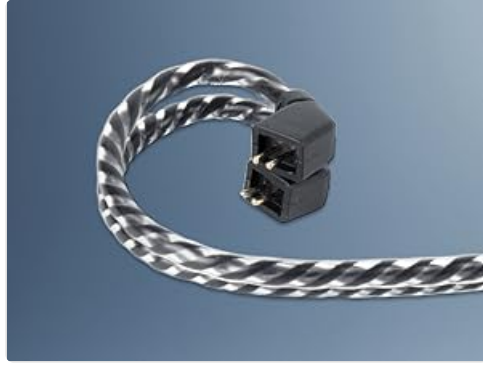
Figure 4.2: Detachable Cable Connection