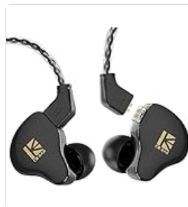
Figure 4.4: Wide Compatibility

Connect the 3.5mm jack to your audio device (smartphone, tablet, laptop, gaming console, etc.).