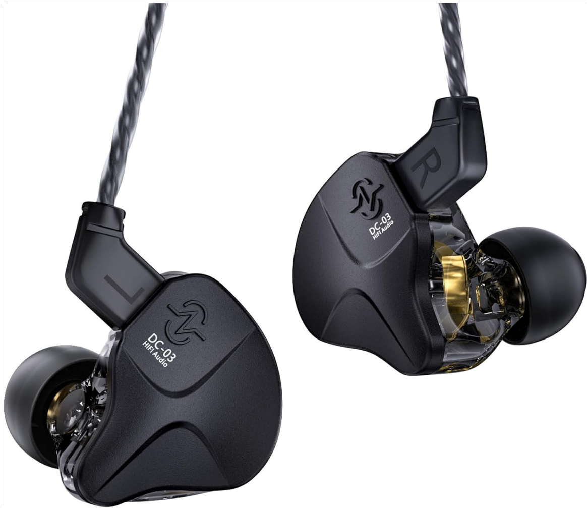
Figure 1.1: CCZ DC03 In-Ear Monitor Headphones