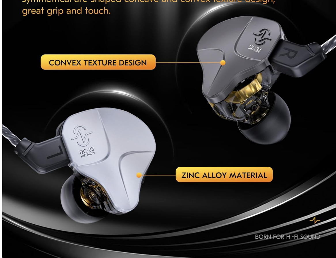
Figure 3.2: Full Metal Lightweight Cover Detail

Zinc alloy material, two craftsmanships, minimalist central symmetrical arc-shaped concave and convex texture design, great grip and touch.