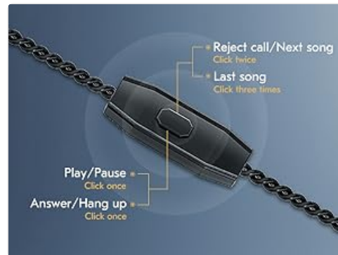
Figure 5.1: Inline Control Functions

The CCZ DC03 is suitable for various applications, including gaming, music listening, studio work, and general daily use.