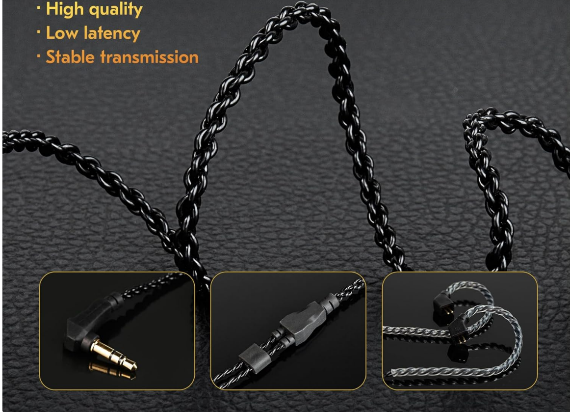
Figure 3.4: Detachable Cable Features