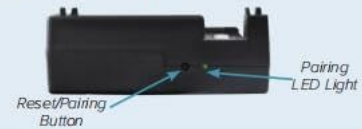
Image 3.2: Detailed pairing instruction diagram for the remote control and bed base.

Locate the Control Box (see base overview and quick reference guide for corresponding base) and press the Reset/Pairing button twice. A pairing LED light will illuminate green on the Control Box. On the back of the remote, press and hold the PAIR button. The PAIR button will illuminate blue and start flashing. When the PAIR button stops flashing, the green LED light on the Control Box will go out. Release the PAIR button. The remote is now paired to the adjustable base.