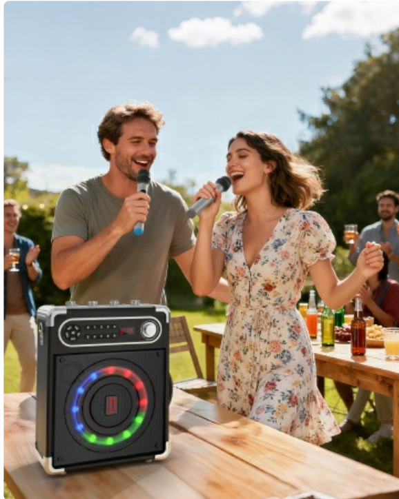
Image: Visual representation of the different voice changing effects available on the microphone.