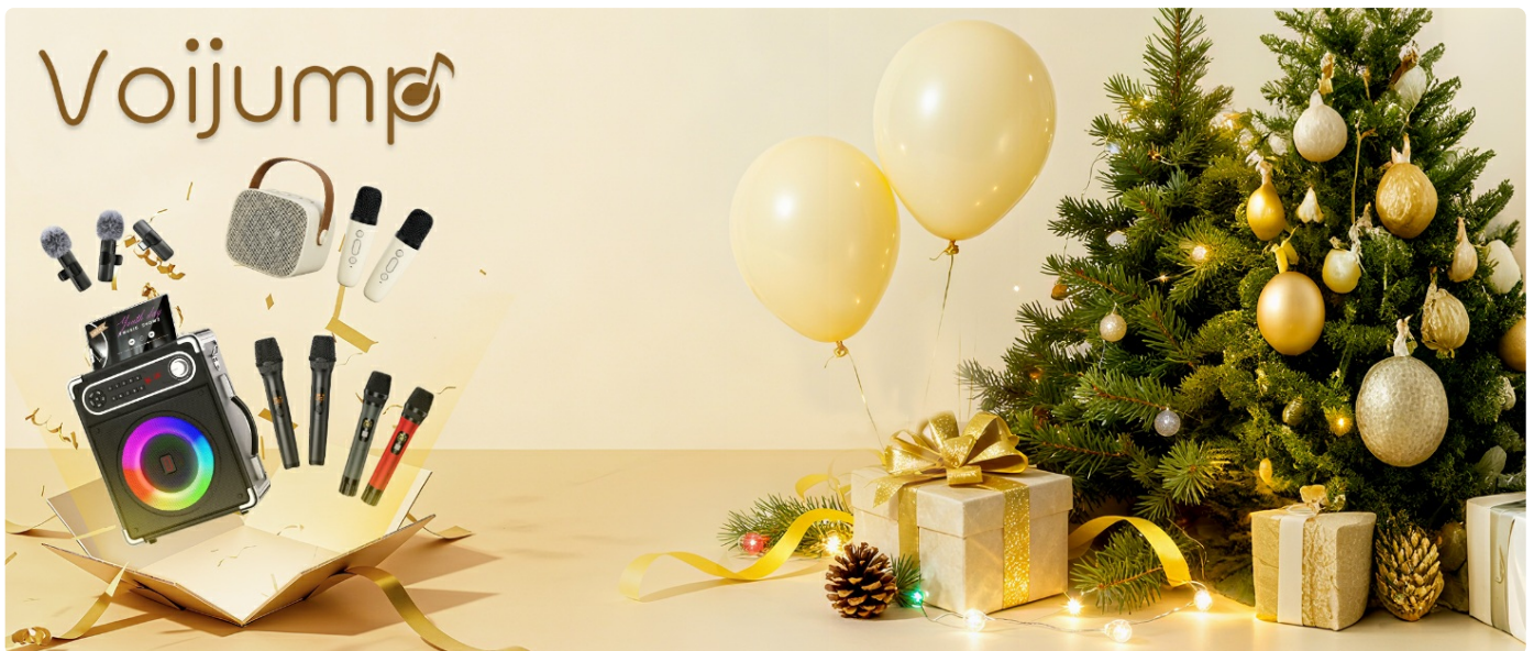
Image: The voijump K304 Mini Portable Bluetooth Karaoke Machine, showcasing the speaker and two wireless microphones.

The voijump K304 Mini Portable Bluetooth Karaoke Machine is designed for versatile audio entertainment. It features a compact speaker and two wireless microphones, offering high-fidelity sound and various functions for an enhanced singing experience. This device supports Bluetooth 5.3 connectivity and TF/Micro SD card playback, making it suitable for various environments.