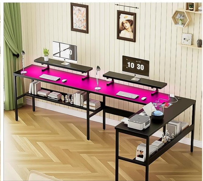
Right L Shaped Desk

Image: Various desk configurations possible with the iSunirm U Shaped Computer Desk.