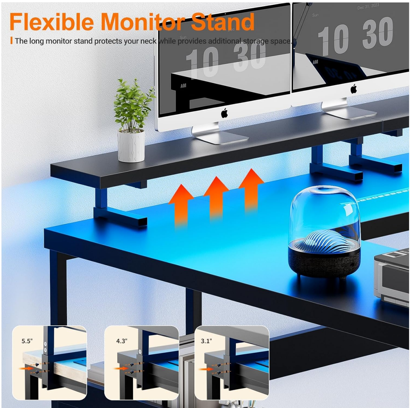
Image: Detail of the flexible monitor stand with adjustable height options.

The long monitor stand protects your neck while provides additional storage space.