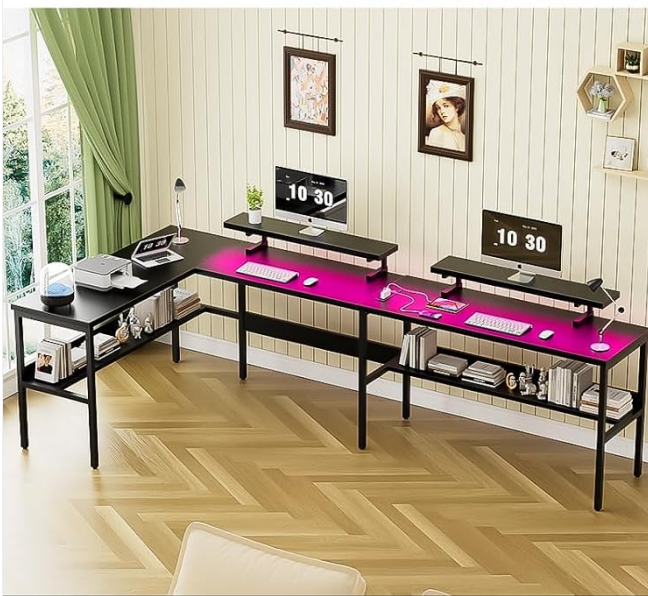
Left L Shaped Desk