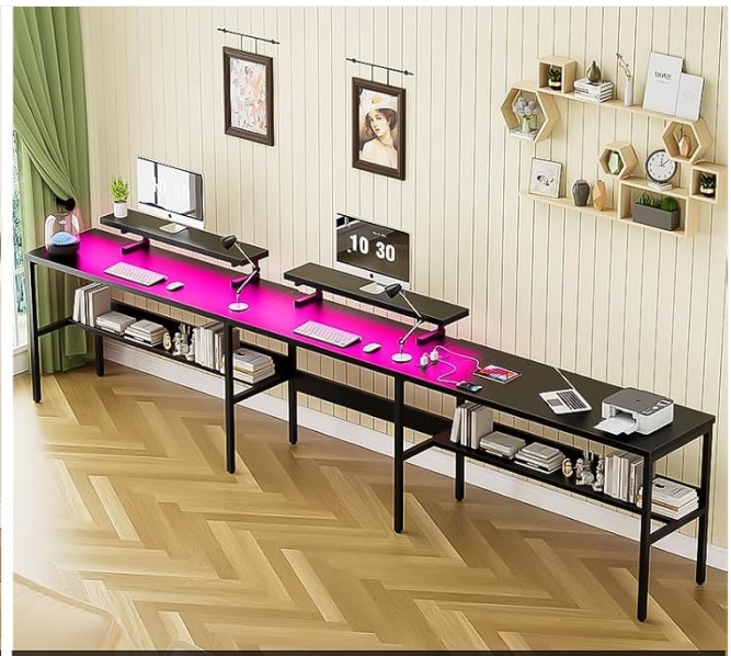
2 Person Long Desk