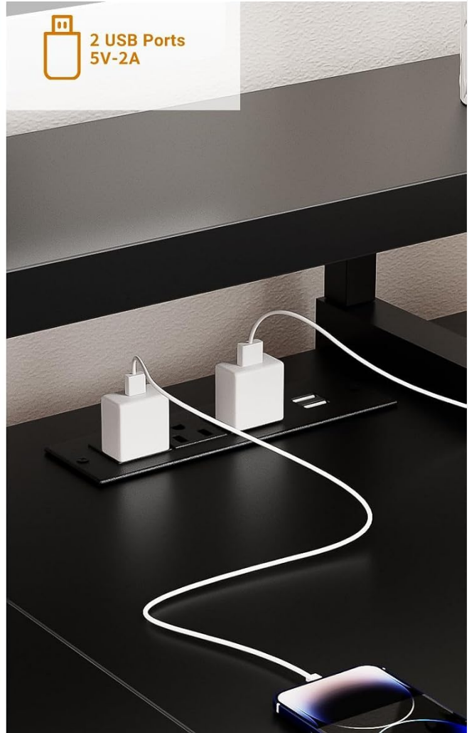
Image: Integrated power outlets and USB charging ports on the desk.