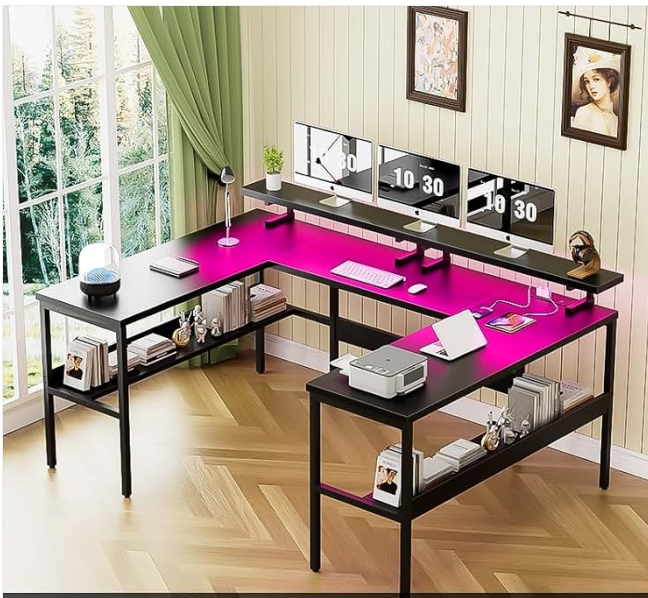
U Shaped Desk