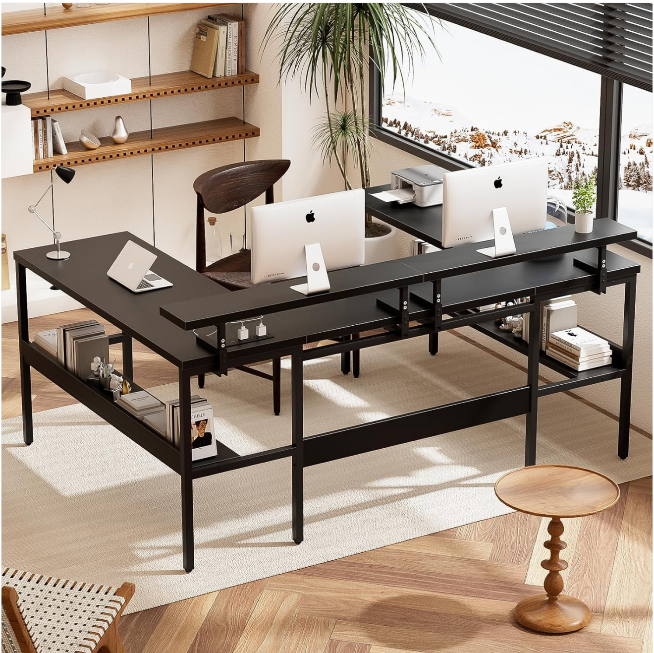
Image: The iSunirm U Shaped Computer Desk configured for a multi-monitor setup in an office environment.