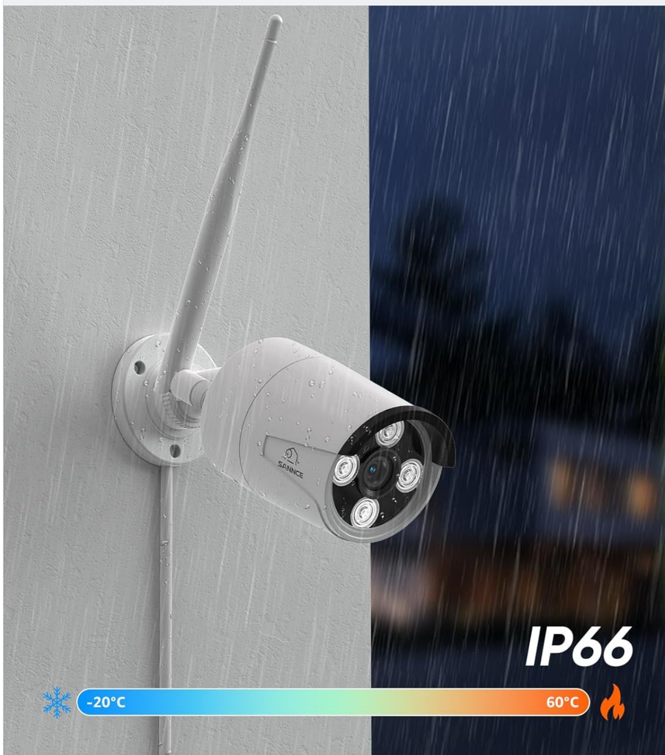
Image: A SANNCE camera with IP66 weatherproofing, shown operating effectively in rainy conditions and capable of withstanding temperatures from -20°C to 60°C.