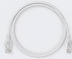
Cat5e Ethernet Cable 3.3ft/1m*1