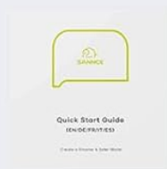
Quick Start Guide*1