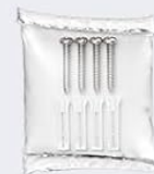
Mounting Screws Bag*5