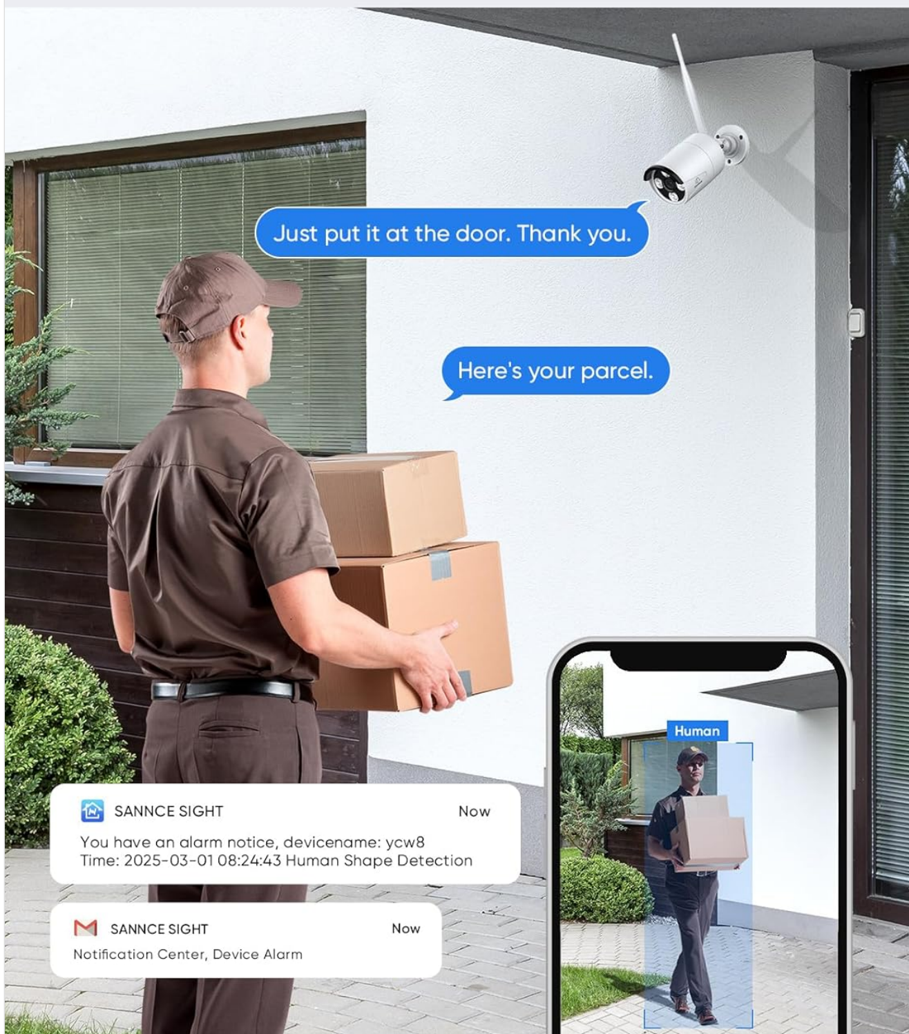
Image: A delivery person at a door, with a smartphone displaying a SANNCE app notification for human shape detection, indicating a parcel delivery.