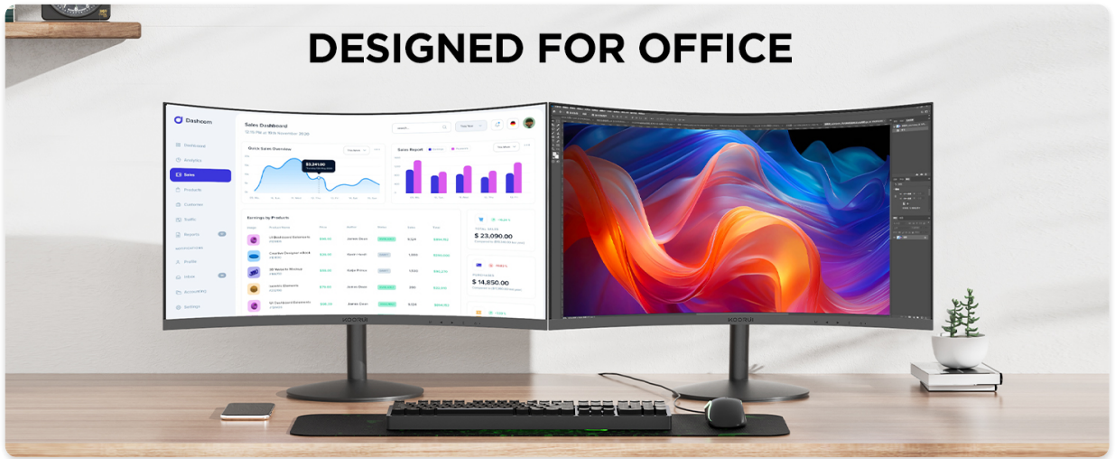
Image: The monitor placed on a desk, illustrating its approximate width of 24.13 inches and the recommended desk space of 60 inches.