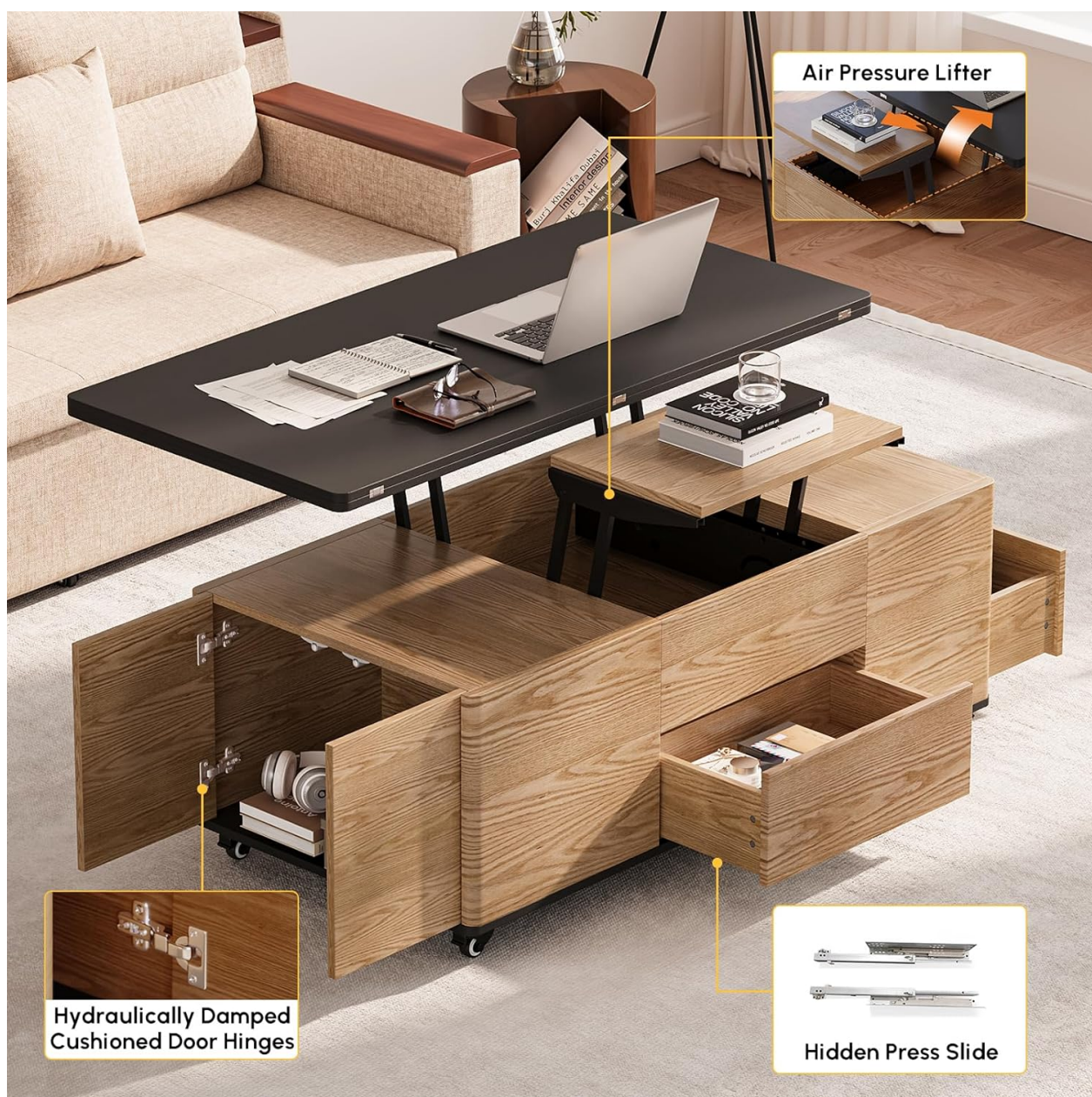
Image 4: The lift-top mechanism in action, transforming the coffee table into a functional workspace.

To raise the tabletop, gently pull the front edge upwards. The hydraulic lift mechanism will assist in smoothly elevating the surface to a comfortable height for dining or working. To lower, push the tabletop down with controlled force until it rests in the coffee table position.