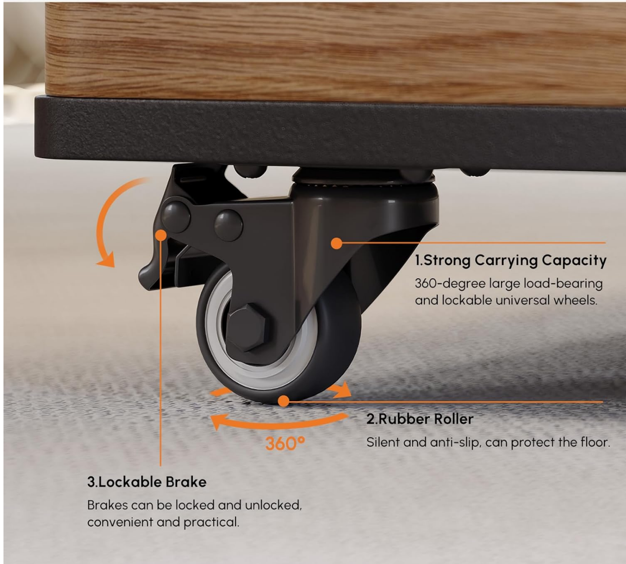
Image 5: Detail of the lockable wheels, ensuring stability when the table is in use.