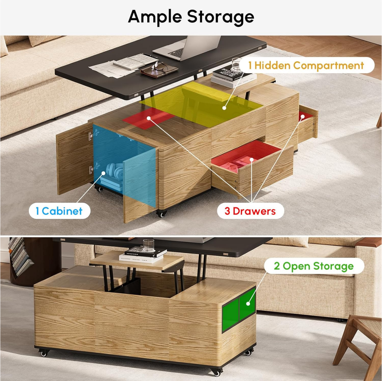
Image 2: Detailed view of the coffee table's ample storage, including a hidden compartment, three drawers, and two open shelves.