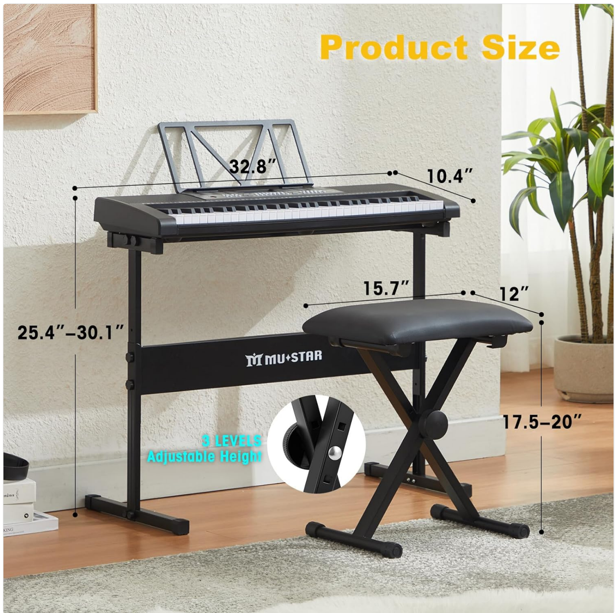
Image: Detailed dimensions of the keyboard and adjustable stand, highlighting the 3-level height adjustment mechanism.