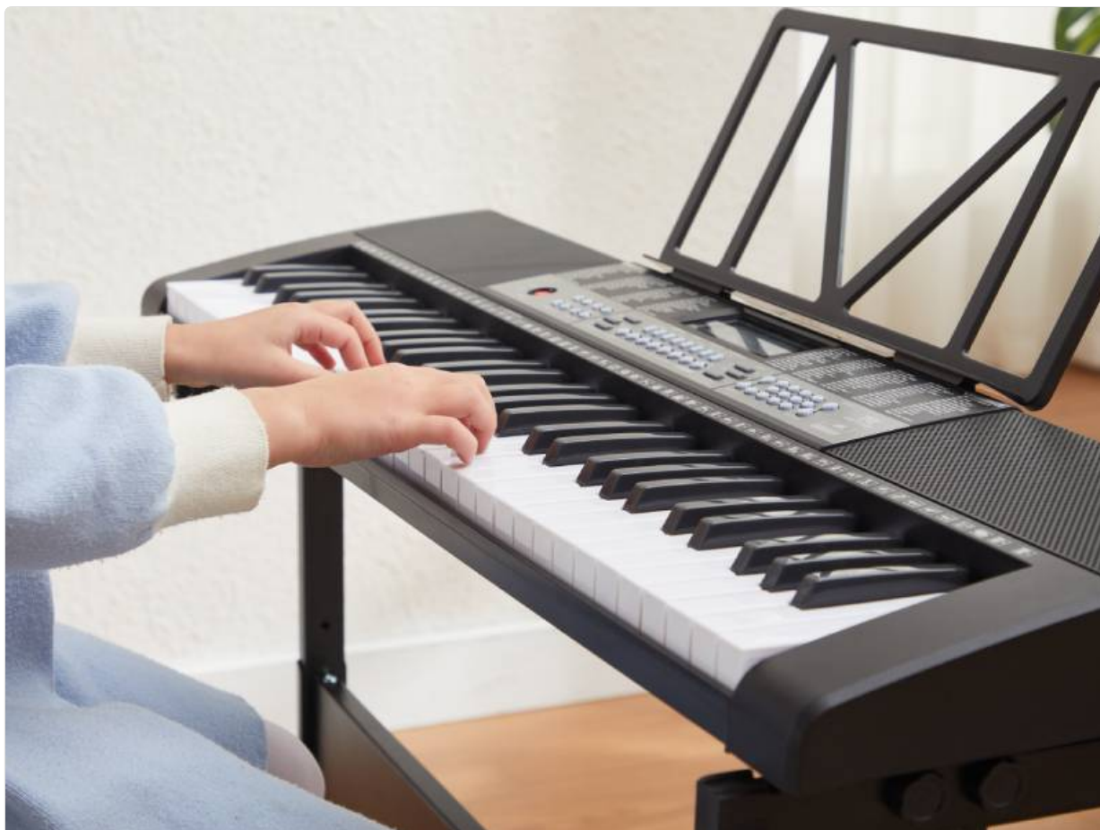
Image: A child actively learning to play the keyboard, with the light-up keys guiding their fingers for an interactive experience.

Video: A user demonstrates the light-up key feature and various sounds of the 61-key electric keyboard, showcasing its interactive learning capabilities.